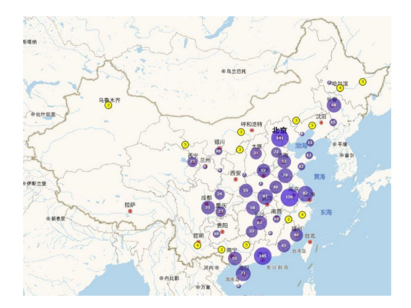
Figure 1. Examples of urban MBRs in China.

by affecting urban drinking water sources; and (3) affecting the quality and image of the municipal service department. Urban rivers play an important role in urban development and so MBRs bring many hazards to the environment and society. The polluted water without appropriate treatment will further contribute to an increased contamination risk along the coast [8]. Given the severe consequences of MBRs, the problem and the treatment of MBRs is attracting greater public attention through television, social media, newspapers, and online resources.