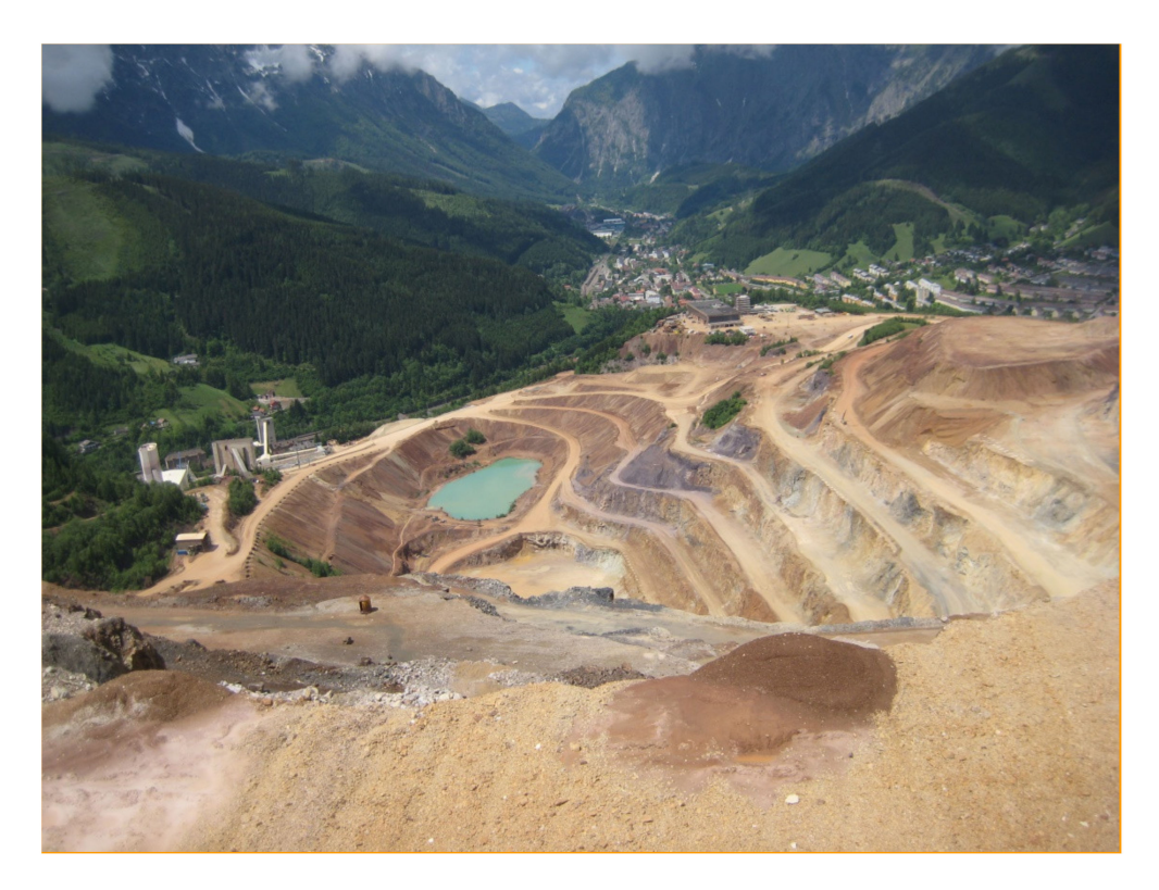
Figure 1. Erzberg and the town of Eisenerz.

national symbol for reconstruction after the Second World War [65] and is now also being exploited for tourism (www.abenteuer-erzberg.at/, accessed on 10 January 2021). Today, the region is also home to the VOEST Alpine steel production site in Leoben-Donawitz and remains a major globalized research and development center in the metallurgy and metal processing industries. Nevertheless, due to globalization and modernization processes, industrial production has steadily lost its importance for the region since the 1960s, especially in terms of employment [66]. This economic transformation has brought about a variety of social changes, most notably profound demographic changes in the region, especially the outmigration of younger people [67].