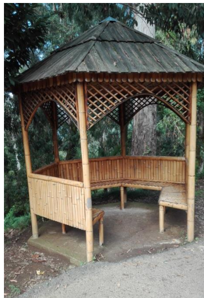
Figure 6. Bamboo gazebo in a garden in Batumi (2019).

Bamboo is an excellent material for the construction of different elements and structures in gardens and zoos, as shown at the Figures 6 and 7 respectively.