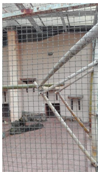
Figure 7 Bamboo elements in enclosure for animals (Batumi 2019).

The main advantages of using bamboo in zoos include sourcing rapidly renewable products, easy replacement during construction or reconstruction of new animal exhibits, and also the provision of a sense of security to animals and help in protecting wildlife habitat. The use of sustainable building materials like bamboo reduces negative environmental impacts such as the deforestation of green areas and other negative and/or destructive practices. Several bamboo products, including sanitary sticks, bamboo brooms, and bamboo fans, have become a daily need for a wide range of people [57]. Bamboo timbers are luxury woody materials widely used in furniture and flooring [11]; they are also the most suitable materials for building development and bridge construction due to their microstructural and mechanical strength [58].