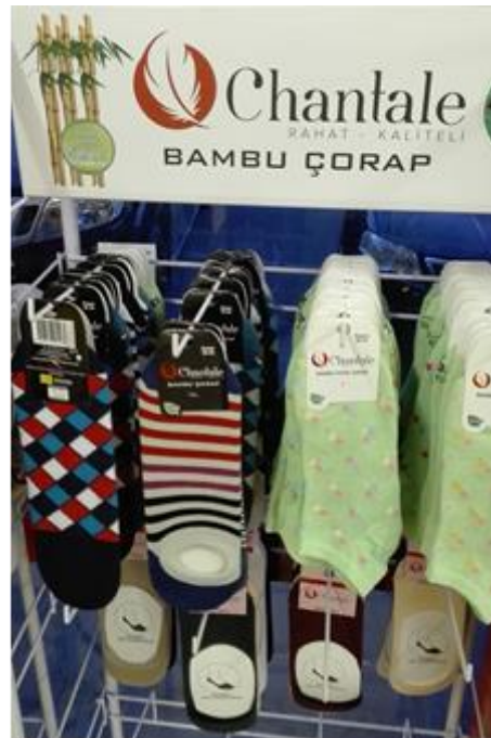
Figure 5. Bamboo socks in a Turkish shop (Artvin 2019).

is perfect for creating new designs that meet fashion expectations. Figure 5 shows bamboo textile products. Due to its properties, bamboo can be used as excellent textile material.