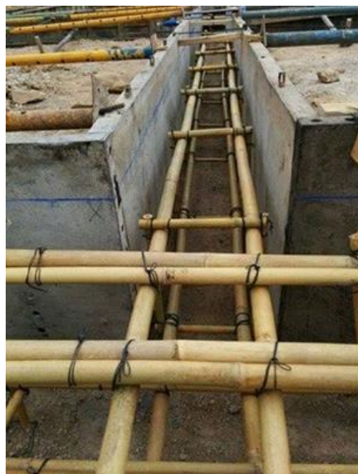
Figure 4. Bamboo in replacement for steel reinforcement.

Burning bamboo produces ash with potential applications in construction. Dry bamboo ash is used as a concrete additive to make cubes, cylinders, and beams. The addition of bamboo ash increases the compression module of concrete cubes, the tensile module of concrete cylinders, and the bending strength module of concrete beams [45]. The addition of bamboo ash improves concrete's strength and shortens setting time, improves consistency, compaction factor, precipitation, and water absorption. Therefore, adding bamboo ash saves construction costs and improves concrete's properties [46].