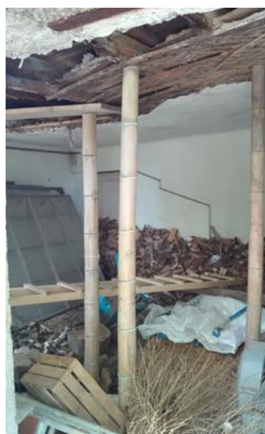
Figure 3. Ceiling support (Batumi 2019).

Due to the presented properties in the Table 1, bamboo is widely used in construction. Figures 3 and 4 show examples of bamboo serving as a pole supporting the ceiling and elements in strengthening the foundations.