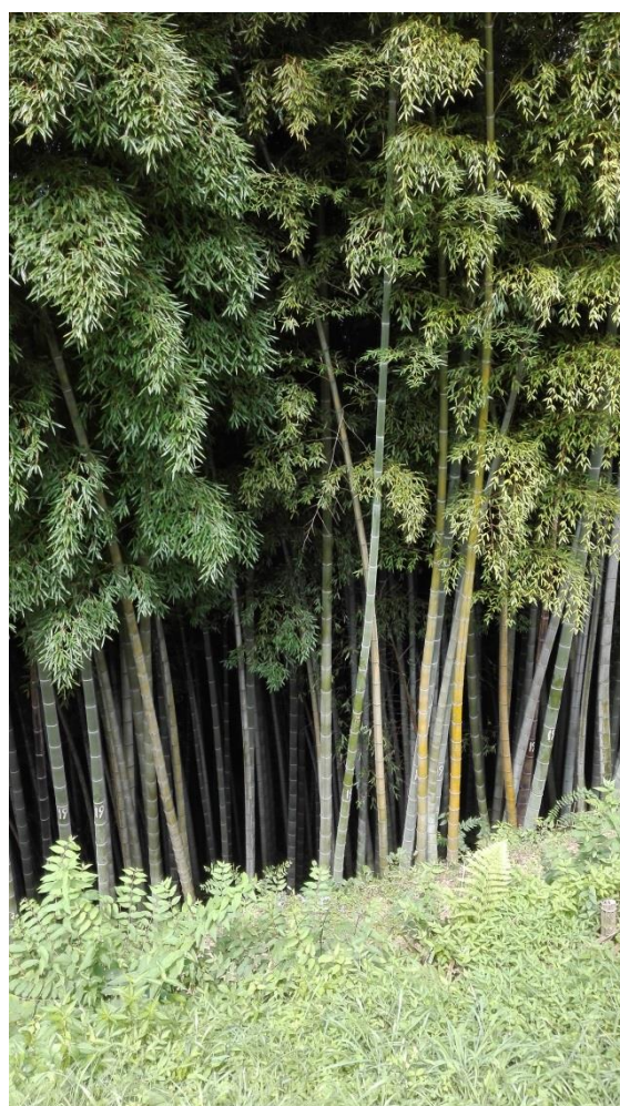
Figure 2. Bamboo ( Phyllostachys pubescens Moso Bamboo) forest in Batumi (Georgia, Caucasus).

These estimates suggest that growing bamboo on 10 million hectares is equivalent to saving primary energy consumption for more than 300 million new electric cars. This statistic does not include the emissions saved by replacing aluminium, concrete, plastic, or steel with bamboo. The replacement of traditional building materials can therefore contribute to a positive environmental and climate change impact.