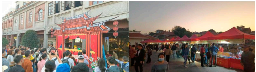
Figure 3. The cultural experience process among the new generation.

Quanzhou currently boasts Zhongshan Road, a historic street imbued with numerous tangible and intangible cultural heritage elements. This vibrant street vividly showcases the native lifestyle of Quanzhou urban residents and the unique local cultural traditions, which can provide a “narrative” axis for cultural experiences [35]. Through heritage tourism, visitors can directly experience the cultural landscapes, performances, local cuisine, handicrafts, and cultural activities of the past and present. Therefore, it is widely regarded as a tool for community economic development [36].