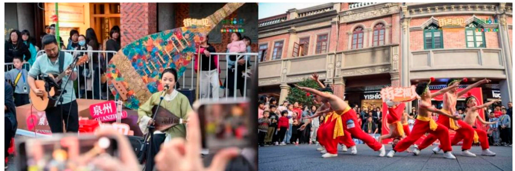
Figure 2. Zhongshan Road multicultural exhibition.

cultural tourism in a unique and appealing way. Through this service experience innovation, the tourism industry in Quanzhou can stand out in a fiercely competitive market (Figure 3).