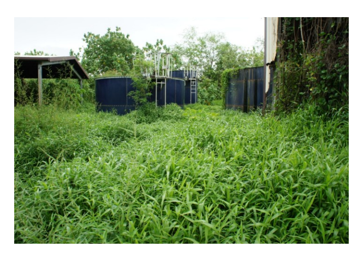
Figure 6. Inoperative industrial wastewater treatment plant of tuna-packaging plant on Pohnpei.

Septic tanks on Pohnpei are typically constructed with an adjoining seepage well rather than a leaching field and it is said that drawing excess sludge from the tanks is almost non-existent—only one tank is serviced every 2 or 3 years—even though PUC does have a pump truck for that purpose. The capital area in Pilikir Village is served by a very large septic tank of approximately 120,000 gal (450 m³) with a footprint of approximately 20 by 40 ft (6 by 12 m) and a leaching field said to extend 100 yards (90 m). This facility appears to be intended for use by the government complex, though a lift-station has been installed to tie in nearby residences.