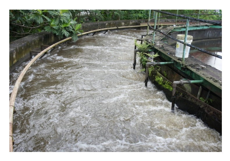
Figure 5. Contact-stabilization type activated-sludge wastewater treatment plant on Pohnpei.

Influent to the wastewater treatment plant does not include industrial wastewater, though it does receive inputs from restaurants and kitchens and thus would include some fats, oils, and grease (FOG). However, there is a tuna-packaging plant in the industrial zone near the airport with its own wastewater treatment plant that is currently inoperative (Figure 6). Ownership of that treatment plant is said to have been transferred to PUC about a decade ago, though the tuna-packaging plant is still in business and, apparently, discharging untreated industrial wastewater directly to the bay. Though not actively investigated in this study, it is known that there are a lot of piggeries on Pohnpei, from which runoff of swine waste into the bay (or elsewhere) is considered to be a significant problem. While there are said to be a couple of digesters for larger operations, the vast majority of this waste discharge appears to be going untreated.