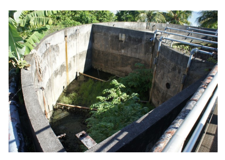
Figure 7. Inoperative wastewater treatment plant on Weno Island in Chuuk state.

There are, apparently, no industrial wastewater sources on Weno that would contribute to the soon-to-be-refurbished treatment plant other than FOG from restaurants and possibly discharges from laundromats and automotive shops. However, there are various farming activities, including household pigpens, which could constitute sources for agricultural wastewater that would require some form of treatment if environmental discharges become an issue.