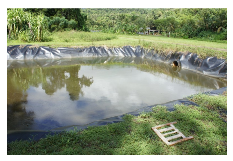
Figure 4. Lined leachate catch pond at the "Fukuoka-type" landfill on Kosrae.

A solid-waste landfill (Fukuoka type—semi-areobic landfill technology) was installed on Kosrae in 2010, which includes a leachate collection system. While the landfill, per se, would not be a part of this study, the leachate generated at the landfill would be of concern as an industrial wastewater. The leachate flow is mostly a function of the amount of rainfall over the exposed landfill and is collected in a catch pond with an impervious lining (see Figure 4). Out-flow from the pond passes through a gravel-sand bed and is discharged into the coastal mangrove. The leachate is tested for chemical oxidation demand (COD—an aggregate indicator of organic compounds) and pH on a monthly basis with each testing event consisting of multiple measurements taken from the leachate and nearby environmental samples. Test results have consistently been below the imposed regulatory limits of 100 mg COD/L and pH of 10, which is attributable to diligent segregation of waste materials prior to deposition. In the event of a violation of effluent quality requirements, the public is to be alerted to avoid the discharge area. If discharge quality does become an issue in the future, some form of treatment process would have to be considered.