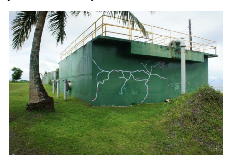
Figure 8. Imhoff tank wastewater treatment plant in Colonia Village, Yap, with a map of the sewer network painted on wall.

For solid waste disposal, there is only a waste dump on Yap, which does not employ leachate collection; though a new landfill is under construction (at the time of this report), which will include a leachate collection system as employed on Kosrae. The landfill leachate will constitute an industrial wastewater, which will require monitoring and would require treatment if discharge standards are not met.