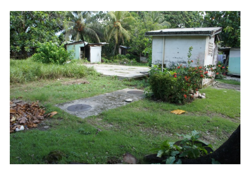
Figure 3. Typical outhouse with adjoining septic tank in Lelu Village, Kosrae.

A solid-waste landfill (Fukuoka type—semi-areobic landfill technology) was installed on Kosrae in 2010, which includes a leachate collection system. While the landfill, per se, would not be a part of this study, the leachate generated at the landfill would be of concern as an industrial wastewater. The leachate flow is mostly a function of the amount of rainfall over the exposed landfill and is collected in a catch pond with an impervious lining (see Figure 4). Out-flow from the pond passes through a gravel-sand bed and is discharged into the coastal mangrove. The leachate is tested for chemical oxidation demand (COD—an aggregate indicator of organic compounds) and pH on a monthly basis with each testing event consisting of multiple measurements taken from the leachate and nearby environmental samples. Test results have consistently been below the imposed regulatory limits of 100 mg COD/L and pH of 10, which is attributable to diligent segregation of waste materials prior to deposition. In the event of a violation of effluent quality requirements, the public is to be alerted to avoid the discharge area. If discharge quality does become an issue in the future, some form of treatment process would have to be considered.