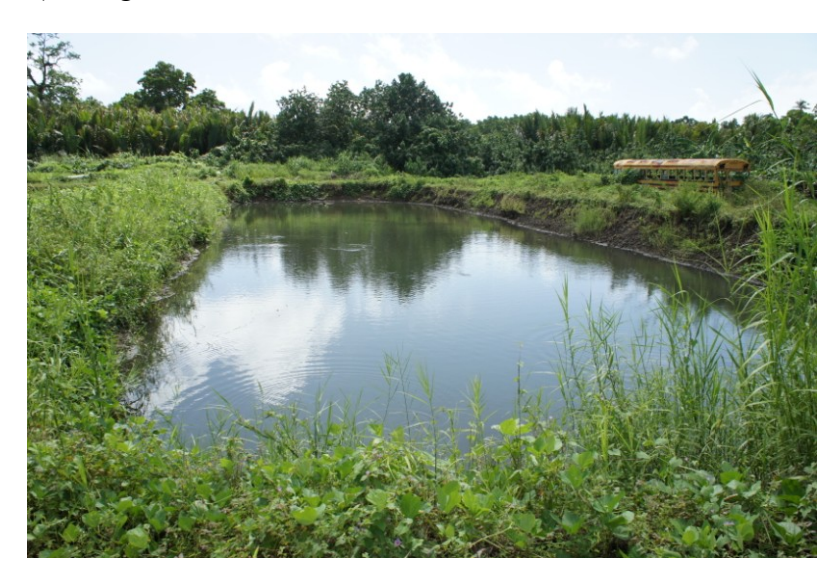
Figure 2. Wastewater treatment system in Kosrae consisting of three oxidation ponds (only one pond shown).

Installation of septic tanks has not been governed by any specific design standards for setbacks or density ( i.e. , number of tanks per unit area). Typically, they have been constructed on a per-family basis and included an adjoining "out-house" consisting of a partially enclosed concrete structure with shower, sink, and toilet (Figure 3). About twice a month a pump truck draws excess sludge from one septic tank and transports it to the oxidation ponds, thus the vast majority have not been serviced during the 15 or more years since their installation. Nonetheless, the septic-tank culture does appear to be functioning well. However, septic tanks only provide a primary level of treatment, i.e. , effluent is essentially raw sewage minus the solid material that has settled out in the tank, thus the impact of discharges on receiving water bodies (both the ocean and groundwater) would be a point of concern.