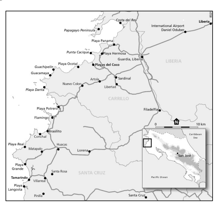
Figure 1. Research area: the coast of Guanacaste, Costa Rica.

Costa Rica has been a well-known relocation destination for North Americans for decades, but these migration flows have recently intensified and extended geographically to new coastal areas, which has made them much more concentrated and visible. Costa Rica's fame as an ecotourism destination has been complemented by the image of a country "for sale", a real estate frontier and relocation "paradise" for increasing groups of North Americans. Particularly in the mid to late 2000s, many coastal parts of the country underwent a rapid real estate boom, which was largely driven by international residential tourism. This research focuses on the northwest coastal region of Costa Rica (Guanacaste province), which has been the country's main area of real estate and residential tourism growth in the past decade (Figure 1). In the 2000s, Guanacaste changed from a small-scale tourism destination to an area of exponential large-scale and residential tourism growth, including real estate investment. From 2001 to 2006, the two main cantons in the research area (Santa Cruz and Carrillo) were among the main areas of construction growth in Costa Rica, which was mainly due to residential tourism: the area of new constructions in square meters increased exponentially (annually 159% in Santa Cruz and 66% in Carrillo) [31]. This high growth contrasts with steep declines during the worldwide economic crisis, particularly from 2008 onwards.