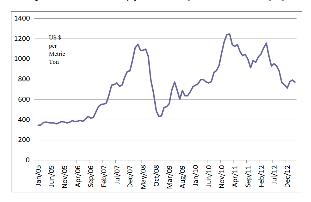
Figure 1. Palm oil monthly price—January 2005–March 2013 [16].

All three respondents ultimately did expect to be able to sell below the local fossil diesel price of Mtc 35–38 per liter (2012). Their intended local SVO selling price ranged from US$ 600–1200 per tonne (Mtc 18.75–35.80 per liter). The lower bound in this range seems a realistic price to aim for, given the fact that the feasible domestic price closely follows the international fossil and palm oil prices. The international palm oil price fluctuated between roughly US$ 400–1200 per tonne between 2005 and March 2013 (see Figure 1) and it should be considered highly unlikely that the world price of palm oil crude will sink below US$ 600 for prolonged periods of time within the coming decades, even in spite of the prolonged recessionary conditions in Europe. However, the upper bound in the quoted price range seems too optimistic on the part of the respondent. The average monthly price of palm oil crude over the period July 2007 ( i.e. , at the end of the era of low prices) to March 2013 was US$ 868 (Own calculation based on data from [16] well below US$ 1200.