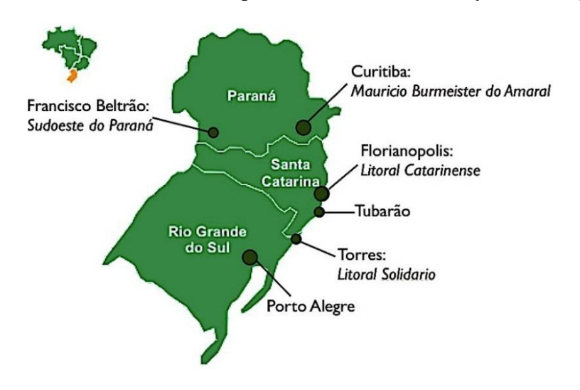
Figure 3. Cities and nuclei of the Rede Ecovida de Agrecologia considered in the survey.

The data used in this study are drawn from responses to a survey instrument administered between January and March 2011 in three nuclei of the Rede: Litoral Solid ário, Litoral Catarinense, and Sudoeste do Paran á Four nuclei of the Rede operate in the areas of analysis (see Figure 3).