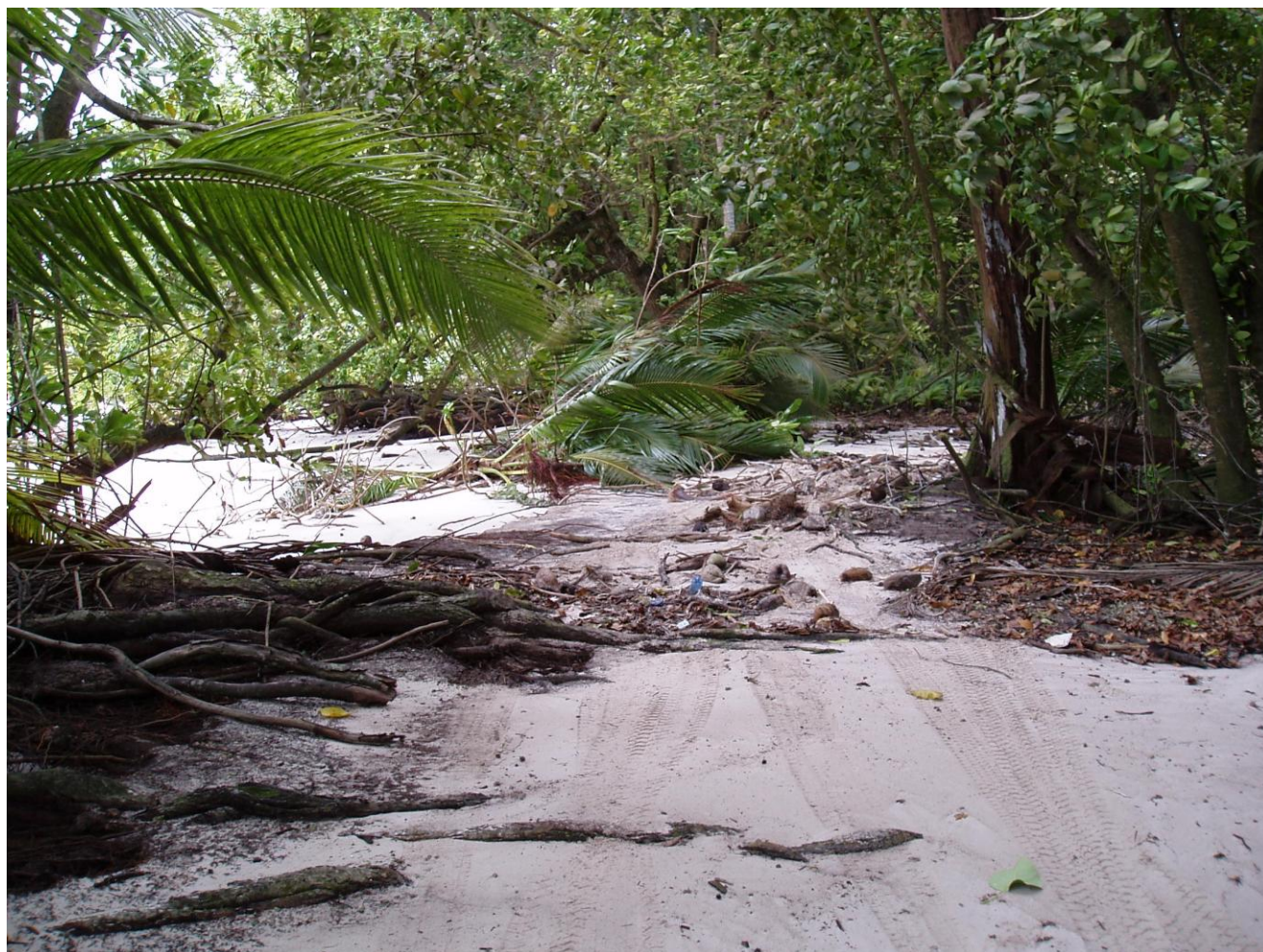
Figure 4. Sheltered, lagoon facing shore showing ingress of white sand onto the island. The raised ridge that mostly separates the beach from the interior of the island has disappeared along considerable lengths of the lagoon facing shore.