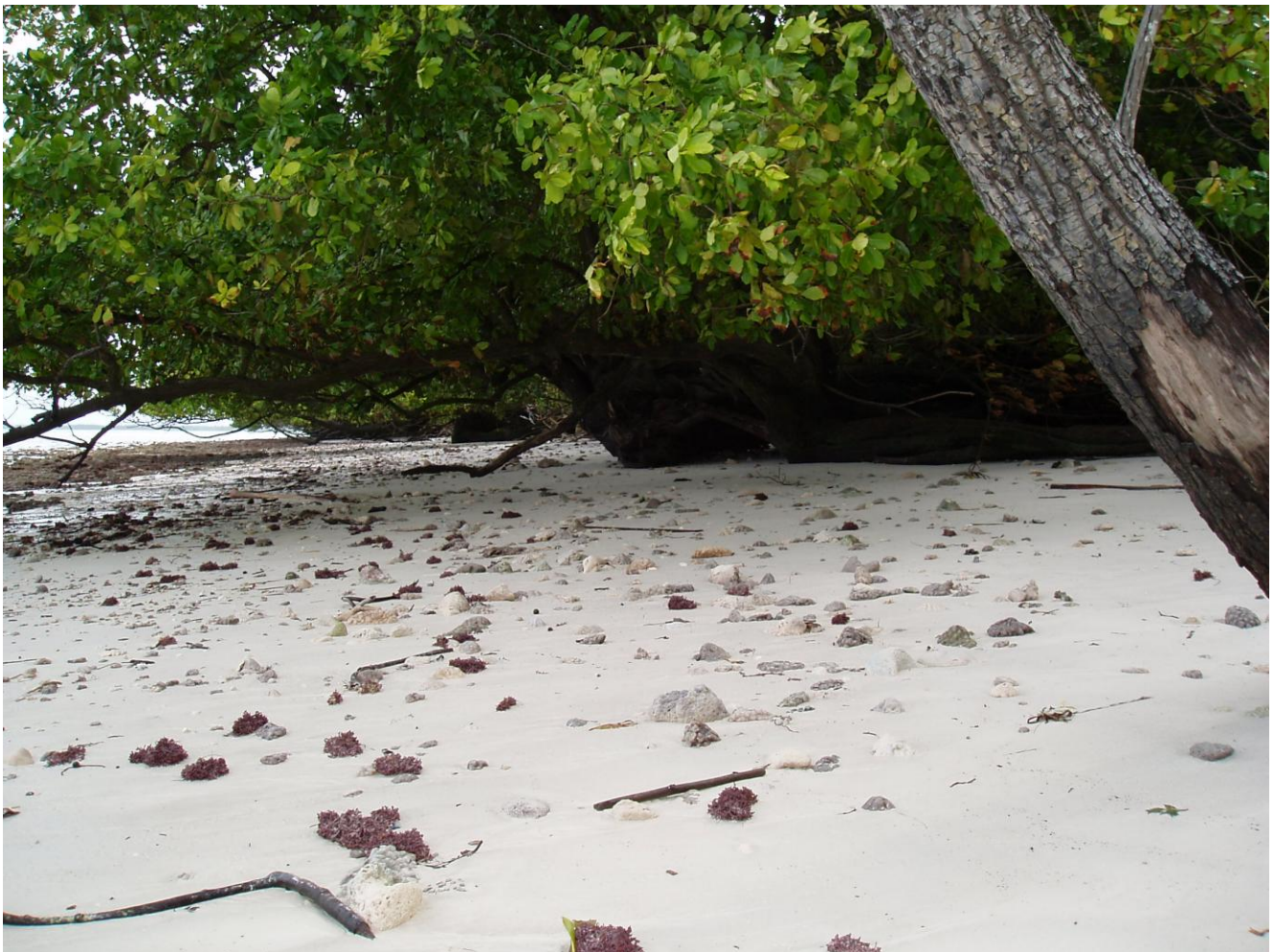
Figure 2. Hardwoods with large canopies now overhang the beach, instead of smaller canopied palms. These overhangs alone can add a few tens of metres to any measurement of shoreline position that uses vegetation edge to define extent of land.

In this area, there are further important changes that are not observable from vertically above. In the southeastern part of the atoll, the land is very low lying, becoming inundated more frequently at high tides in the last decade, by increasingly noticeable amounts. The raised ridges or berms that usually separate beaches from the interior of coral islands have been washed away in several areas, to the extent that they have completely disappeared over long stretches of lagoon coast, easing seawater