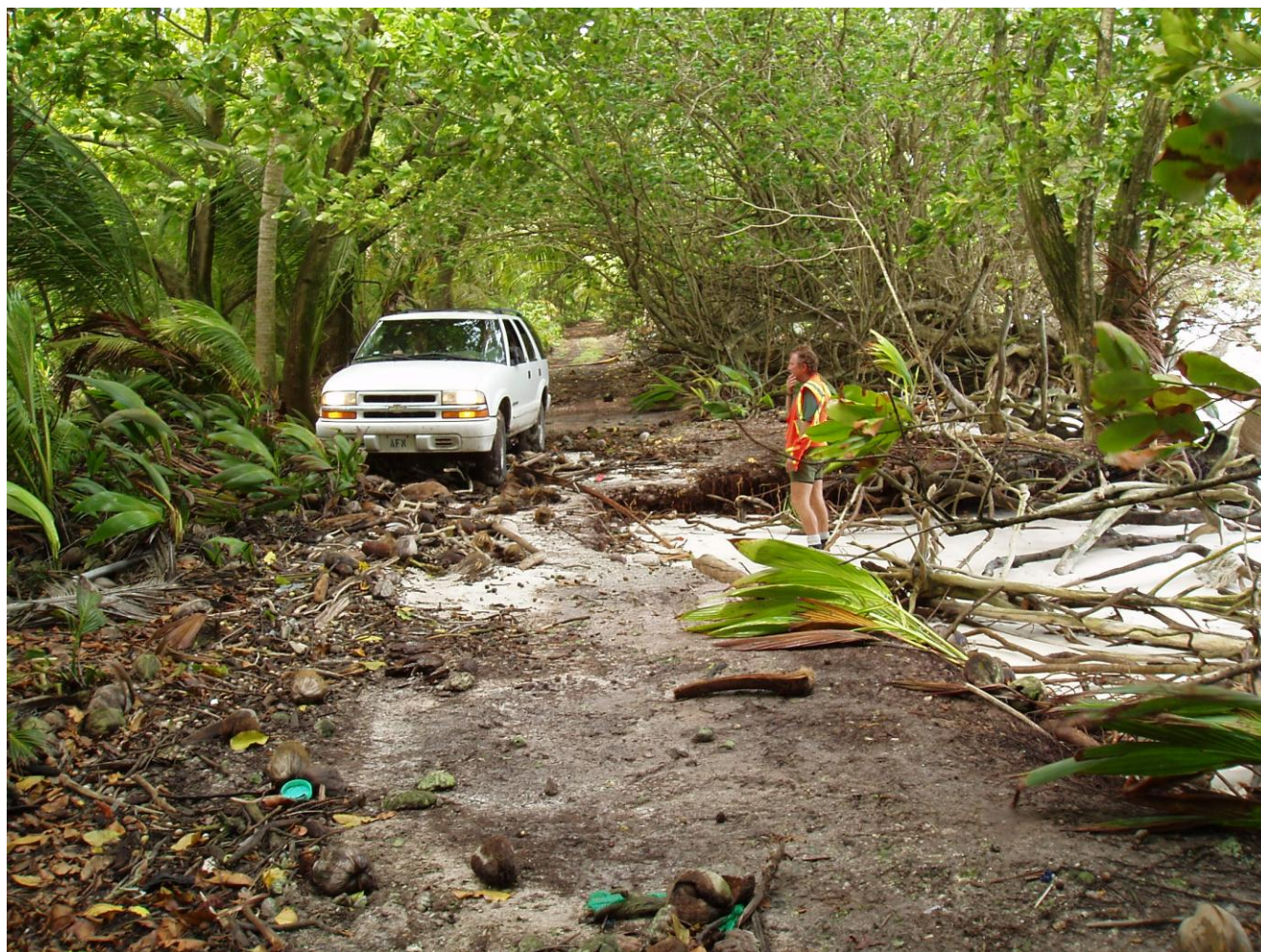
Figure 3. Erosion on a sheltered, lagoonal facing shoreline. The erosion is of mature, dark soil, not transient white sand banks.

The western arm of this atoll supports a military base, where the cost of “hardening” short stretches of lagoon and seaward shoreline against overtopping and other seawater flooding is now $10 million per year. While that “urbanised” section of the atoll cannot be regarded as natural and has extensive areas of artificial landfill, this does suggest emerging problems everywhere rather than accretion and stability of land.