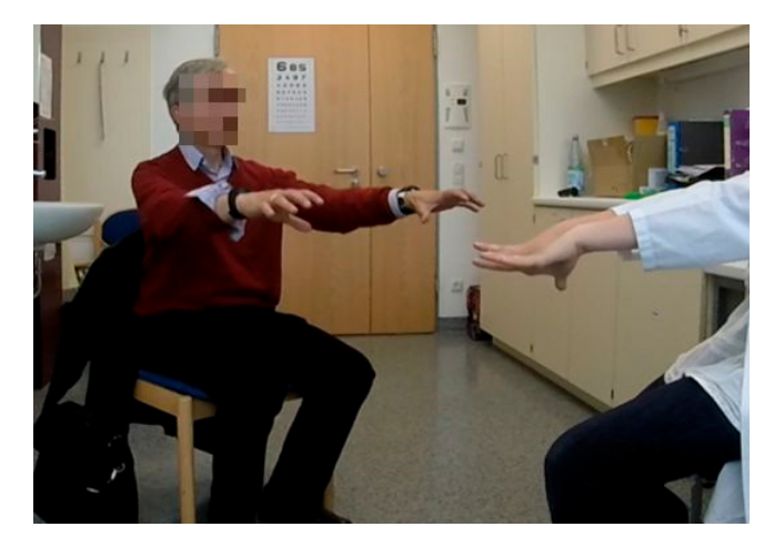
Figure 1. Standardized medical examination of upper extremity (UE) tremor.

Data collection was performed in a clinical lunch setting at the Department of Neurology of the Technical University Dresden (TUD), Germany. The study included: (i) a standardized meal served in front of two video cameras, and (ii) a medical evaluation (Figure 1) with regard to normal bodily effort, which also included examination of medical history, validated questionnaires and scales about motor and non-motor symptoms of PD, as well as a standardized assessment of olfaction, taste and swallowing. The study protocol was identical for PD patients and healthy controls and was completed in all cases in the outpatient facilities of the Neurological Clinic. All PD patients were assessed during "ON" motor state (e.g., all PD patients performed the study assessments at the time point of the best PD symptom control as possible by intake of anti-Parkinson's medication [31]) in order to better standardize motor symptoms among the included PD patients. The participants were instructed to avoid eating a late breakfast or lunch before coming to the study.