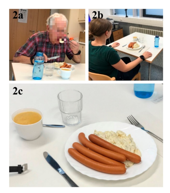
Figure 2. ( a , b ) The clinical lunch setting, and ( c ) the food that was served during the lunch meal (200 g sausages, 400 g potato salad, and 200 g apple purée).

Each study participant ate a standardized meal in a quiet room dedicated to the experiment around their usual lunch time (11:00–15:00) during a weekday (Figure 2a,b). The same room was used for all meals. Each participant was seated at a table in front of two video cameras (GoPro HERO 5 [34], recording at 1920 \times 1080 resolution with a rate of 30 frames per second). One camera was placed to the left and one in front of each participant. The camera distance was around 1 m and participants ate their meals alone. Additionally, each participant wore two smartwatches (one was attached to the right wrist and one to the left wrist) in order to collect accelerometer and gyroscope data that were used to develop an automatic bite counter algorithm to allow for the analysis of intake microstructure/mechanics [35,36]. These data are not part of the current analysis and the additional equipment did not otherwise affect the study.