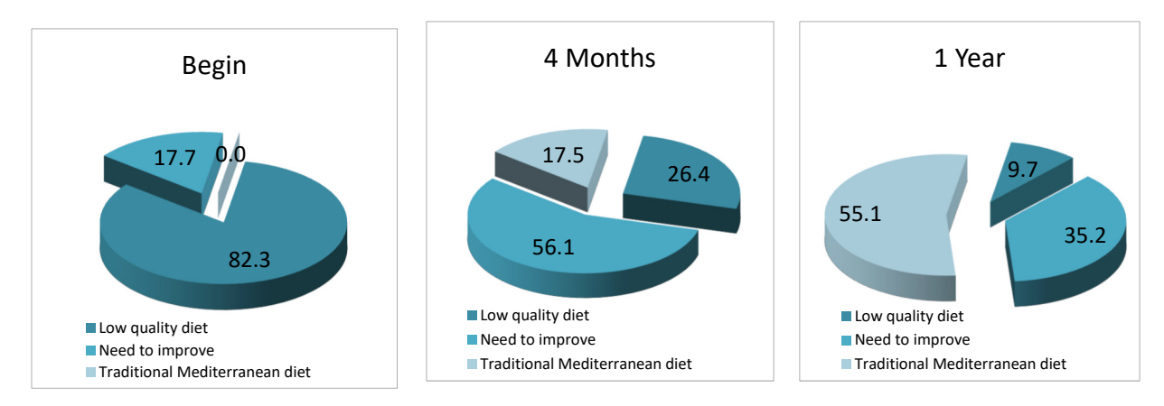
Figure 2. Evolution of quality of diet, measured using TMD Test.

At the beginning of the study, the mean value of the DMT-Test was 6.91 \pm 1.98 , qualifying as a poor quality diet. 82.3% of the sample obtained a score below 8 points (poor quality diet) and 17.7% obtained a score between 8 and 14 points (need for improvement). At the end of the study, the mean score was 16.3 \pm 1.90 points, qualifying as an Optimal Traditional Mediterranean Diet. (Figure 2). The TMD test evolved from levels considered to be low quality to optimal levels (Table 8 and Figure 2).