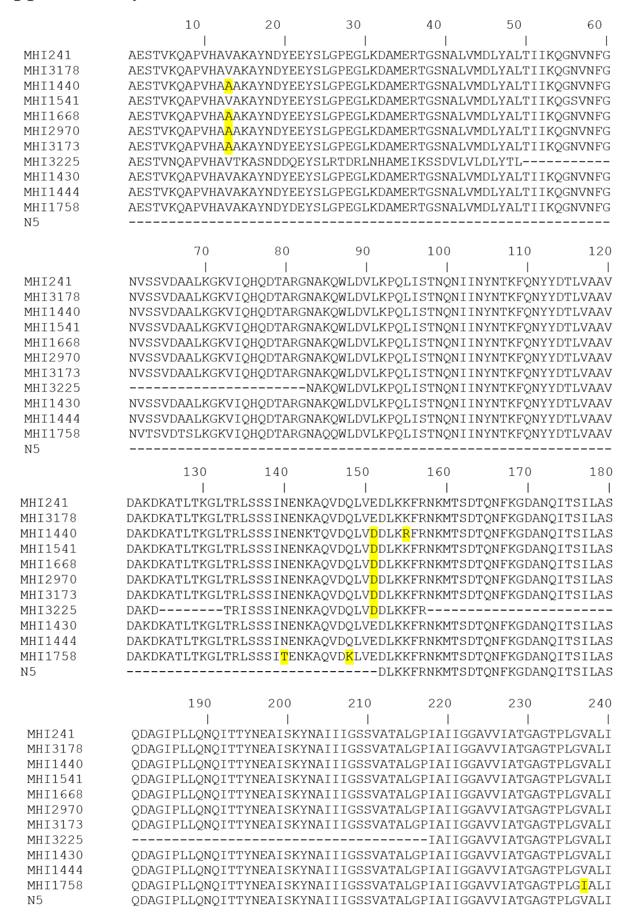
Figure S1. Cont.