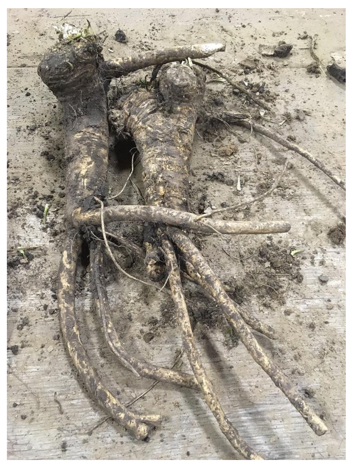
Figure 3. Horseradish cultivar 906, released in 2012 from the Illinois, USA breeding program. This cultivar resulted from a proven cross of 1573 (high primary root biomass, but highly susceptibility to internal root discoloration) \times 315 (high primary root biomass and high tolerance to internal root discoloration).