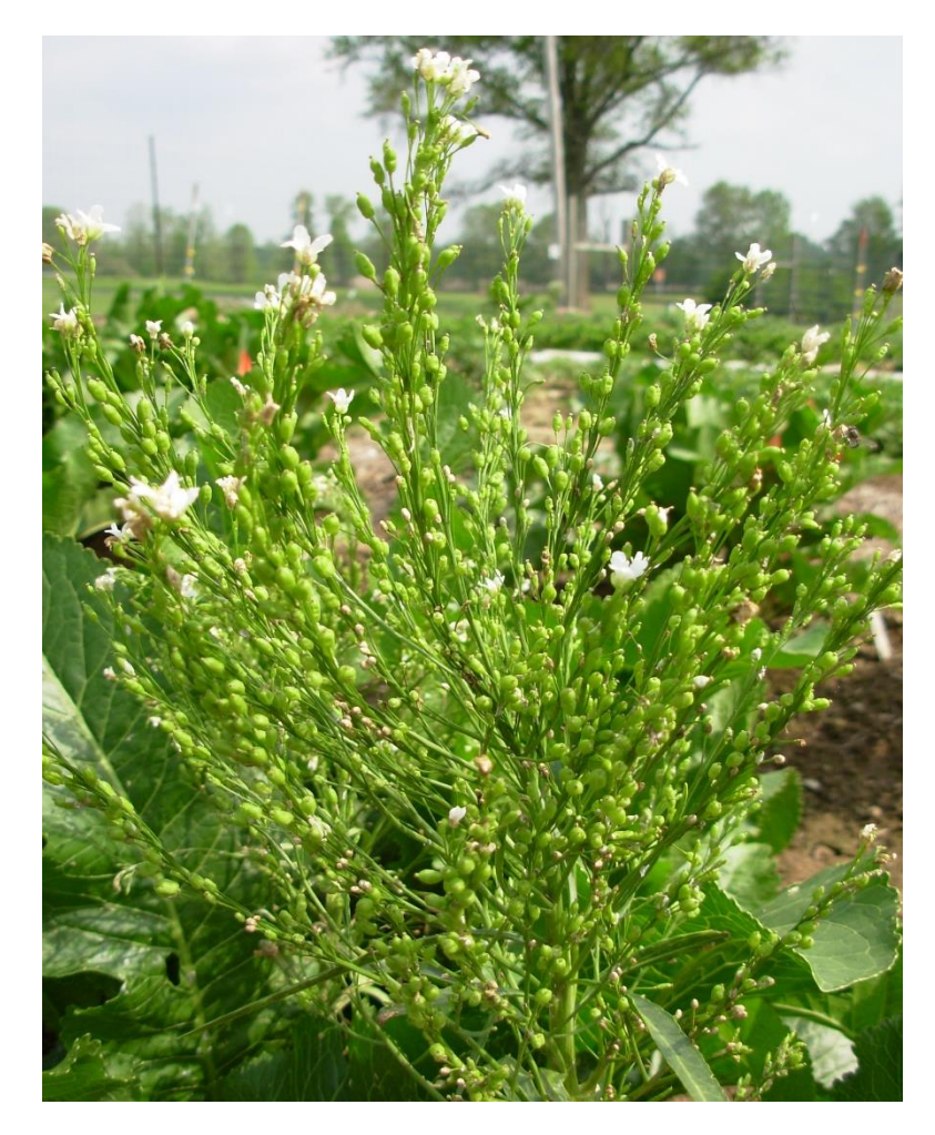
Figure 1. Horseradish inflorescence with maturing seed pods during mid-spring outdoors in a polycross field block.

probably occurs. The proven cross method (with specific directed crosses made by hand) has been used in more recent years to target specific genetic combinations. Comparisons of data obtained from the Illinois, USA breeding program for the two methods (polycross: 2007 to 2011, and proven cross: 2009 to 2017) indicate that the proven cross method is more efficient since less progeny are required to evaluate under field evaluations to produce new advanced clones compared to the polycross method (Table 1). However, both of these techniques will result in new, superior genotypes, and can be further repeated by inter-mating of advanced clones that were recently selected.