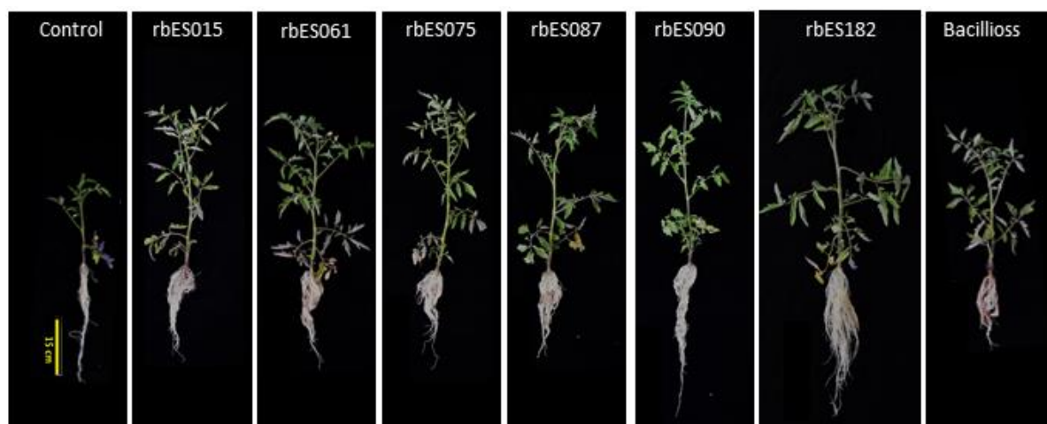
Figure S3. Effect of the inoculation of different bacterial isolates on the growth of S. lycopersicum . Images were adjusted to scale using a reference ruler (depicted now only in control)