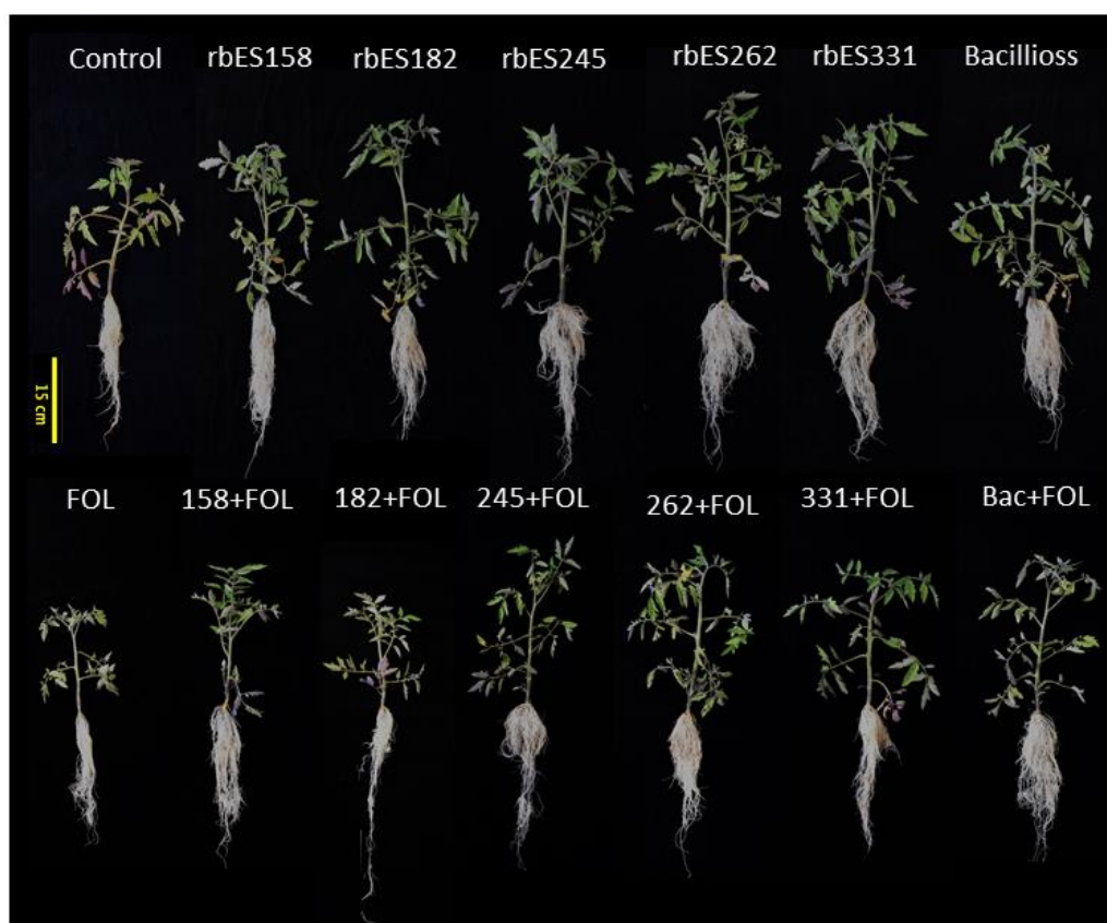
Figure S4. Effect of Fusarium oxysporum on the growth of S. lycopersicum inoculated with different bacterial isolates. Images were adjusted to scale using a reference ruler (depicted now only in control)