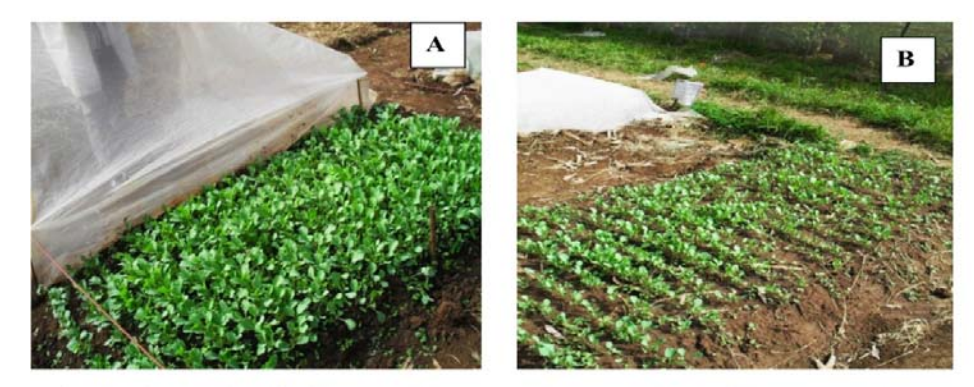
Plate 1: Three weeks old cabbage seedlings (A) under net covering and (B) unprotected

Figure 2. Seedling size as influenced by the net covering. The Net treatment was covered with a fine mesh net 0.4 mm pore diameter. The control treatment was mulched with dry grass, as is the standard practice used by farmers in the region.