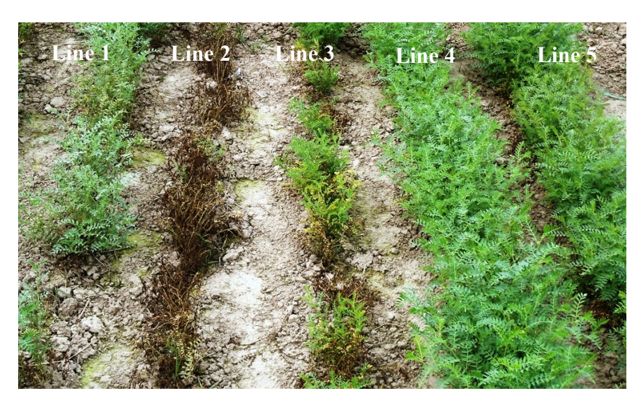
Figure 3. Variation for herbicide tolerance in chickpea. Left to right Line #1 (score 3.0), Line #2 (score 5.0), Line #3 (score 4.0), Line #4 (score 2.0) and Line #5 (score 2.0).

The response of 11 tolerant to moderately tolerant (score 2–3) and 3 highly sensitive (score 5) genotypes for resistance to imazethapyr was confirmed by repeating screening of these genotypes at IIPR-Kanpur (Table 2). The herbicide tolerance scores in the repeat experiment were almost similar to those obtained in the first experiment.