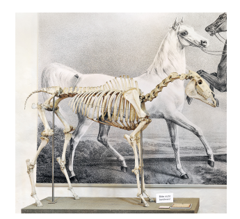
Figure 1. Skeleton of the Arabian stallion Bairactar Or. Ar. (1813–1838) in the Stud Museum Offenhausen in Germany. A tooth from this skeleton was used for DNA analysis.

A molar tooth of the stallion Bairactar Or. Ar. (1813–1838) was taken from his skeleton at the Stud Museum Offenhausen in Germany (Figure 1). To avoid contamination, DNA extraction was performed in the clean room of the Central Research Laboratories at the Natural History Museum in Vienna.