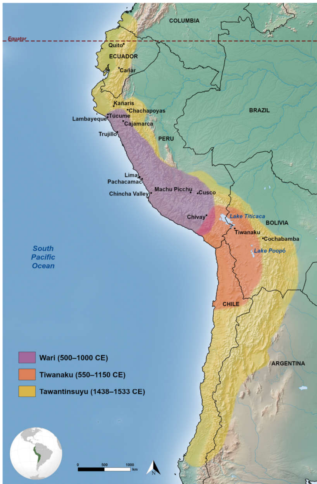
Figure 1. Political regions in the Andes. The Tiwanaku sphere (orange) and Wari sphere (purple) are overlaid with the maximal range of Tawantinsuyu (yellow). Locations mentioned in the text are also shown. Globe inset shows the location of Tawantinsuyu in the American continents. Made with Natural Earth.