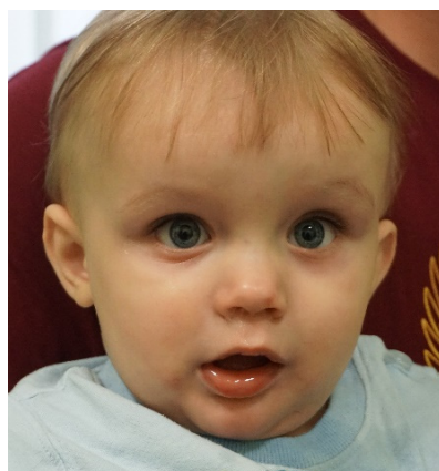
Figure 1. The child with Joubert syndrome.

The child was born by cesarean section at term at 38 weeks with symptoms of birth asphyxia (neonatal parameters: weight 3100 g, length 52 cm, OFC 34 cm). Respiratory failure, perinatal hypoxia, and muscular hypotonia were observed, and polycystic kidneys and ventricular septum defects were confirmed. Brain imaging (USG, CT) after birth showed no changes; cerebellar structures were described as normal. No typical facial dysmorphic features were recognized (Figure 1).