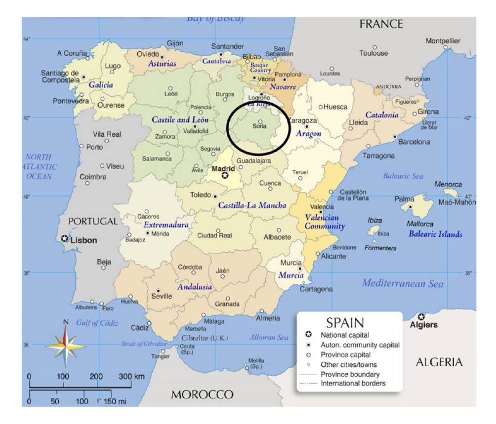
Figure 1. Map of Spain with the location of the province of Soria.

As you can see in Figure 1, this province is located just 300 kilometers northwest of Spain's capital, Madrid. The enormous demographic "desertification" that the province has suffered, together with the disappearance of many municipalities and the loss of cultural heritage, has led to a redistribution of the province's population [30]. The population has become concentrated in those towns and cities that were already larger, with the city of Soria—the provincial capital—benefitting the most.