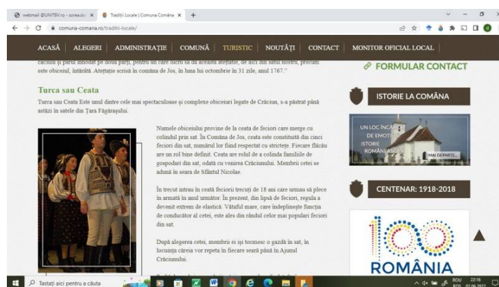
Figure 8. Girls and caroling lads in Comăna.