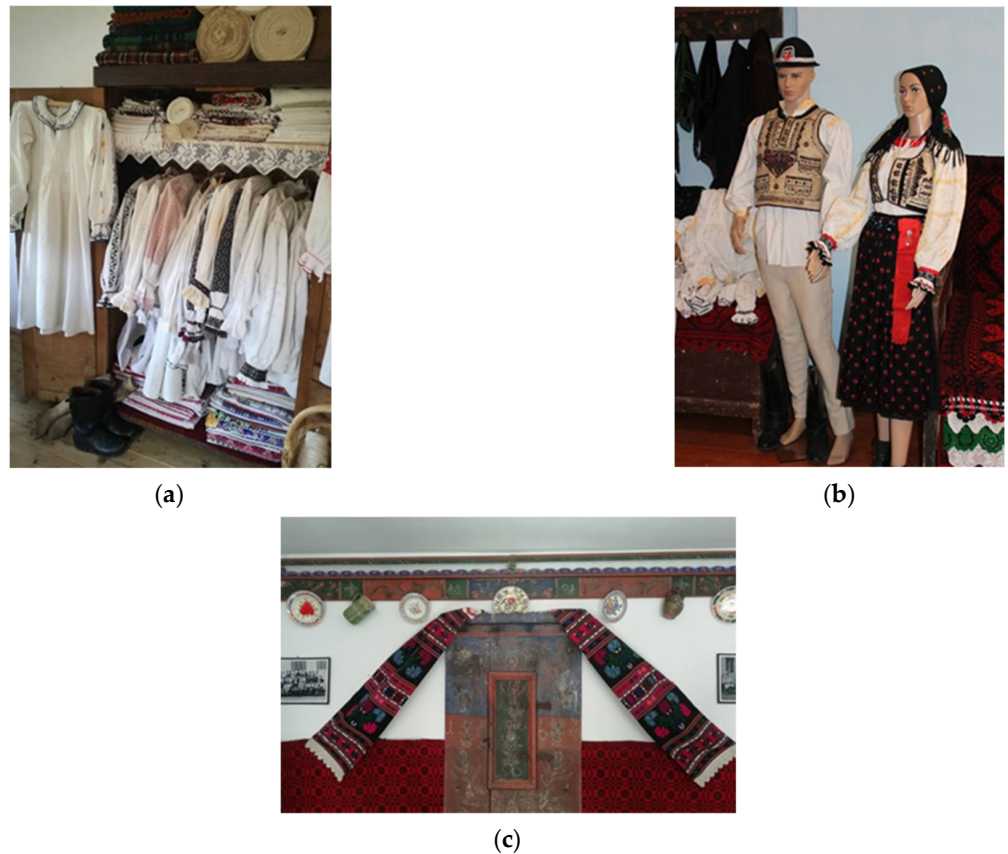
Figure 6. The village museums from Mândra (a), Rucăr, ATU Viștea (b) and Venetia de Jos, ATU Părau (c).