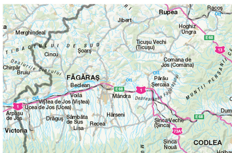
Figure 3. ATUs from Făgăraș Land belonging to Brașov County (along the Olt River, from Hoghiz to Ucea).

The project targeted only the 16 territorial administrative units (ATUs) located in Brașov County (Beclean, Comăna, Drăguș, Hârseni, Lisa, Mândra, Părău, Recea, Hoghiz, Sâmbata de Sus, Șercaia, Șinca, Șinca Nouă, Ucea, Viștea, Voila). The location of these ATUs is shown in Figure 3. The Western half of the historical territory of Făgăraș Land is currently in Sibiu County.