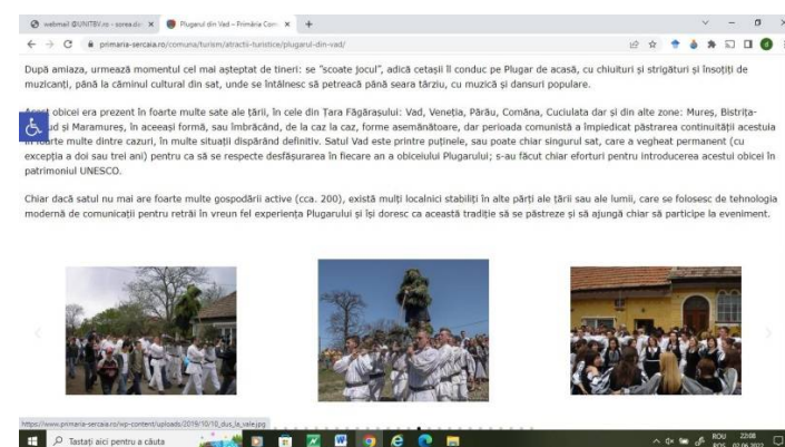
Figure 7. The Ploughman in Vad (Șercaia ATU).