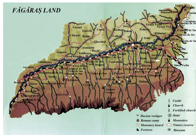
Figure 1. Făgăraș Land.

came under Austrian rule. After the revolution of 1848, the Făgăraș district became part of the Sibiu Military District. In 1860 the principality of Transylvania regained its autonomy within the Habsburg Empire and, for a short time, the Romanian language was recognized as the official language of the Făgăraș district (previously this status had belonged to the Hungarian or German languages, depending on the administrative affiliation of Transylvania, in which until the end of the 18th century the Romanians were only a tolerated nation). The consequence was that Romanian deputies were sent to the Diet. From 1865, Transylvania was united with Hungary. After the First World War, the territory of Făgăraș County, like most of the principality of Transylvania, became part of Romania.