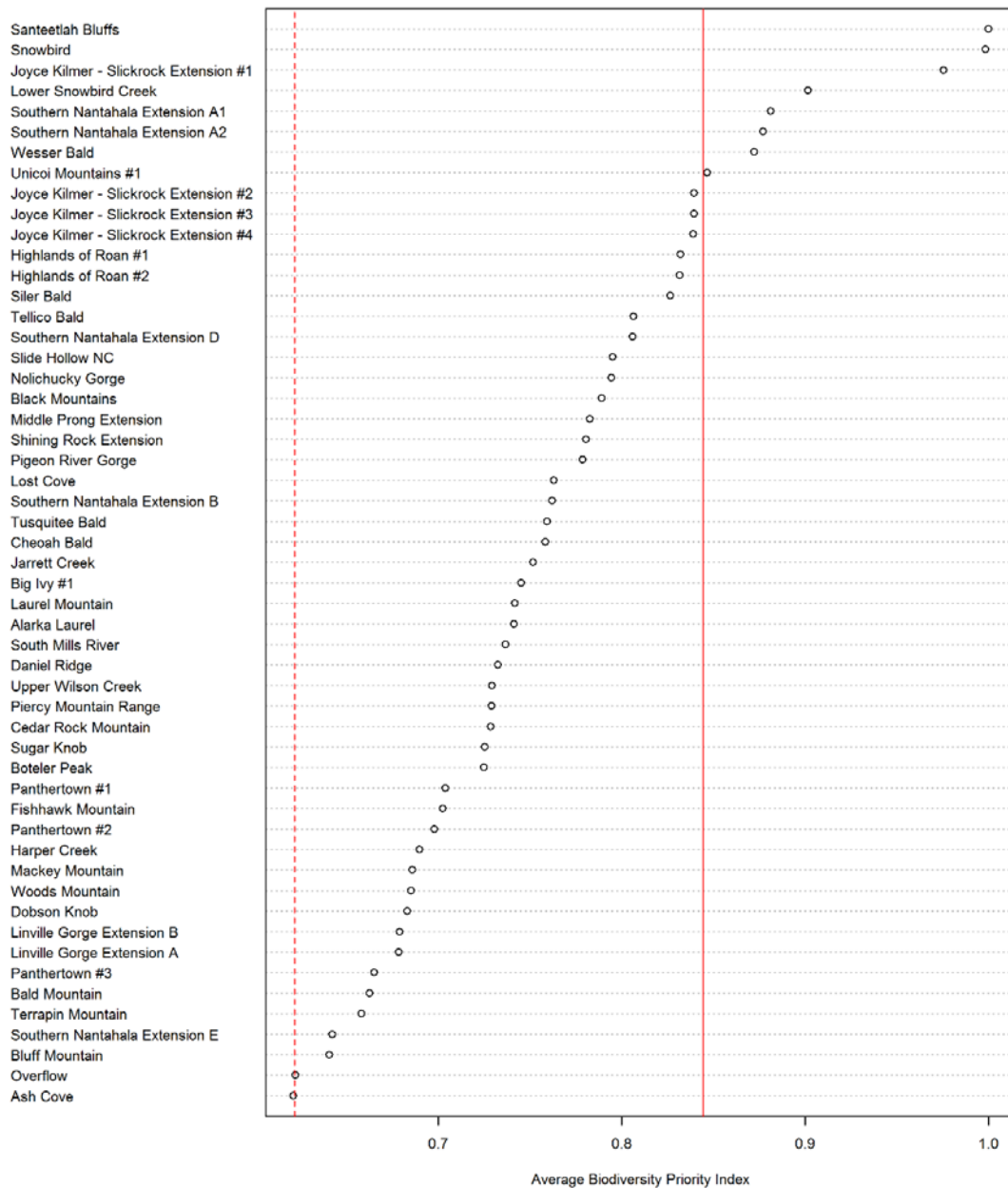
Figure S4. Mean value of the biodiversity priority index used in Belote et al. 2017 with each Mountain Treasure rank ordered from highest to lowest. For comparison, the 95th and 99th percentiles for all other roadless areas are shown in red dashed and red solid lines, respectively. Nine Mountain Treasures are in the top 1% highest biodiversity priority among all Forest Service roadless areas in the U.S., and all but one Mountain Treasures are in the top 5% highest priority.