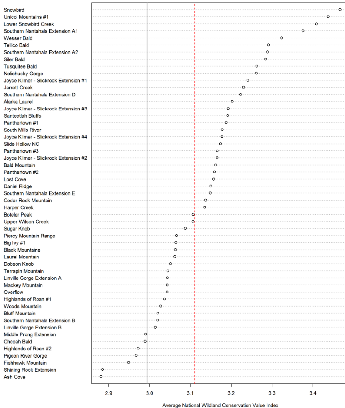
Figure S5.. The mean composite Wildland Conservation Value for all Mountain Treasures rank ordered from highest to lowest. For comparison, the 90th and 95th percentiles for all other roadless areas are shown in grey solid and red dashed lines, respectively. Twenty-nine Mountain Treasures are among the top 5% most important priorities for expanding conservation protections of wildland values among Forest Service roadless lands in the lower 48 states.