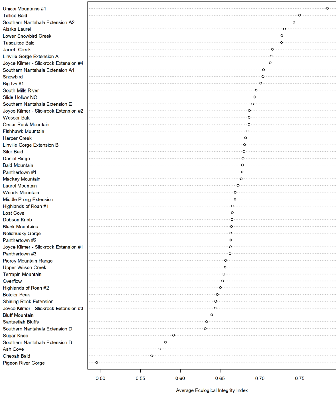
Figure S1. Mean value of the ecological integrity index used in Belote et al. 2017 with each Mountain Treasure rank ordered from highest to lowest. Unicoi Mountains #1 has the lowest human modification and highest ecological integrity among the Mountain Treasures. Pigeon River Gorge has the highest degree of human modification.