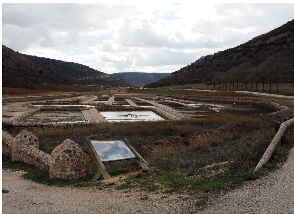
Figure 5. Remains of salt mines in Saelices de la Sal.

We should highlight the uniqueness of the varied industrial heritage . Starting with mining , because of the mineral wealth of this area (iron, copper, silver, salt, etc.), there are numerous remains of mine workings, although they are in a precarious state of conservation. However, the remains of the rock salt mines (ponds, warehouses, mills, etc.) have great importance. Most of them were started during the Roman period, including those in Armallá, Saelices de la Sal (Figure 5) and Terzaga, and reached their peak in the second half of the 18th century when the Crown took over the management of salt. The remains of old factories linked with traditional crafts such as resin collecting are also representative of the region's industrial heritage. These remains were very important in the late 19th and early 20th century and are displayed in the Orea Interpretation Centre. Timber production and log transportation on the Tajo can be seen in the Zaorejas Interpretation Centre, together with some lime kilns, and there is the Jorge Bande Museum in Corduente, in a former munitions factory.