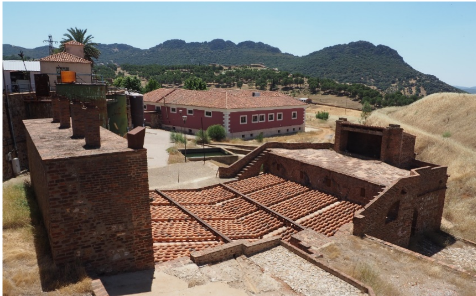
Figure 2. Buildings at the Almadén Mining Park (aludel kilns and Mercury Museum).

the New World. There is also the 18th-century San Carlos horse mill on the surface and San Andrés horse mill underground, which are masonry structures used to raise the minerals from the mine.