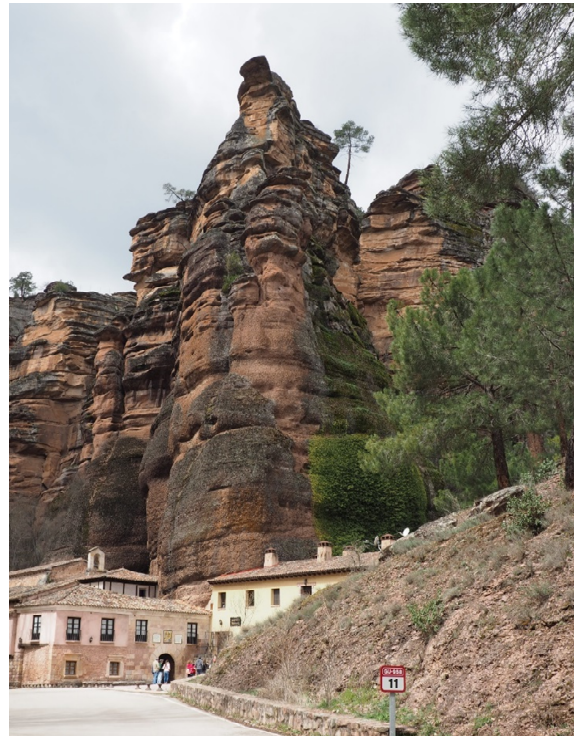
Figure 4. Barranco de la Hoz.

Its main natural heritage resources are linked, first and foremost, with an almost unpopulated and, therefore, mostly unaltered territorial environment in which the geological heritage resources include the presence of important stratigraphic series from the Paleozoic (Ordovic and Siluric) and Mesozoic (Triassic, Jurassic and Cretaceous). Significant examples include the lower Silurian section, which is a global biostratigraphic reference; the section with the Toarcian-Aalenian boundary in Fuentelsaz, one of the three Global Boundary Stratotype Section and Point (GBSSP) reference points in Spain that have been approved by the International Union of Geological Sciences (IUGS); the fossilised trees from the Permian period in the Sierra de Aragoncillo; the aragonite type locality; the Permian-Triassic section in the Barranco de la Hoz (Figure 4); and the folds near Orea and Cuevas Labradas.