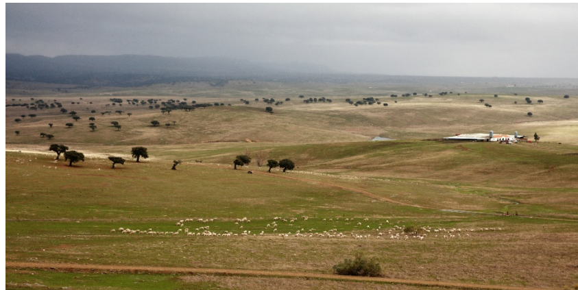
Figure 3. Agricultural landscape in the Valle de Alcudia.

a humanised landscape (Figure 3) which currently provides resources associated with the agricultural heritage such as pasture and, specifically, with what has been called the “heritage of transhumance” related to livestock routes (drovers’ roads, byways, paths, troughs, inns, etc.).