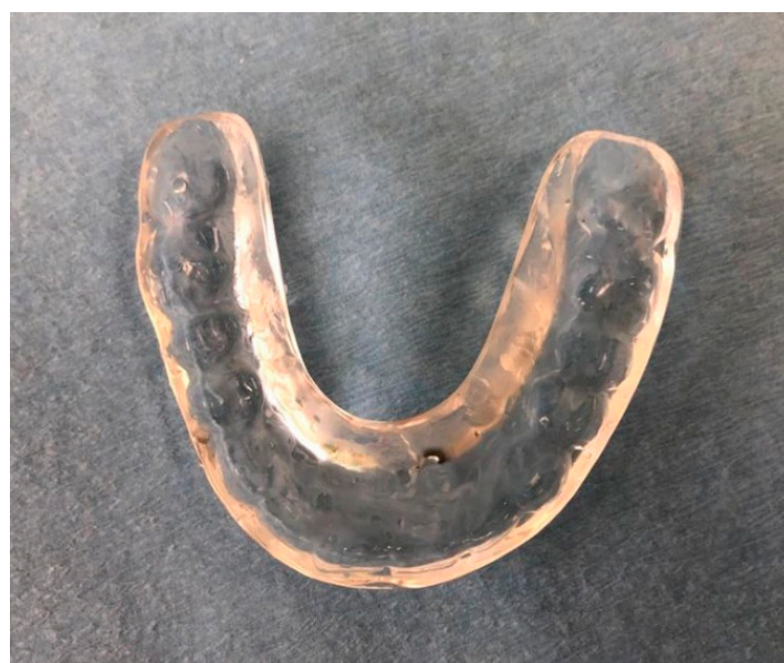
Figure 2. Occlusal splint for the management of temporomandibular disorders (TMD) and bruxism.

The initial management of TMD may include various medications, such as analgesics, non-steroidal anti-inflammatory drugs (NSAIDs), anxiolytics, and anti-depressants. Occlusal appliances of various designs are routinely prescribed, which represent a non-invasive option with minimal risks (Figure 2). The use of occlusal splint therapy has been shown to reduce pain intensity and increase maximal mouth opening [48]. However, whether the effect of an occlusal splint is due to the placebo effect has been questioned, and that the evidence of its efficacy remains to be low [49,50]. A systematic review in 2018 by Alkhutari et al. has suggested that the use of occlusal splint may improve patient-centred treatment outcomes, which may be more than merely a placebo effect [51]. Multiple designs are available, such as hard, soft, and anterior repositioning splint. At present, there is no consensus on which design is superior, as results from different studies are equivocal in terms of the efficacy of different designs of occlusal splints [50,52].