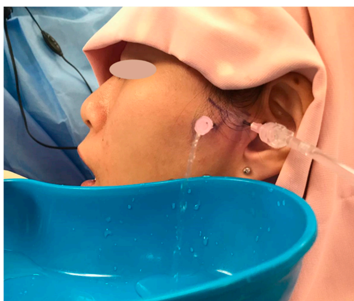
Figure 3. Arthrocentesis performed under local anaesthesia.

Arthroscopy of the TMJ was initially pioneered by the Japanese in the 1970s [68,69], and later popularized by the Americans [70–72]. TMJ arthroscopy may involve lysis and lavage of the superior joint space, as well as operative procedures, such as repositioning of a displaced disc, arthroplasty, and removal of inflamed tissues and adhesions. The efficacy of arthroscopy has since been well-recognized [73–79], and has been found that the therapeutic effect was mainly due to lysis and lavage but not disc position [80]. It was due to this finding that a modification was made, where lysis and lavage was performed without arthroscopic view. This was termed arthrocentesis which was first described by Nitzan et al., in 1991 [81], with efficacy that has since been well-documented [46,82–94] (Figure 3).