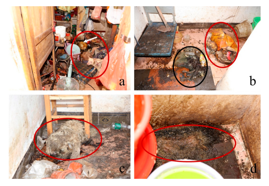
Figure 1. Overview of forensic scene: (a) Woman corpse; (b) Man corpse (red circle) and the carcass of one of the dogs (black circle); (c) Carcass of a dog on the first floor; (d) Carcass of a dog in the toilet on the second floor.

first floor (Figure 1c). Since the carcass of the other dead dog was not estimated, it is not shown or discussed in this report. The fourth carcass was found in the toilet on the second floor and had completely decomposed (Figure 1d). Besides the four dead dogs, 12 live but emaciated dogs were found at the scene. The rice in the house had been eaten by the dogs. The toilet on the second floor was leaking, and a plastic bucket used to collect the leaking water was full and could be accessed by the dogs. The house was very dirty and stuffy, with household waste and dog feces scattered all over. The man was 73 years old, whereas the woman was 67 years old. A police investigation revealed that both individuals had died from natural causes, which ruled out the possibility of homicide or suicide. The police collected insects from both the corpses (Figure 1a,b) and carcasses (Figure 1c,d), which were then identified at the Laboratory of Forensic Entomology of Soochow University. The developmental stage of the insects was also estimated (Figure 2 and Table 1).