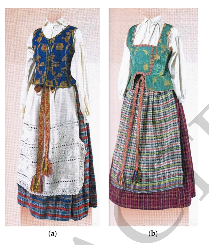
Figure 17. Folk costumes from Dzūkija: (a) From Kaišiadorys district, the 19th century: Skirt A. and A. Tamošaitis gallery, Nr. 878; shirt LDM LD-300; apron LDM LA-1442; vest ČDM E-4009; sash LDM LA-2272; (b) from Prienai district, the second half of the 19th century: Skirt LDM LA-2119; shirt LDM LA-2134; apron LDM LA-415; vest ČDM E-1618; sash LDM LA-2178.