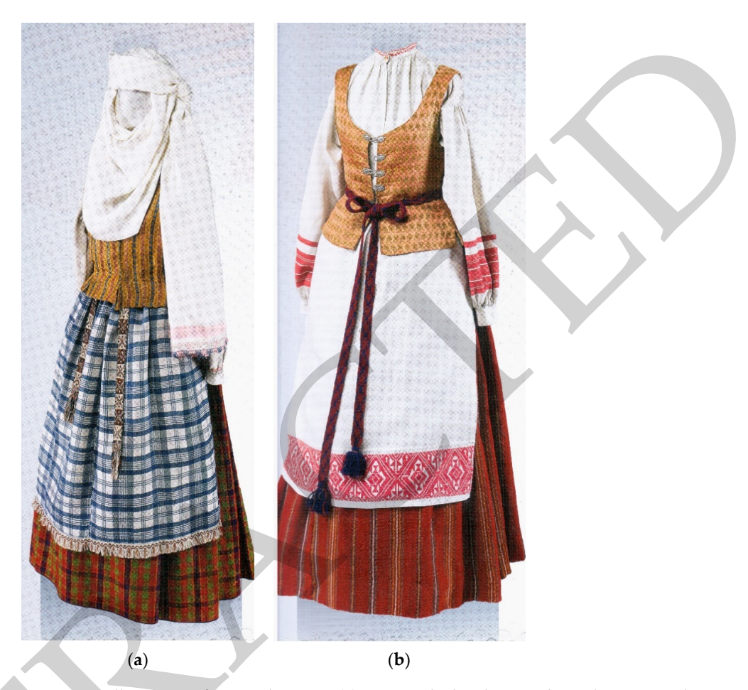
Figure 13. Folk costume from Aukštaitija: (a) From Rokiškis district; the 19th century; skirt LDM LA-1467; shirt LDM LA-1224; apron ČDM E-1038; vest ČDM E-1372; wimple LDM LA-1640; sash LDM LA-1521; (b) from Ignalina district, the second half of the 19th century: Skirt LDM LA-2333; shirt LDM LA-3778; apron LDM LA-3753; vest ČDM E-1368; sash LDM LA-3815.

separate pentagonal segments in national vests, while in folk vests, the bottom is usually wrinkled or pleated.