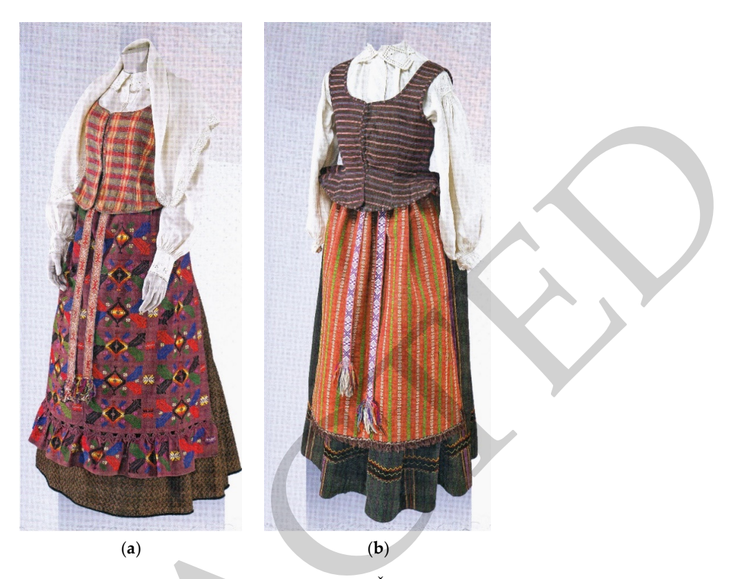
Figure 19. Folk costumes from Suvalkija: (a) From Šakiai district, the second half of the 19th century: Skirt LDM LA-1743; shirt LDM LA-4845; apron LDM LA-1792; vest A. and A Tamošaitis gallery, Nr. 833; sash LDM LA-1717; kerchief LDM LA-2768; (b) From the Kaunas and Prienai districts, the second half of the 19th century: Skirt ČDM E-1482; shirt LDM LA-3951; apron LDM LA-2115; vest ČDM E-1661; sash LDM LD-111.