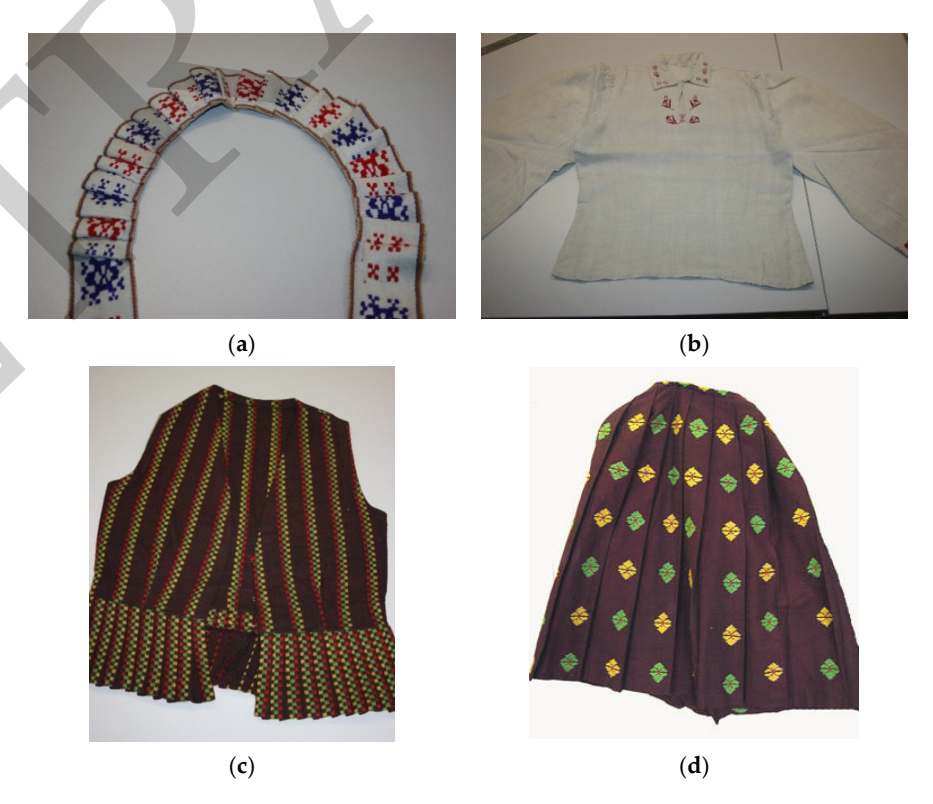
Figure 18. National costume from Dzūkija (from Varėna district): (a) Ribbon wrapped for the crown ČDM E3859e; (b) shirt ČDM E3859c; (c) vest ČDM E3859b; (d) skirt ČDM E3859a.