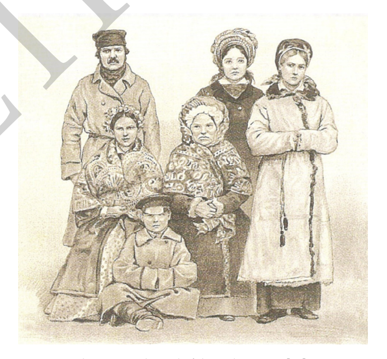
Figure 5. Lithuanians. The end of the 19th century [54].

Not much information is included in the later book "Russian nations" [54]. The introduction notes that the book aims to interest the reader by presenting short reviews and several drawings of Russian nations. The fifth page of illustrations is related to Latvians and Lithuanians (Figure 5). Four women, a man, and a child are shown as Lithuanians; it is noted that these are peasants from the Vilnius government Trakai district. Interestingly, Beliakin drew these people according to photos.