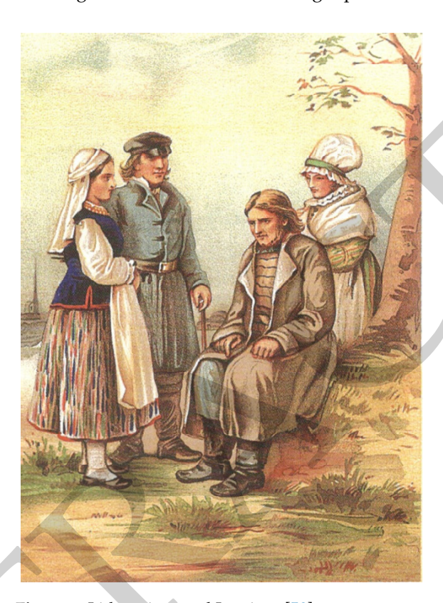
Figure 2. Lithuanians and Latvians [50].

The colourful lithography was then re-done. The same Lithuanians were re-drawn from Pauli's book and depicted in one drawing with a Latvian couple, as printed in the book "Russian Nations" [50] in 1877 (Figure 2). However, the album published by Pauli is unavailable due to its high cost. Consequently, Ilyin's Cartographic Company began to publish a more affordable book for consumers. The compilers explained in the preface that they do not intend to present any scientific summaries; their aim is only to present nations with drawings, with the texts included only in the annexes. These charmingly detailed drawings in Pauli's book are no longer present in the mentioned illustration.