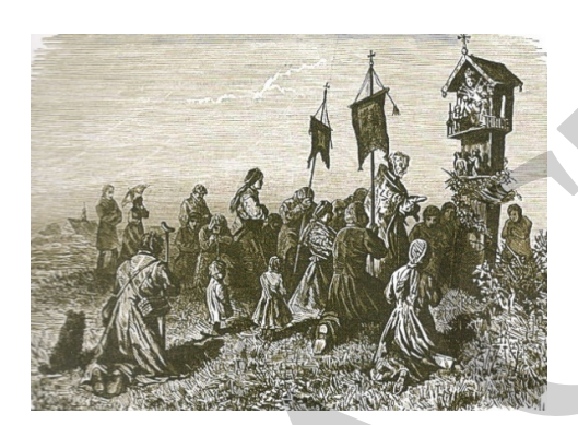
Figure 4. Procession in Samogitia [54].

Not much information is included in the later book "Russian nations" [54]. The introduction notes that the book aims to interest the reader by presenting short reviews and several drawings of Russian nations. The fifth page of illustrations is related to Latvians and Lithuanians (Figure 5). Four women, a man, and a child are shown as Lithuanians; it is noted that these are peasants from the Vilnius government Trakai district. Interestingly, Beliakin drew these people according to photos.