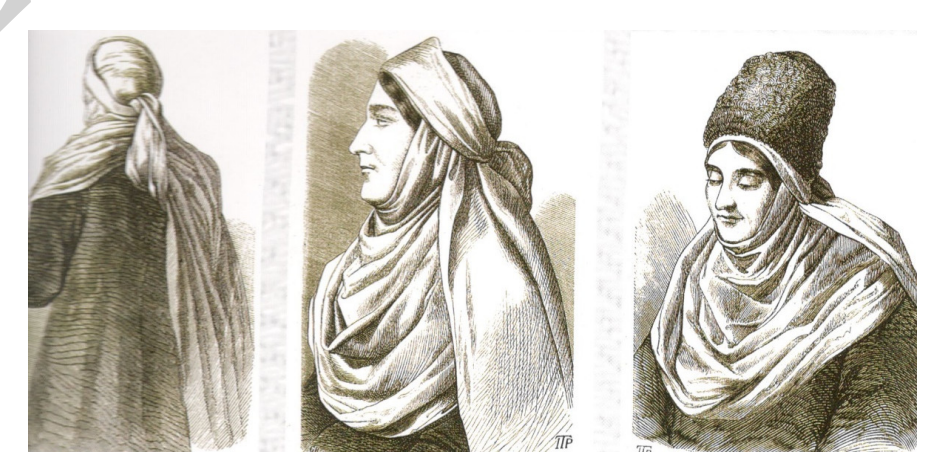
Figure 7. Married female headdresses [58].