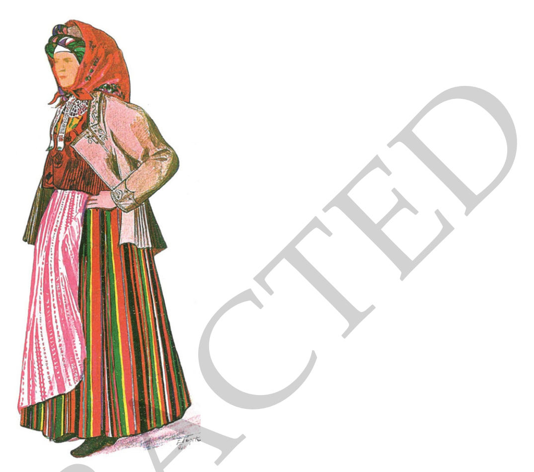
Figure 12. Samogitian woman [61].

Peasant clothes were already showing innovations at this time based on photographs from the second half of the 19th century to the beginning of the 20th century. There are many surviving photos from this period. Traditional clothes of this period were presented in one style, with national costumes shown in another style. Peasant clothes in photos taken by earl Tyszkiewicz [62] in Viala (not far from Minsk) are almost identical to the clothes worn in Eastern Lithuania in that period. The distribution area of hats with "ears" worn in Eastern Aukštaitija and shown in Viala is important for ethnographic research. Collections of the Russian scientist and ethnographer Serzhputovski and professor Volter, featuring clothes of Lithuanian peasants of the beginning of the 20th century, significantly added Lithuanian iconography found in the Russian Museum of Ethnography [63].