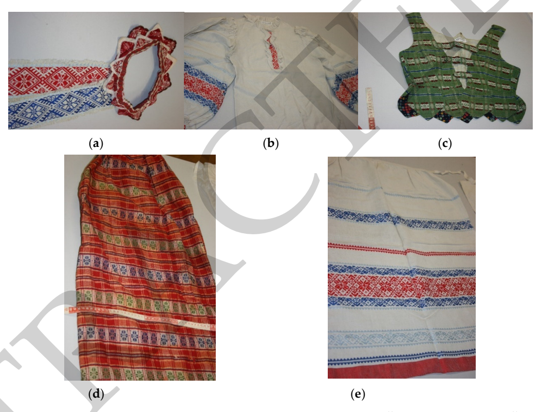
Figure 14. National costume from Aukštaitija in 1935–1940: (a) Crown ČDM E6360T; (b) shirt ČDM E6357; (c) vest ČDM E6358; (d) skirt ČDM E6356T; (e) apron ČDM E6359.

bright colours were popular in Southern Samogitia. The shirt's upright collar, clasps, and cuffs were often embellished with red cotton thread interweaves, and only the Southern shirts included tapered sleeves without cuffs. Vests were quite short; high under the chest; pierced and folded; and sewn from homemade checked, striped, and one-coloured fabric or industrial cashmere with flowers. Samples of Samogitian folk costumes are presented in Figure 15. Folk clothes of Samogitia were of brighter colours than those of Aukštaitija—people from Samogitia liked red colour. Samogitians are characterised by a distinctive vest cut, vertically striped women's skirts. Aprons also were vertically striped. Strips and small ornaments run along the apron. Samogitians wore several scarves, wearing mostly wooden clogs [25–33].