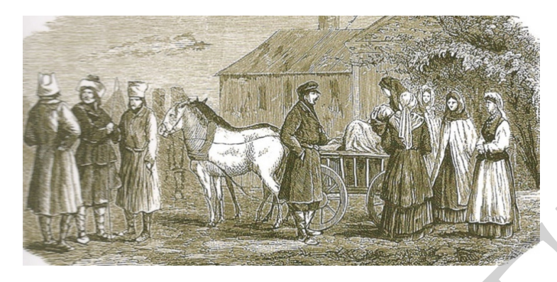
Figure 3. Lithuanians from the Ukmergė district [54].