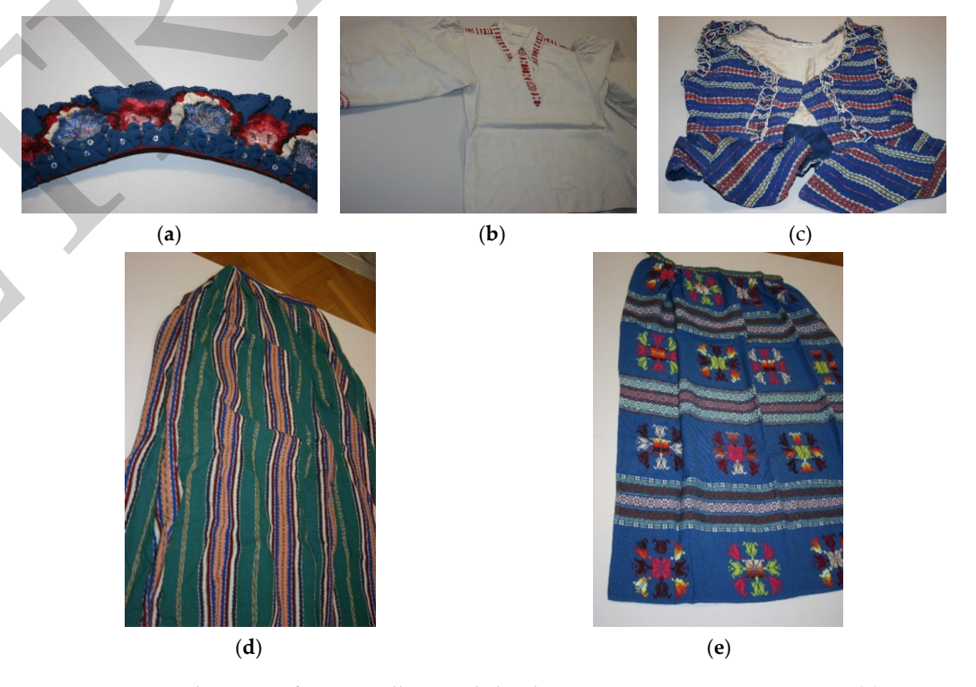
Figure 20. National costume from Suvalkija made by the company "Marginiai" in 1942: (a) Crown ČDM E6320; (b) shirts ČDM E6319; (c) vest ČDM E6318; (d) skirt ČDM E6316; (e) apron ČDM E6317.