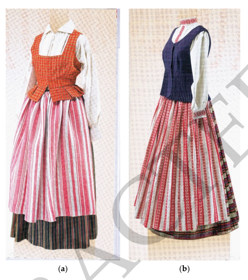
Figure 15. Folk costumes from Samogitia: (a) From Mažeikiai, Telšiai district, the 19th century: Skirt, A. and A. Tamošaitis gallery, Nr. 865; shirt LDM LA-1240; apron A. and A. Tamošaitis gallery, Nr. 903; vest LDM LA-2433; (b) from Raseiniai district, the 19th century: Skirt A. and A. Tamošaitis gallery, Nr. 858; shirt LDM LA-3019; apron A. and A. Tamošaitis gallery, Nr. 859; vest LDM LD-984/3.