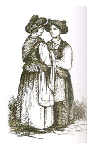
Figure 1. People from Mikališkės town [48].

After Lithuania became part of Tsarist Russia, attention often was paid to the so-called Nord West State. Activities of the Imperial Society of Russian Geographers were especially notable in the second half of the 19th century [49].