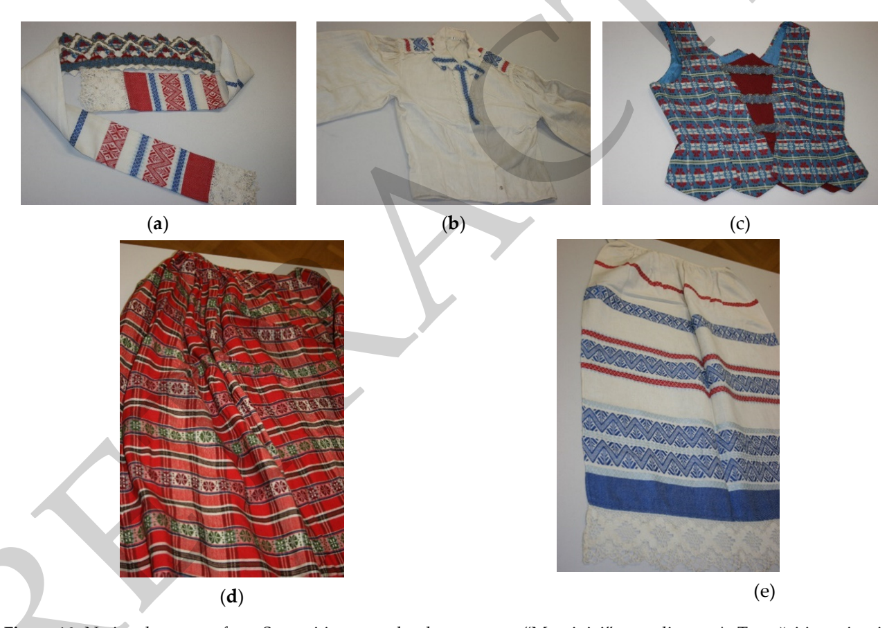
Figure 16. National costume from Samogitia woven by the company "Marginiai" according to A. Tamošaitis project in 1939: (a) Headdress—wide plain sash with collar ČDM E3711e; (b) shirt ČDM E3711a; (c) vest ČDM E3711d; (d) skirt ČDM E3711b; (e) apron ČDM E3711c.

preferred interwoven and embroidered geometrical ornaments with red "žičkai" on the sleeve ends and cuffs in the Prienai, Stakliškės, and Vievis districts. Stripes on the sleeve ends and shoulder pads were equally interwoven in the Eastern area. Due to the Slavic ornamentation, shirts embroidered with various ornaments were filled with red and black threads at the end of the 19th century. Women wore small wimples in Northern and Eastern Dzūkija, but the most popular headdresses were made of lace (later, crocheted hats and kerchiefs). Eyebrows were sewn from pleated fabrics with multi-coloured stripes and lace; decorated with glass beads, silk roses, gallons, and sequins; and featured fibres of multi-coloured thread attached to them. Women decorated themselves with a few rows of coral necklaces, as well as necklaces of multi-coloured glass. For economic reasons, coral beads were strung in a special way on threads of different lengths, and the ends of the threads were intertwined. The braid of the thread was only visible under the collar of the shirt, and several rows of necklaces of different lengths hung at the front of the neck. Samples of Dzūkija folk costumes are presented in Figure 17. According to written sources [25-33], Dzūkija is characterised by finely checked skirts, finely checked and striped aprons, overlaid and pick-up wide stripes.