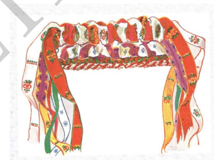
Figure 11. "Rangė" [61].

Not only fully completed costumes, but also separate parts of clothes were used as book illustrations at the end of the 19th century. The periodical journal "Illustrated Knowledge" was illustrated with watercolours from the Polish artist Turek in 1913 (Figures 11 and 12). Decorations of Samogitian girls—"rangės"—and watercolours of Samogitian female costume were made according to the researcher (mostly Samogitia history), archaeologist, and ethnographer Brenstein's collection exhibits [61]. "Rangė" folded from white, red, and violet floral ribbons interested the artist. Exhibits of this type in Lithuanian museums are very rare.