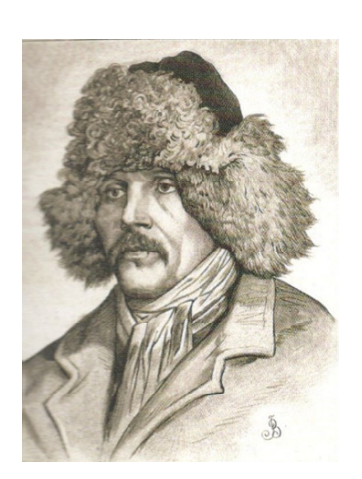
Figure 6. A resident from the Vilnius government Švenčionys district [56].

The work of Romer, the main artist in the second half of the 19th century [55], is known among ethnographers to be very good. The "Peasant from Švenčionys" [56] (Figure 6) was not published in the title page of the "Illustrated Journal" presenting knowledge about hats. Investigating the creative legacy of this artist, a few similar pictures of peasants with fur hats were presented.