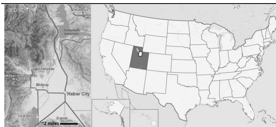
Figure 1. Study Location.