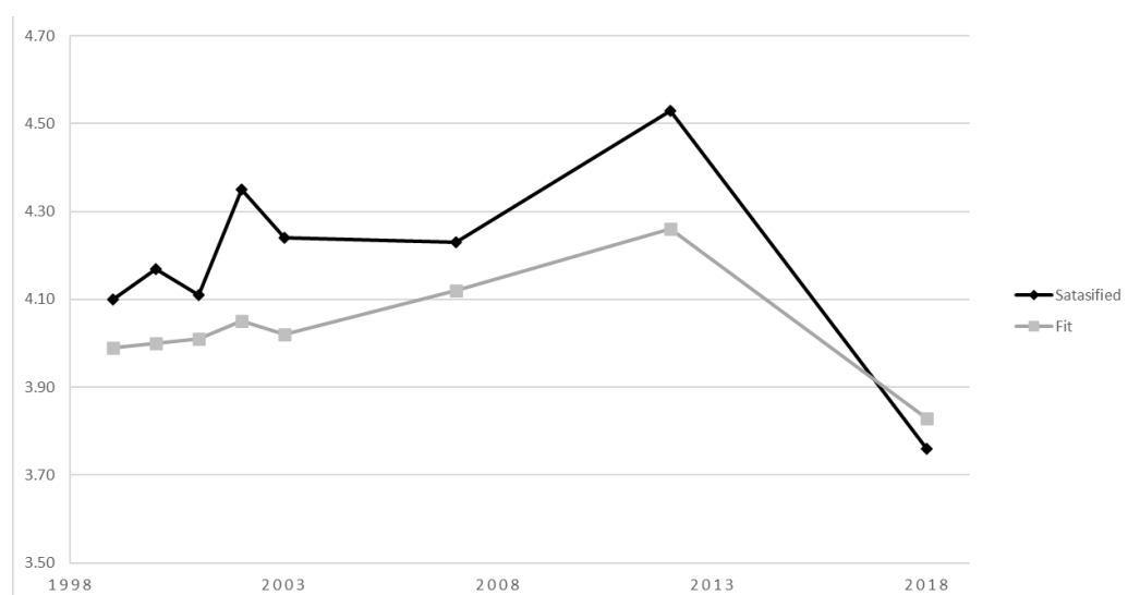
Figure 4. How Well Respondents Fit in and are Satisfied with Their Community, 1999–2018.

Community survey data for Heber Valley support the overall patterns included in the 2019 national report. They show that population growth and its impact on the community have negatively affected those who valued the small-town feel of Wasatch County. Figure 4 shows longitudinal data for the survey questions, "How well do you feel you fit in your community?" and "How satisfied are you with your community?" Respondents were asked to report their fit and satisfaction with their community on a scale of 1 to 5, with 1 meaning not very well/much and 5 means very well/much. The initial trend of both measures shows an increase in the average value provided by survey respondents. However, after 2010, the average value declines in both fit and satisfaction. This suggests that the broader changes in population growth and their community have not been positive for Wasatch County residents.