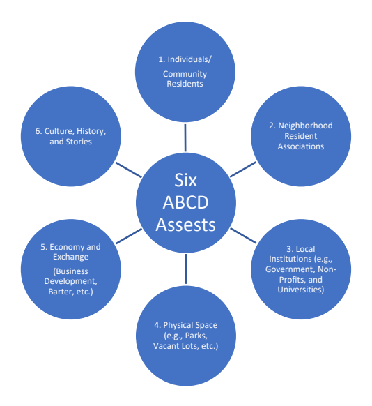
Figure 1. The six assets of asset-based community development (ABCD).

Copyright: © 2021 by the authors. Licensee MDPI, Basel, Switzerland. This article is an open access article distributed under the terms and conditions of the Creative Commons Attribution (CC BY) license (https://creativecommons.org/licenses/by/4.0/).