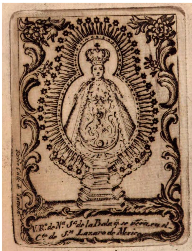
Figure 5. Augustín Rubio, Nuestra Señora de la Bala , ca. 1780. Engraving.

identify the plate as the work of engraver Joseph Eligio Morales (1729–1776). Interestingly, Morales had apparently reworked a plate originally engraved by Francisco Sylverio, as analysis of the two prints reveals them to be from the same plate. 49 Thus, the Rubio edition was from the plate's third state.