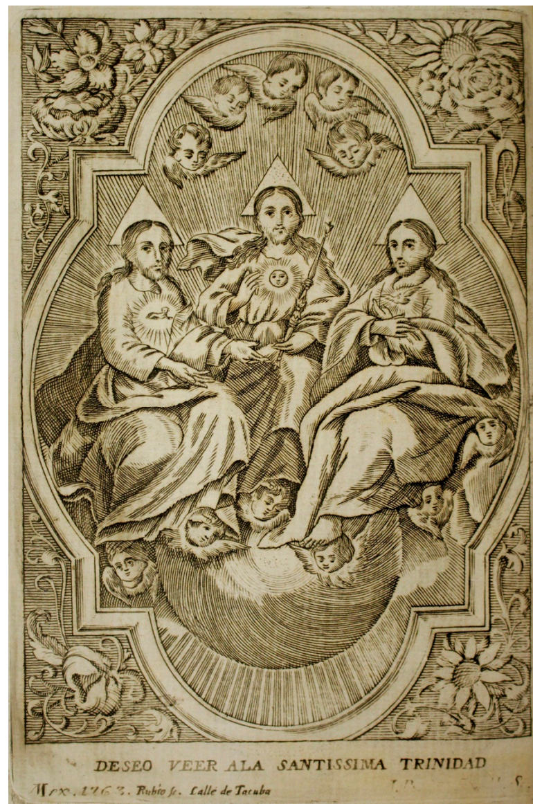
Figure 6. Agustín Rubio, Santísima Trinidad , ca. 1780. Engraving.

no corollary practice. The preponderance of visual evidence therefore makes it clear that with the exception of the print she inscribed with her full name and address earlier in her career, Meza decided that the firm's reputation was better tied to Gutiérrez and Rubio than to herself. She would not be the only woman print publisher to reach the same conclusion.