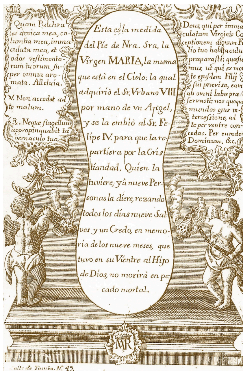
Figure 8. Anonymous, Medida del pie de Nuestra Señora, ca. 1780. Engraving.