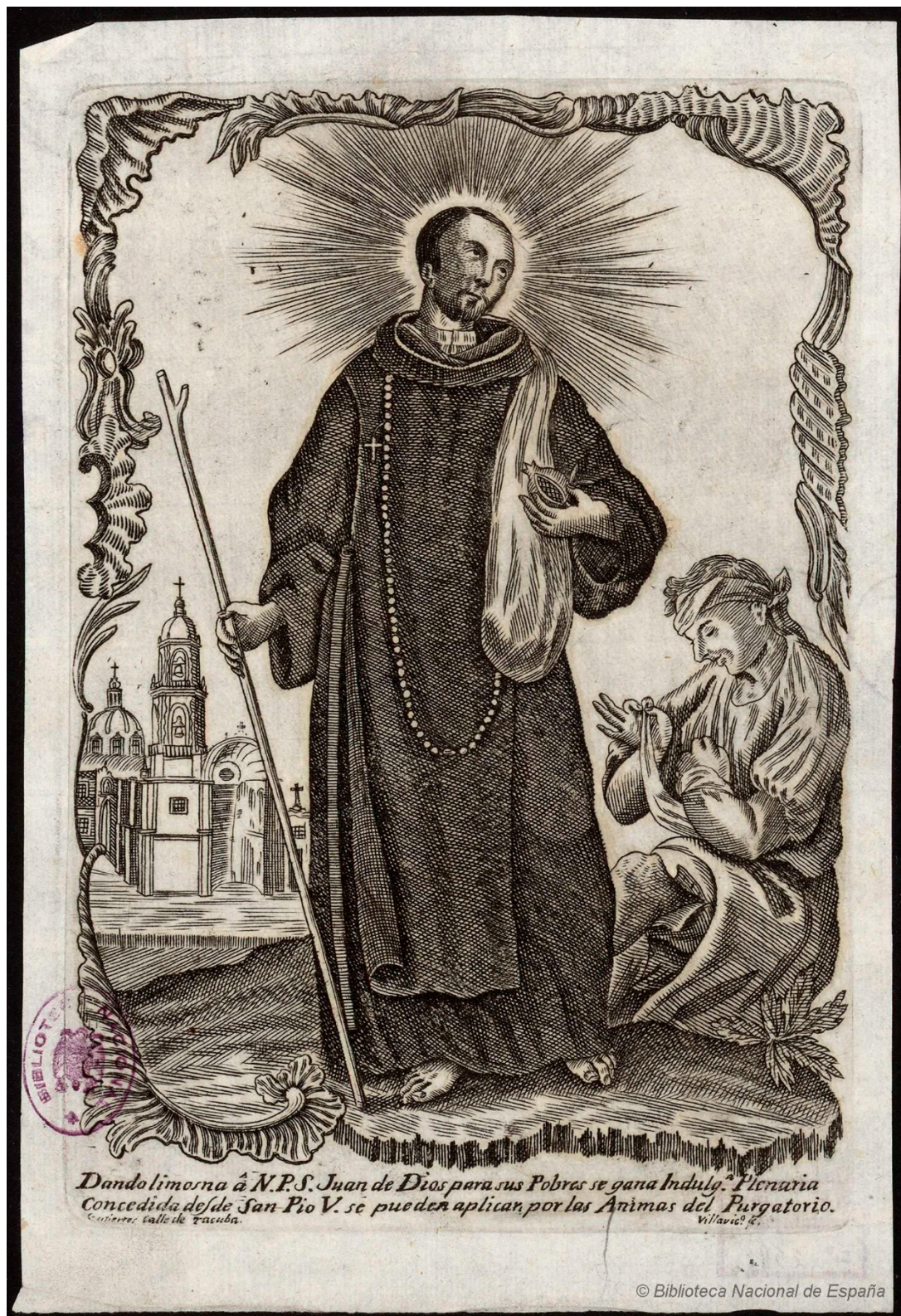
Figure 3. Manuel de Villavicencio, San Juan de Dios , ca. 1770. Engraving.

The inscriptions on prints from the Gutiérrez/Meza shop in this era also demonstrate that the couple counted on the assistance of a journeyman engraver. The complete signature on the Veronica Veil engraving reproduced by Romero de Terreros states, “Casa