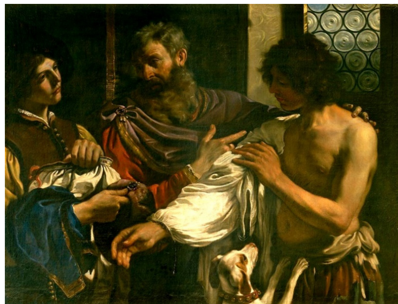
Figure 7. Guercino, Return of the Prodigal Son , 1627/8, Borghese Gallery, Rome.

Two other known representations are those made for the Venetian Giovanni Nanni in 1651 (Figure 8) and for the archbishop of Milan, Girolamo Boncompagni, in 1654/5 (Figure 9). This latter version was intended as a gift for Prince Colonna (Ghelfi 1997, pp. 151, 188; Hornik and Parsons 2005, pp. 151–53). Two other paintings that are considered lost are mentioned in the painter's accounts book. One of them is registered as having been