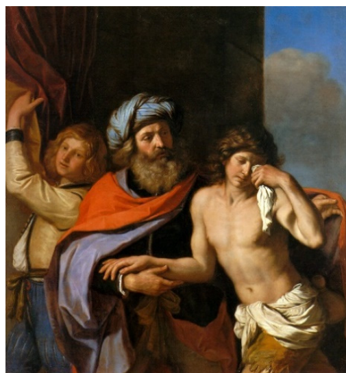
Figure 9. Guercino, Return of the Prodigal Son , 1654/5, Timken Museum, San Diego, CA, USA.

It is clear that among the five versions known to us today, the version intended for Cardinal Ludovisi is the only one that added additional groups to the parable's dense narrative. While its composition contains three groups of figures—actors, musicians and viewers—what characterizes the other paintings is a focused scene with only the three main protagonists depicted. The Sabauda painting is also the only version that corresponds to the traditional representation of the scene, with the prodigal son kneeling while clasping his hands together, his father descending the stairs with his wide-open arms, and a third protagonist carrying clothes. In all of Guercino's other renditions of the scene, the three main protagonists are responding to one another in other ways, without stressing the hierarchy between the embracing father and the kneeling son. Indeed, in these later representations, the prodigal is neither kneeling nor clasping his hands together in a typical gesture of contrition. Among the four later versions, the two earlier ones (Figures 6 and 7) relate to a different instance in the story—the changing of clothes. The two later versions