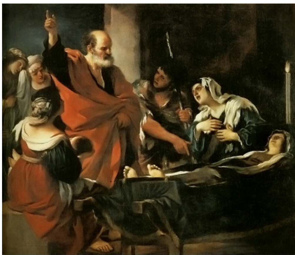
Figure 3. Guercino, Raising of Tabitha, 1618, Palazzo Pitti, Florence.

Guercino's Raising of Tabitha (Figure 3) is a more sophisticated painting. Here, in addition to the two main protagonists, St. Peter and Tabitha, he peopled his canvas with other figures. In this painting, the miracle of restoration of life is depicted, as St. Peter resurrects someone (Tabitha) who has recently passed away. Tabitha, a pious woman who lived in Jaffa and occupied herself with charitable works, died suddenly. St. Peter, who was in Lydda, was called in. He saw her lying dead and asked everyone to leave the room, and then called out, " Tabitha, surge ", whereupon she opened her eyes and sat up (Acts 9, pp. 36–43).