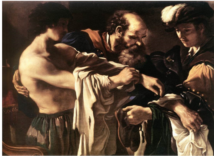
Figure 6. Guercino, Return of the Prodigal Son , 1619, Kunsthistorisches Museum, Vienna.

lifetime emphasizes the uniqueness of this choice. Guercino produced at least six additional versions of this scene after completing the painting for Ludovisi. The following year, he created a second version for Cardinal Serra (Figure 6). Denis Mahon attributed to Guercino a third version, based on stylistic grounds. This painting, writes Mahon, was completed in 1627/8 (Figure 7). 17