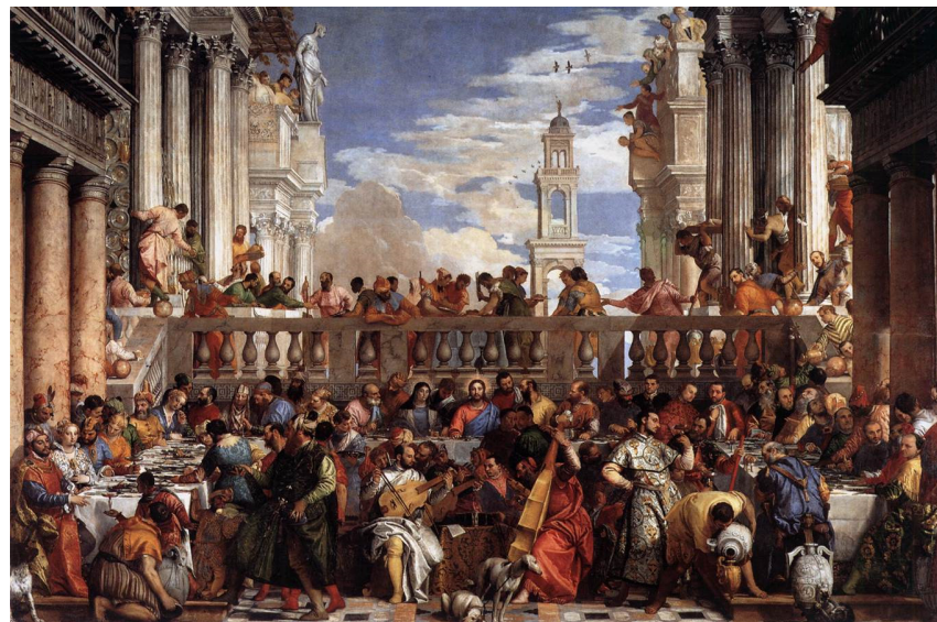
Figure 11. Paolo Veronese, Wedding at Cana , 1562/3, Louvre, Paris.

Indeed, there are several similarities between Veronese's painting and Guercino's Return of the Prodigal Son . The first is the use of an architectural setting comprised of a series of buildings, which form a street depicted in foreshortening. Whereas Veronese positioned three Palladian palaces, one after the other, on either side of the painting to construct the allusion of a street, Guercino achieved a similar effect with two palaces at the centre of the painting. The two buildings represent two different architectural styles, one more elaborate than the other. In Veronese's painting, a man in fancy dress stands on the right side, appreciating a glass of wine. This figure, too, is echoed by Guercino, who depicted an arriving spectator about to enter the staircase on the right.