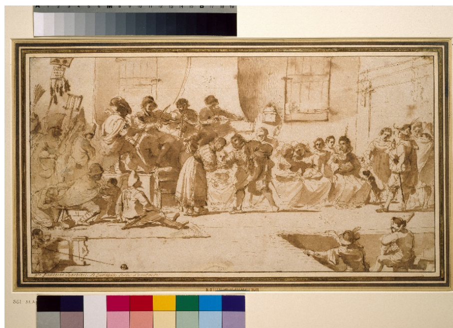
Figure 5. Guercino. Tavern Scene (drawing), the Ashmolean Museum, Oxford.

Prasad noticed another reference to Guercino's representations of theatrical performances in his Peasants in a Domestic Interior , where the painter duplicated the right side of another drawing, the Tavern Scene (Figure 5).