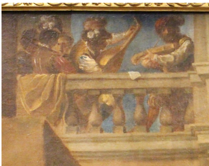
Figure 2. Guercino, Return of the Prodigal Son (detail), 1618, Galleria Sabauda, Turin.