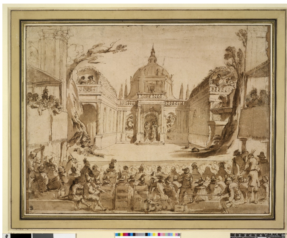
Figure 4. Guercino, A Theatrical Performance (drawing), 1617, The British Museum, London.

The theatrical character of the entire composition is clarified when we compare the painting's background with Guercino's only surviving drawing of a full theatrical décor (Figure 4).