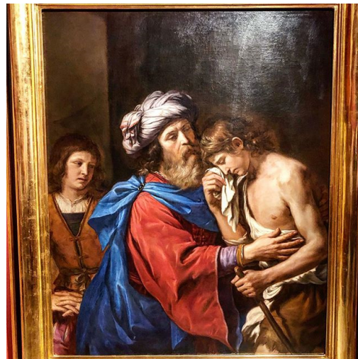
Figure 8. Guercino, Return of the Prodigal Son , 1651, Diocesan Museum, Wloclawek.

commissioned in 1642 by Taddeo Barberini, a nephew of Pope Urban VIII ( Malvasia 1678 , vol. 2, p. 265; Ghelfi 1997 , pp. 113–14; Vivian 1971 , p. 23).