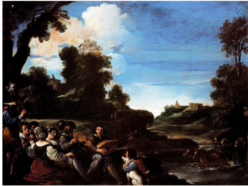
Figure 10. Guercino, Landscape with a Concert , 1617, Uffizi, Florence.