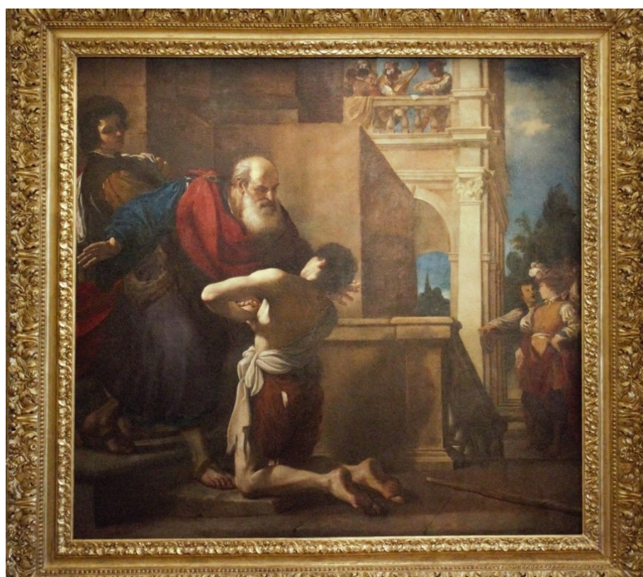
Figure 1. Guercino, Return of the Prodigal Son, 1618, Galleria Sabauda, Turin.