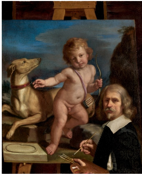
Figure 13. Guercino, Self-Portrait before a Painting of “Amor Fedele” , 1654/5, National Gallery, Washington DC.