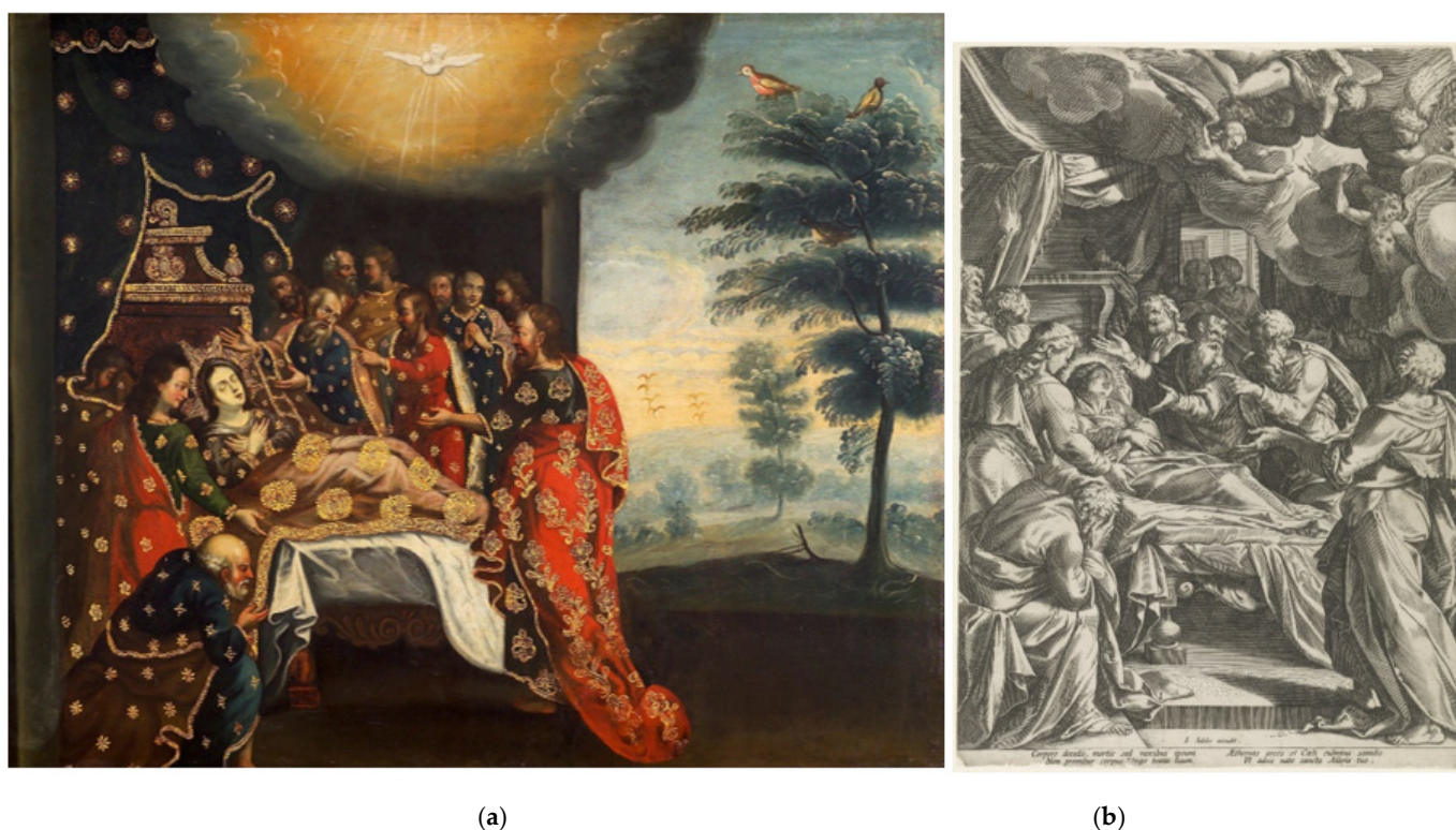
Figure 13. (a) Unidentified artist, The Dormancy of the Virgin , 1730–1770, oil on canvas, Museo de Arte de Lima (MALI), 131 × 103 cm. (b) Jan Sadeler I (publisher and possibly engraver) after an engraving by Cornelis Cort and a design by Federico Zuccaro, The Dormancy of the Virgin , 1567–1600, engraving.

The Dormancy indicates the moment that Mary's soul ascends to Heaven., a difficult episode to depict. The painter solved these visualization problems in an allegorical manner by including a landscape that served as the narrative structure of the event. This element materializes the moment when the Virgin's soul went out to meet her Beloved, Jesus Christ. In addition to the supernal effect that the landscape spreads throughout the scene, some motifs added therein reveal the exact meaning of this landscape. In the distance, we observe a group of seven birds (probably doves) heading towards the twilight sun. This was an allegorical representation of the soul of Mary that went out to meet her Beloved, personified in the rising sun. The identification of the dove as a metaphorical figure of the soul comes from book 6 (9–10) of the Song of the Songs :