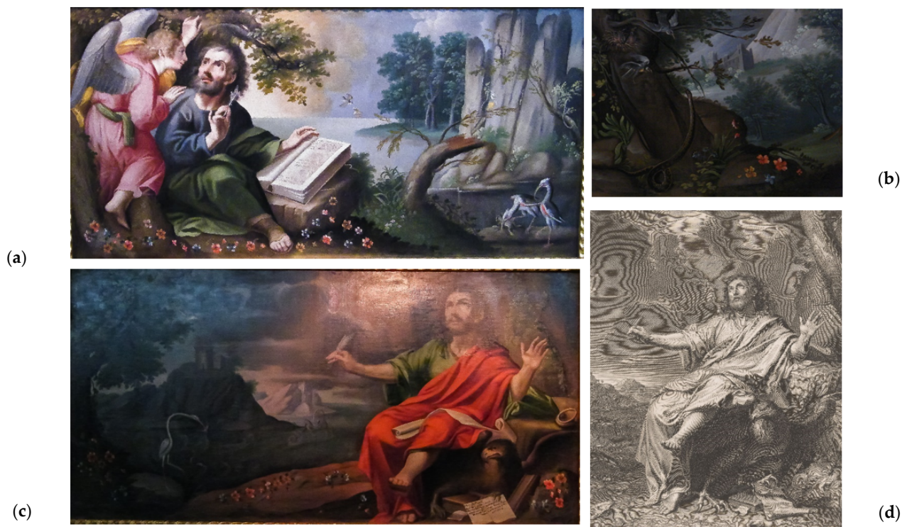
Figure 6. (a) Melchor Pérez de Holguín (ca. 1665–ca. 1730). Saint Mark the Evangelist, 1714, oil on canvas, Museo Nacional de Arte, La Paz, Bolivia. (b) Melchor Pérez de Holguín (ca. 1665–ca. 1730). Saint Luke the Evangelist, detail, 1714, oil on canvas, Museo Nacional de Arte, La Paz, Bolivia. (c) Melchor Pérez de Holguín (ca. 1665–ca. 1730). Saint John the Evangelist, 1714, oil on canvas, Museo Nacional de Arte, La Paz, Bolivia. (d) François de Poilly after Charles Le Brun, Saint John the Evangelist at Patmos, 1657–1681, engraving, 442 mm × width 327 mm