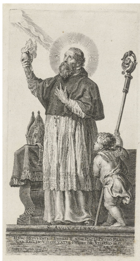
Figure 16. Theodor van Merlen II (1609–1672), after Abraham van Diepenbeeck (1596–1675), H. Augustinus , 1619–1672, engraving, 259 mm × 136 mm.