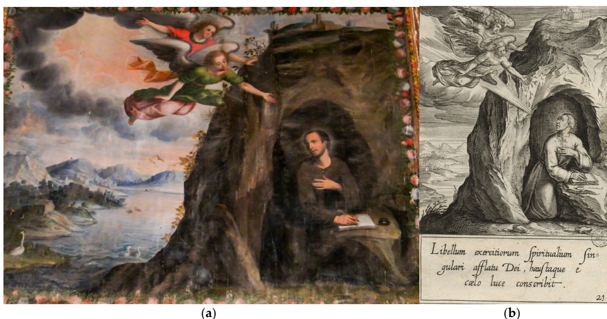
Figure 5. (a) Unidentified Cuzco artist, Saint Ignatius Composes the Spiritual Exercises at Manresa , 17th century, oil on canvas, Iglesia de San Pedro, Juli, Puno, Peru. Credit line: Sebastian Ferrero (b) Jean Baptiste Barbé, Saint Ignatius Composes the Spiritual Exercises at Manresa , 1609, etching and engraving, Plate 21 of the Vita beati P. Ignatii Loyolae, Societatis Jesu fundatoris , with Latin texts by N. Lancicius. Credit line: Portugal National Library from PESSCA (Project on the Engraved Sources of Spanish Colonial Art).

Saint Ignatius reduces his vision of the natural world, the world to be contemplated, to a series of elements, such as sunlight, flowers, plants, rivers, and fountains, all of which formed a kind of reduced model of liber naturae that we can commonly find in a typical landscape painting. In other words, the vision of Saint Ignatius does not differ much from the way that Flemish painters built their Weltlandschaft . This is why Cardinal Borromeo said that Flemish panoramic views “enclose in narrow places, the space of earth and the heavens, and we go wandering, and making long [spiritual] journeys standing still in our room [ ... ].”