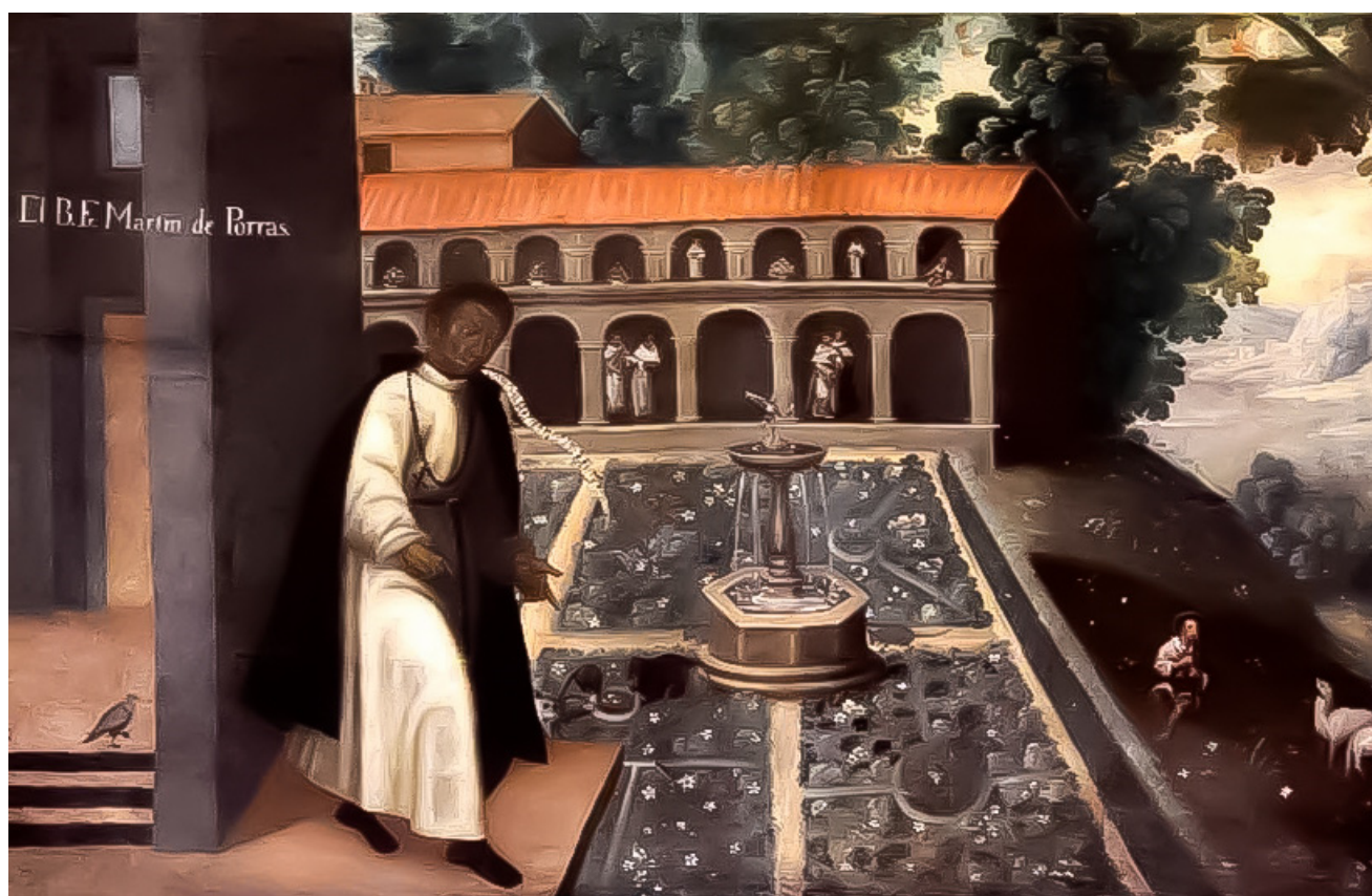
Figure 11. Unidentified artist, Saint Martin de Porres. Feeding dog, cat, and mouse miracle , 17th century, oil on canvas. Monasterio de Santa Catalina, Cuzco. Credit line: Pedro Gjurinovic Canevaro, Iconografía de San Martin de Porres , 2012.

Likewise, we find a series of four small canvases 34 , which are preserved in the convent of La Merced in the city of Cuzco and deal with the same topic. Despite containing figures and stories, we could consider them, from a compositional point of view, as landscape paintings. In all cases, a Mercedarian friar is represented performing a wonder, penance practices, or spiritual exercises. These characters are confined to a corner of the composition, leaving most of the canvas space to landscape painting. All are friars who served in the viceroyalty and died in the odor of sanctity while still having beatification or canonization processes open. Two of them are identified on the canvases by legends; they are the servants of God Fray Antonio de San Pedro, a converted Jew born in Celorico da Beira of the diocese of Guarda (Portugal), who would serve a sentence of three years in the convent of La Merced in the city of Lima, and Fray Gonzalo Díaz de Amarante, another Mercedarian from Portugal who also professed for fifteen years in the convent of La Merced in the same city. The canvas that represents Fray Antonio inflicting great pain on himself while lying naked in a garden of thorns is probably the best achievement of the four landscapes.