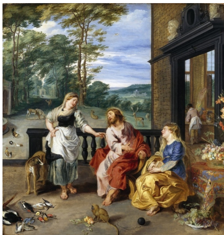
Figure 1. Peter Paul Rubens, Jan Brueghel II, Christ in the House of Martha and Mary , c. 1628, oil on oak panel, 64 × 61.9 cm. National Gallery of Ireland. Dublin

Around 1628, the Flemish painters Peter Paul Rubens (1577–1640) and Jan Brueghel II (1601–1678) produced a very novel representation of this scene for the Flemish painting of the 16th and early 17th centuries (National Gallery of Ireland, Dublin), a formal composition that had very little precedent. Unlike the usual indoor spaces that characterized the traditional composition of this scene, Rubens and Brueghel II transferred this biblical episode to the outdoors. Thus, a luminous landscape in the background (Van Mulders 2016, p. 94), attributed to the hand of Jan Brueghel II (Figure 1), frames the encounter of Jesus, Martha and Mary.