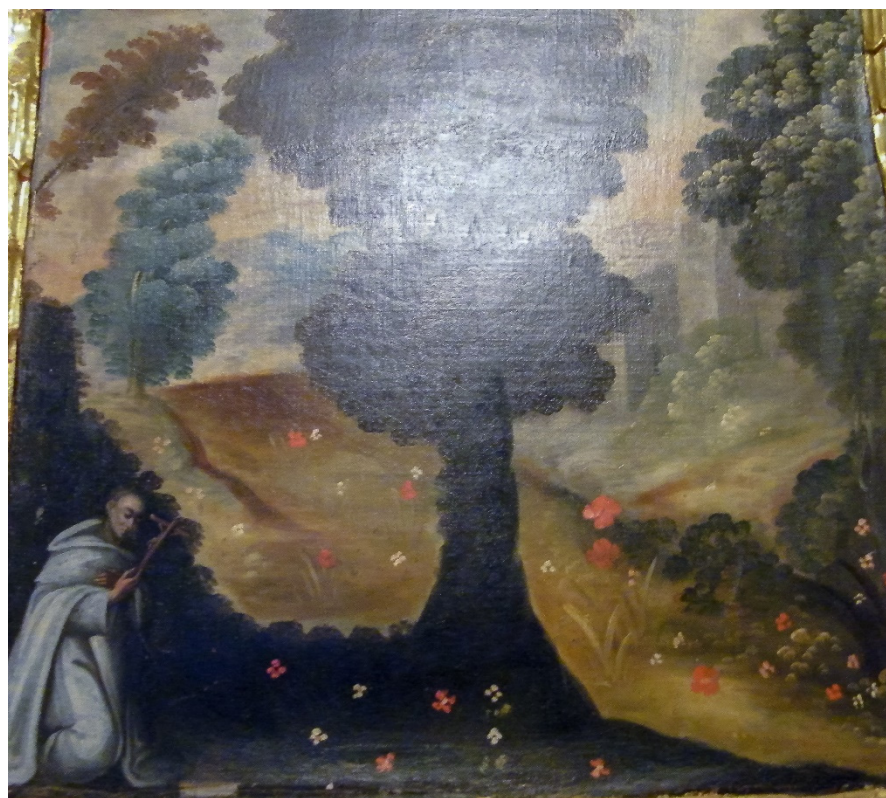
Figure 12. Unidentified artist, Contemplative Mercedarian Father , 18th century, oil on canvas. Convento de la Merced, Cuzco.