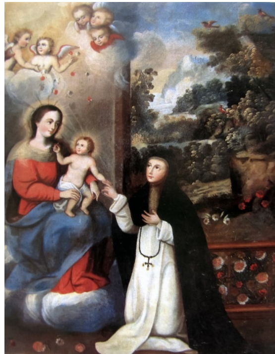
Figure 9. Unidentified artist, Mystic Nuptials of Saint Rose of Lima , 18th century, oil on canvas. Monasterio de Santa Rosa, Lima.