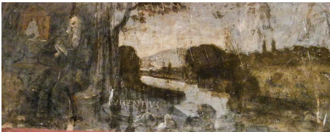
Figure 4. Unidentified artist, Fulgentius , Series of Anchorites, 17th century, oil on canvas, Convento de la Recoleta, Sucre, Bolivia.

contemplate God. A similar treatment is observed in other Cuzco series from the 17th and 18th centuries (Estabridis 1989) 23 .