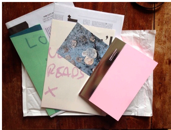
Figure 4. The Pam Flett Press by Joanne Lee. Photo by Joanne Lee. Used with permission.

Café Royal Books 4 series, the publications of practice-based research project Manual Labours , 5 Twigs and Apples publishing 6 and The Shrieking Violet , 7 amongst many others, provide an antidote to what he sees as the mainstream co-option of radical art practices, through which “art activity is relegated to the blandness of footfall” in the service of financial gain (ibid., p. 54). Within the context of public art, the act of publishing can itself be thought of as “a public work” (ibid., p. 87), through which, as “a prime object”, the artist’s book occupies “if not sculptural, certainly critical space” (ibid., p. 70).