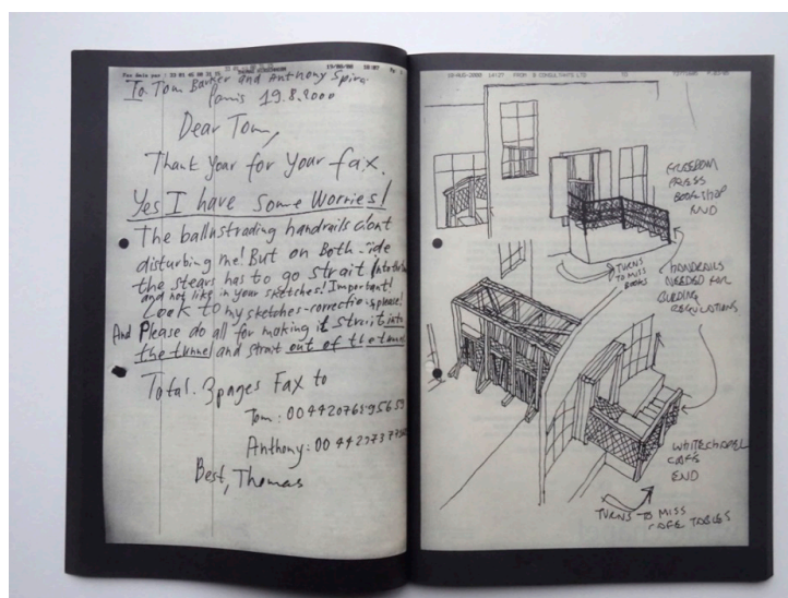
Figure 2. Material The Public Works—The Bridge 2000 (2001) by Thomas Hirschhorn.

It is a very open and honest record of the discords that are part of a work of this nature.