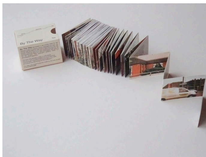
Figure 3. By The Way (1999) by Those Environmental Artists (TEA).

The deliberately awkwardly framed snaps taken out of a car side window are generally, but not exclusively, of architecture, the type you find adjacent to major trunk roads. With the artist's book, as opposed to the film, you can study each image for as long as you require, while having the opportunity to juxtaposition any of the other images next to it, even from opposite ends of the journey. Likewise, those texts can be read repeatedly, offering the prospect to digest their relevance to the places they depict. The publication By The Way (TEA, 1999) was funded independently from artranspennine98 and seemed to fulfil a desire by TEA to produce a separate artwork that captured the essence of the work but in a material that is more durable than digital film. It is positioned against the actual work, as the low-tech version, whose batteries will never run out—an antidote to the commissioned film now acting as the research for the small, boxed, concertinaed object. Rather than documenting the project in