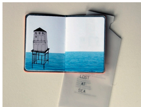
Figure 5. Lost at Sea (2009) by Emily Speed. Photo by Elaine Speight. Used with permission.

fabric begins to unfold around him. Housed in a balsa wood box that, somewhat alarmingly, unfolds upon opening, the fragility of the folded sheet provokes something of the protagonist's anxiety about the undoing of his city. Yet, whilst employed by Speed as a metaphor for “the empty space” left behind by the “disappearance of a loved one through dementia”, the act of unfolding also produces “an open plain full of possibility” (Speed 2019). As Gordon asserts, unfolding is not the same as falling apart, and the artist's book suggests that hope and potential may be achieved through the dismantling of existing structures.