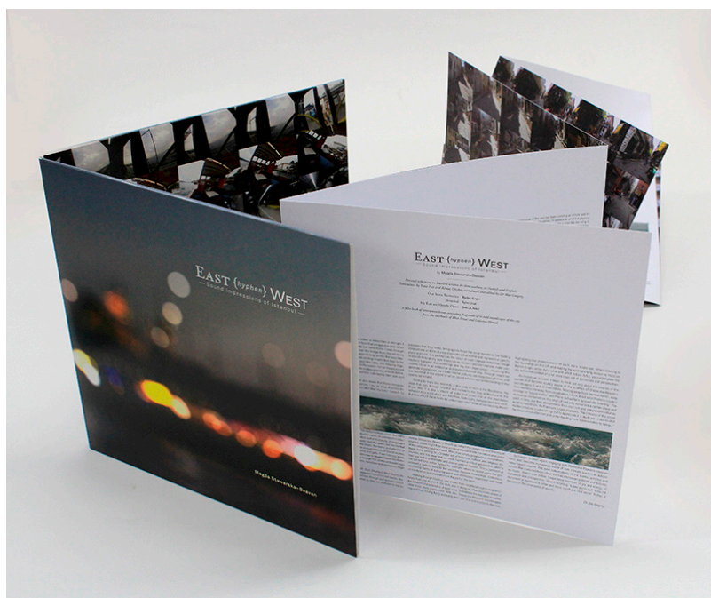
Figure 8. East {hyphen} West, Sound Impressions of Istanbul (2015) by Magda Stawarska-Beavan. Photo by Gavin Renshaw. Used with permission.

The inclusion of sound recordings within the books of Stawarska-Beavan, as well as those of artists such as Helen Cammock—whose artist book and record Moveable Bridge (2017) explores the effect of national politics and global economics upon communities in Hull—adds an additional dimension to the experience of place engendered by the work. Sound artists Agnus Carlyle and Cathy Lane describe how “the practice of listening can operate to reveal a parallel reality” to that of the purely visual, which “lies below, beyond, behind or inside that which is immediately accessible” (Carlyle and Lane 2013, p. 9). Stawarska-Beavan’s watery compositions, produced from recordings taken on, around and under the Bosphorus Strait, create a sense of movement, both physically and culturally, between the east and west of Istanbul. Yet, whilst certain distinctions emerge from the