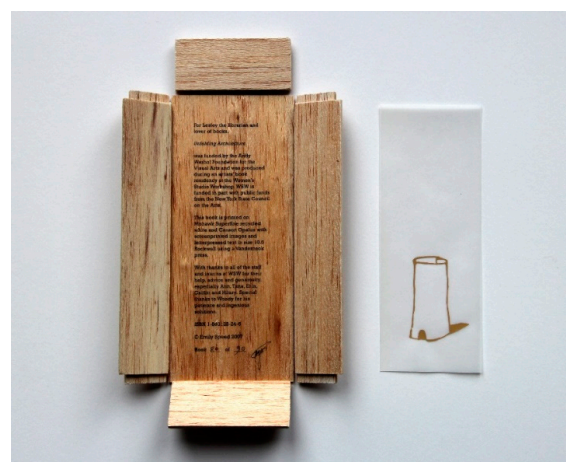
Figure 7. Unfolding Architecture case (2007) by Emily Speed. Photo by Elaine Speight. Used with permission.