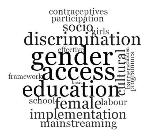
Figure A2. Word cloud of most frequent words in the selected policy documents.