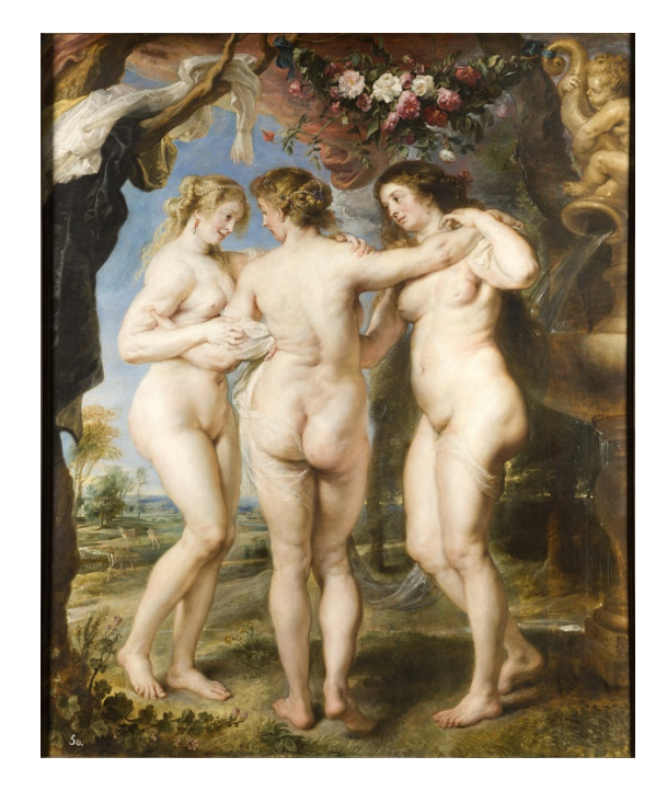
Figure 3. Peter Paul Rubens, The Three Graces , 1630–1635. Oil on oak panel, 87 \times 71 in. Image in public domain.

2020). The composition indeed makes visible the notion of in visible female labor through the revisionist, and humorous, juxtaposition of the women sitting in repose while they effortlessly overpower Napoleon, depicted here as a man resigned to his fate. García says she deliberately represented Napoleon as a "toy," a plaything, a figure explicitly designed for objectification, which suggests a crucial subversion of the visual order of European art. The mural thus unravels the modern/colonial gender system through global and feminist terms and, in so doing, unveils the problematic Eurocentric armature that has long undergirded this system. The force driving these women thus comes not from their sensuality or objectification, but rather from the subtle chaos and power that manifests from their participation in the discourse of café culture. These figures gesture to the history of female representation but do not cater to its expectations. In this way, García ascribes beauty to the female artist's commanding act of creation, not to her body. In short, García decolonizes the trope of the Three Graces, reframing virtue and femininity through action, invention, and destruction of the heteropatriarchal order.