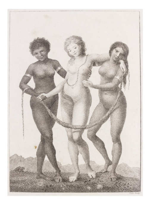
Figure 5. William Blake. Europe supported by Africa and America , 1796. Engraving, 7 2/3 \times 5 1/2 in.

liminality and overdetermined identities she must negotiate as an Afro-Chinese Cuban woman and an émigré to the US. Campos-Pons uses her body as a visual signifier of the conflations of place, access, and objecthood that have long characterized discourses of race and gender in the Americas. Finally, Peruvian artist Claudia Coca (b. 1970), whose paintings frequently portray empowered females subverting the Western artistic canon, likewise adopts the trinity motif in Las Tres Gracias (d'après Rubens) (2004), a composition that pays homage to an early, monochromatic version of The Three Graces (1620–1623) by Peter Paul Rubens in oil on wood panel. Coca perfectly restages the composition, from the putti hovering above to the fruit basket at the women's feet. Coca intervenes, however, by supplanting the white European women of Rubens's composition with her own brown body in triplicate—a gendered and racialized subversion of the art historical motif that raises questions about the artifice of the canvas, colonial hierarchies, and female agency (Buntinx 2009).