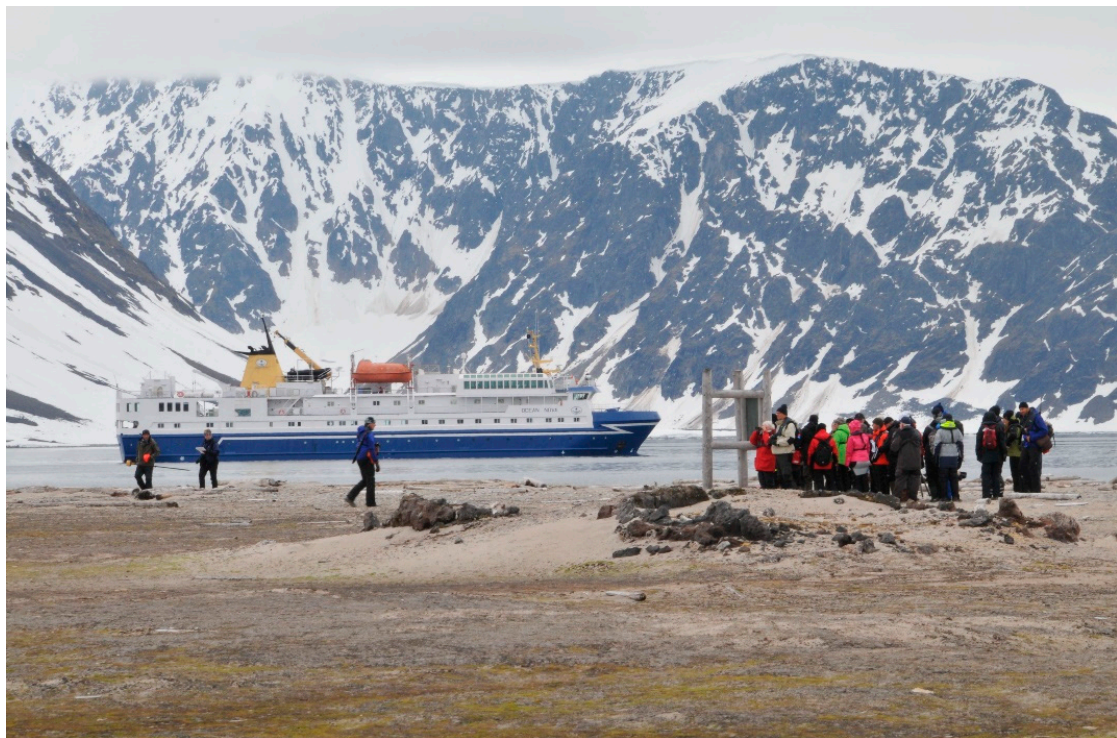
Figure 4. Cruise-ship tourists visiting Smeerenburg.