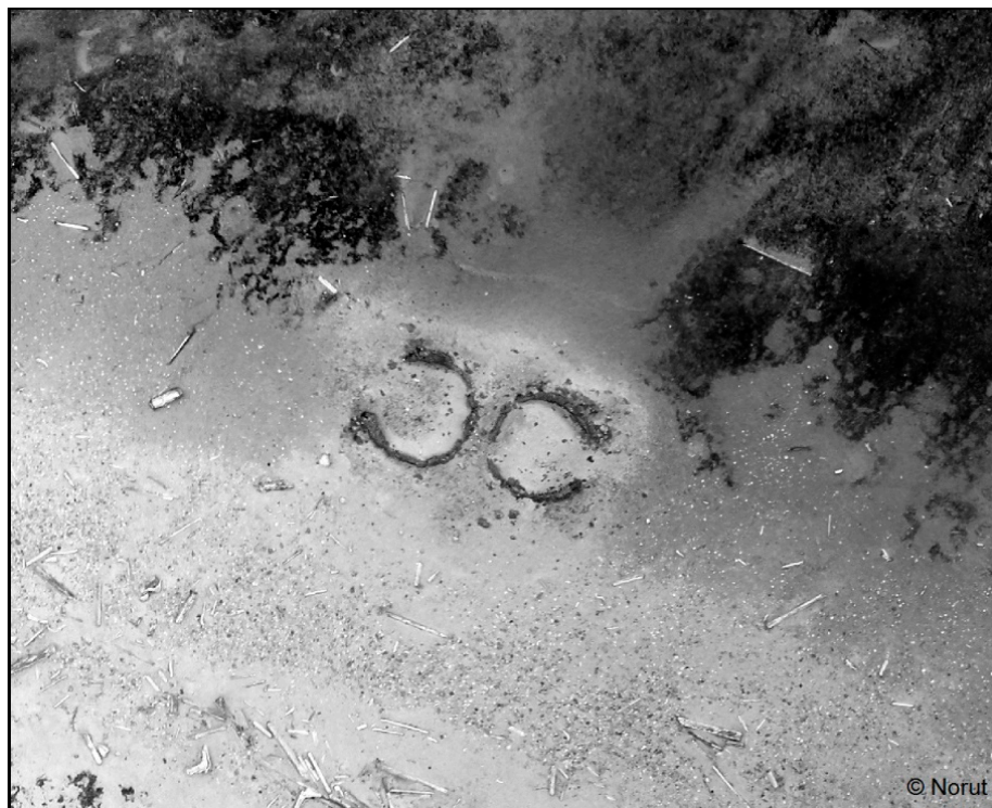
Figure 3. Smeerenburg was the main base for Dutch whaling in the 1600s. The most visible remains today are the tryworks for rendering oil, the so-called blubber ovens. Image of blubber oven remains acquired by UAS in 2014.