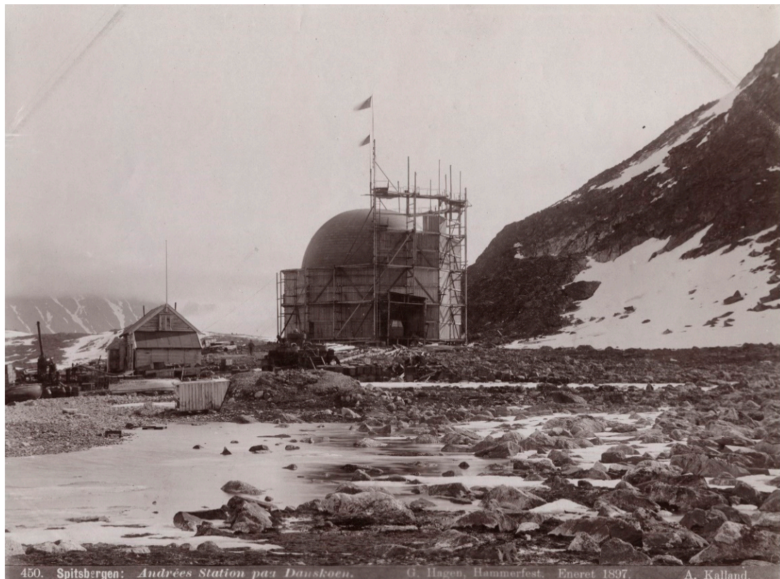
Figure 2. Virgohamna was a base for several famous expeditions attempting to reach the North Pole in the late 1800s and early 1900s. Picture taken in 1897.