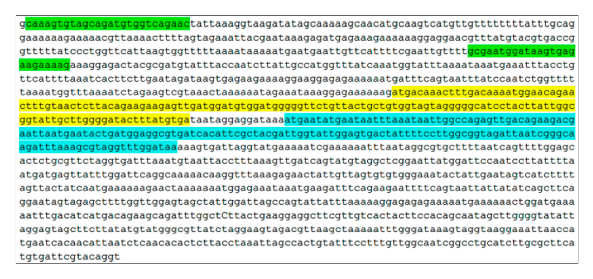
Figure 1. DNA sequence of S. downii indicating the position of the primers (marked in green) and the two open reading frames of the encoded bacteriocins in this fragment (marked in blue and yellow).