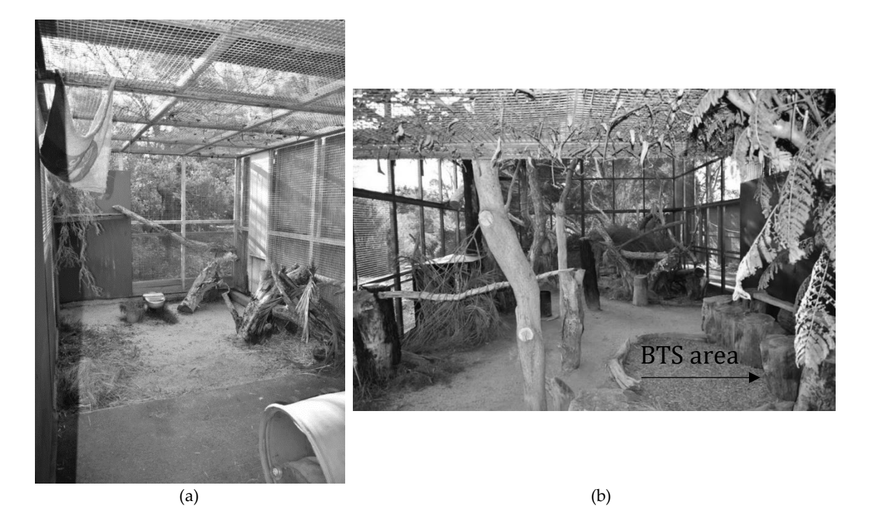
Figure 1. (a) Serval pen. The cats could move between the three adjacent pens via hatches that could be closed from the outside by the keeper when necessary. Pens were identical in size and had similar environmental features to the pen shown in the picture. (b) Serval yard with a designated area for behind-the-scenes (BTS) encounters on the right.

The servals were housed off public display and could only be seen by the visiting public during presentations or behind-the-scenes (BTS) encounters. The servals were housed solitarily and alternated between an open yard (Figure 1b) and three adjacent pens (Figure 1a). The keepers swapped the cats' housing on a daily basis. The open yard had a total area of approximately 75 m<sup>2</sup> and a ground cover of sand and mulch. The yard was interspersed with logs, elevated platforms, and climbing structures, had a covered nest with a straw bed, a drinking trough, and a designated area for visitor interaction (Figure 1b). The pens had a total combined area of approximately 36 m<sup>2</sup> and a ground cover of synthetic turf mats and sand. The pens also had elevated shelves, burlap hammocks, cat tunnels, drinking troughs, and heated beds for overnight rest (Figure 1a).