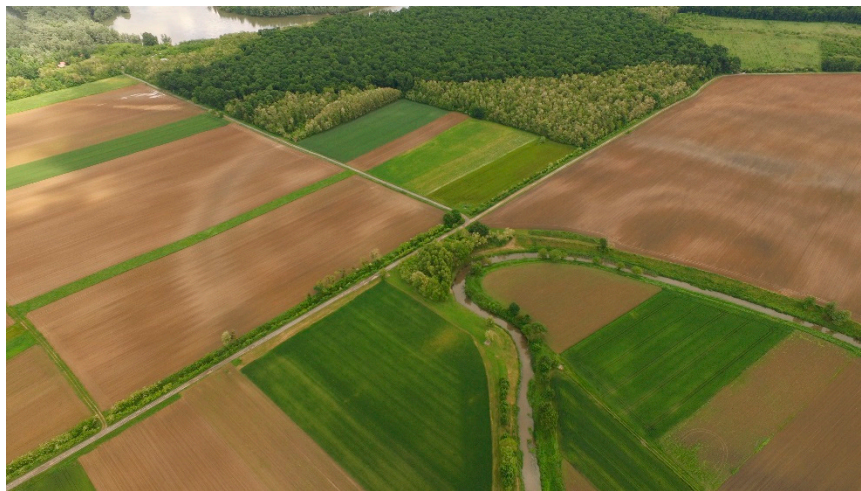
Figure 8. Site of Gat-Svetošnice on drone photography, 16 May 2016, view from the west.