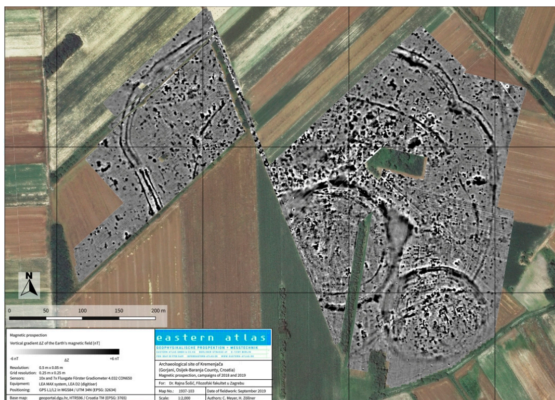
Figure 19. Gorjani-Kremenjača, results of the geomagnetic survey of the site.

This site also belongs to the “twin circle” phenomena (previously defined in [9]) with a surrounding big outer enclosure, similar to Gat and Klisa. Two ditch systems in close proximity to each other, but not overlapping, suggest their simultaneous existence. We can conclude that the smaller circle partly intersects with the outer ditch, suggesting its younger age. It is our future task to define fine chronological details in this settlement’s existence and temporal and architectural changes.