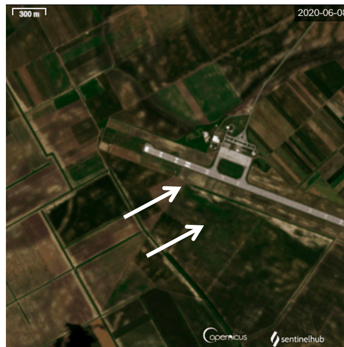
Figure 5. Site of Klisa-Groblje i Brdo on Sentinel-2 L2A, 8 June 2020. Outer enclosures are marked by arrows. Inner enclosures are visible as white colored circles under airport fence.