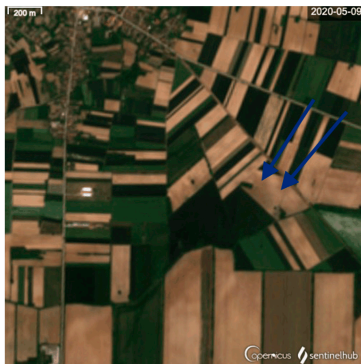
Figure 21. Gorjani-Kremenjača; shape of the part of the most outer enclosure is marked by arrows. Sentinel-2 L2A 9 May 2020. Source: SentinelHub. Contains modified Copernicus Sentinel data 2020 processed by Sentinel Hub. ©Copernicus data 2020.