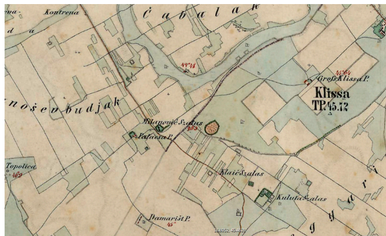
Figure 2. Klisa-Groblje i Brdo, the Second Military survey of the Habsburg Empire (1865–1869).