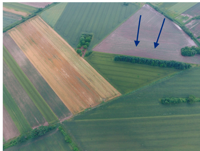
Figure 22. Gorjani-Kremenjača, drone image from 28 May 2018. Shape of the part of the inner enclosure is marked by arrows.