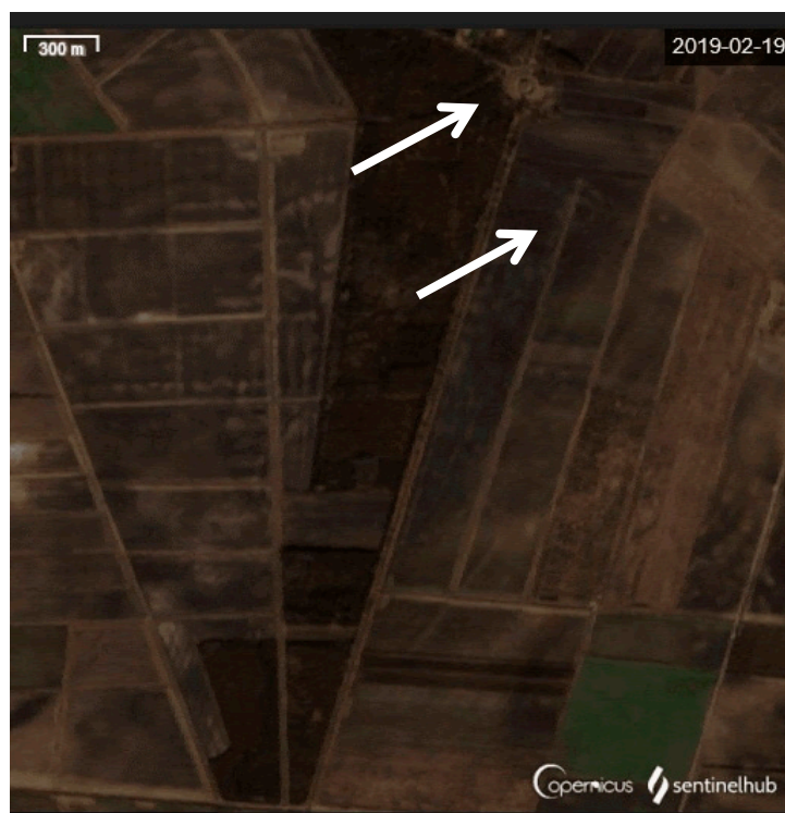
Figure 18. Site of Ivanovac-Korođvar on Sentinel-2 L2A, 19 February 2019. Medieval enclosure is marked by the upper arrow and the Neolithic enclosure is marked by the lower arrow.