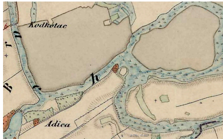
Figure 10. Koritna-Pašnik, the First Military survey of the Habsburg Empire (1763–1787).

enclosure. The visible enclosed area is 0.83 ha. The dimensions are 143 m × 80 m. The ditch width is 5 m. Koritna-Pašnik 4 is a northern single enclosure. The visible enclosed area is 0.15 ha and the visible part of the circle is 80 m with a ditch width of 5 m. Middle parts of the enclosure are 1.3 m to 3.2 m above the surrounding area. Surface finds belong to the Sopot culture. On the image from the First Military Survey of the Habsburg Empire (Figure 10) we can observe two enclosures, most probably enclosure 1 and enclosure 3 [16].