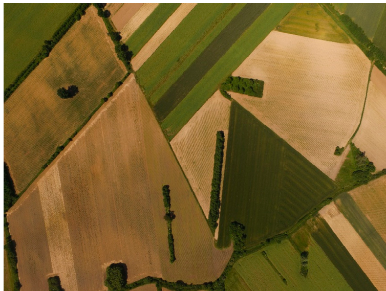
Figure 23. Gorjani-Kremenjača, oblique image from drone (photo: H. Šobat, 29 May 2015).