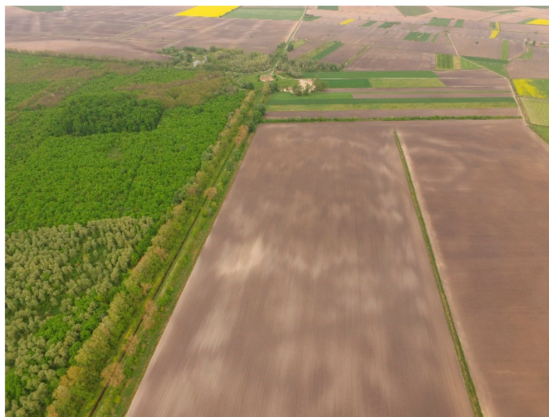
Figure 15. Ivanovac-Korođvar, drone image (photo: K. Šobat, 24 April 2018).