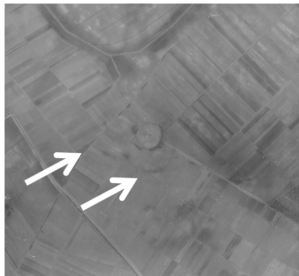
Figure 3. Klisa-Grobļe and Brdo, vertical orthophoto image before 15 February 1968. Outer enclosures are marked by arrows and inner are visible as circles.