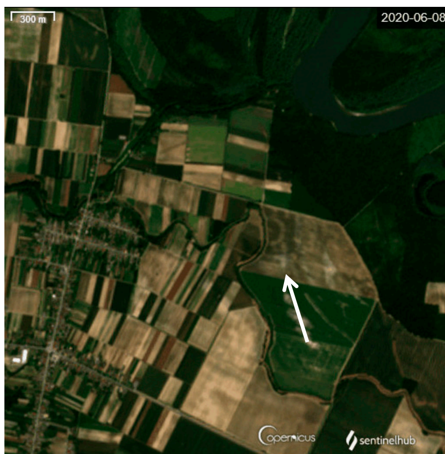
Figure 7. Site Gat-Svetošince on Sentinel-2 L2A, 8 June 2020. Outer enclosure is marked by the arrow. Inner enclosure is visible as a circle. Source: SentinelHub. Contains modified Copernicus Sentinel data 2020 processed by Sentinel Hub. ©Copernicus data 2020.