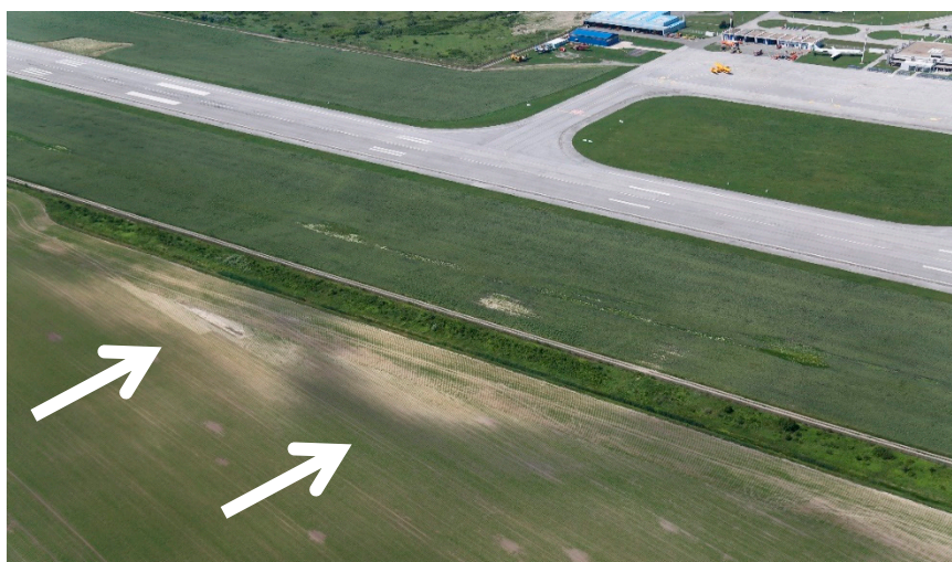
Figure 4. Klisa-Grobļe i Brdo, oblique image (2 June 2015). Inner enclosures under airport runway marked by arrows.