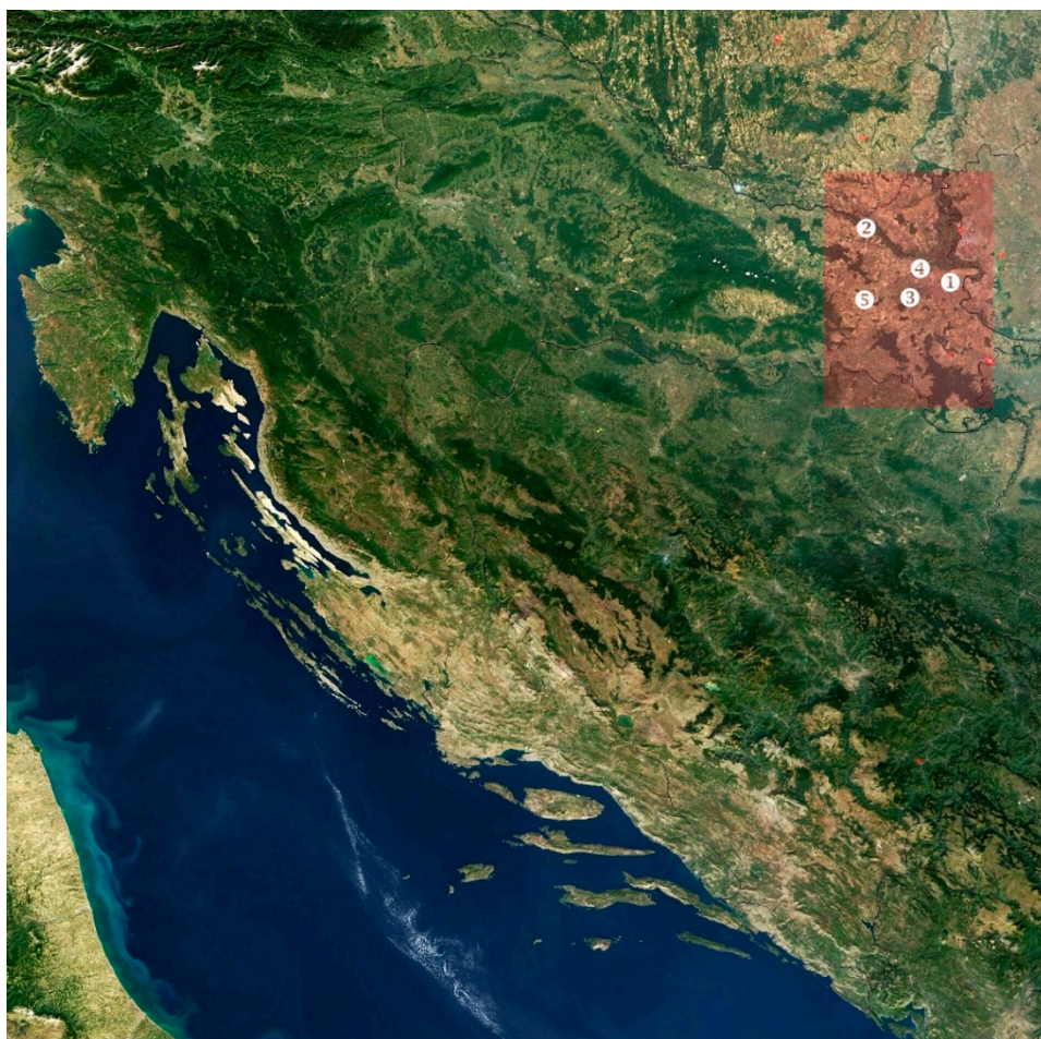
Figure 1. Position of the sites mentioned in the text on a satellite image of Croatia and surrounding areas. ① Klisa-Groblje i Brdo, ② Gat-Svetošince, ③ Koritna-Pašnik, ④ Ivanovac-Korođvar, ⑤ Gorjani-Kremenjača. Satellite image of Croatia in September 2003.