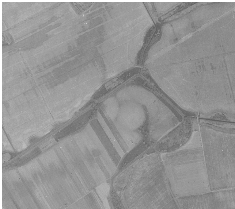
Figure 11. Koritna-Pašnik, vertical orthophoto image before 15 February 1968.