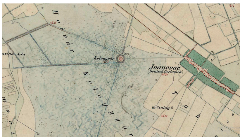
Figure 14. Ivanovac-Korođvar, the First Military survey of the Habsburg Empire (1763–1787).

1 is a northern single enclosure. The dimensions are 158 m × 202 m, covering an area of 2.5 ha, and the ditch is 10 m wide. Ivanovac-Korođvar 2 is a central single enclosure. The dimensions are 214 m × 211 m, and the ditch is 14 m wide. The area of the enclosure is 3.2 ha. On the eastern side, it was damaged with enclosure no 3. Ivanovac-Korođvar 3 is an eastern single enclosure (Figure 17). It is visible on most satellite images from Google Earth, Sentinel-2, etc. (Figures 16 and 18). The dimensions are 147 m × 160 m, the ditch width is 14 m, and it covers an area of 1.8 ha. Ivanovac-Korođvar 4 is a single enclosure. It covers an area of 0.82 ha, its dimensions are 104 m × 106 m, and the ditch width is 3 m. In its southern part, it overlaps with Ivanovac-Korođvar 2. Based on the aerial images alone, it is not possible to conclude which enclosure is older. Ivanovac-Korođvar 5 is a southern single enclosure on the area of 0.2 ha. The dimensions are 53 m × 49 m, and the ditch is 2 m wide [14,20,21].