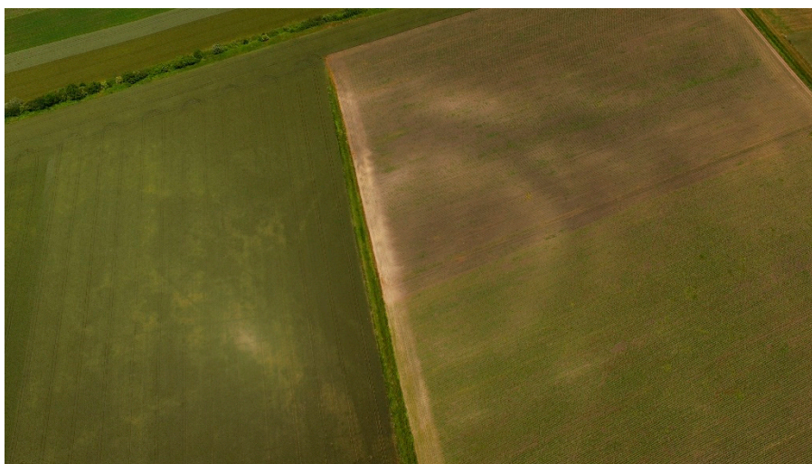
Figure 17. Ivanovac-Korođvar, drone image (photo: K. Šobat, 1 June 2016).