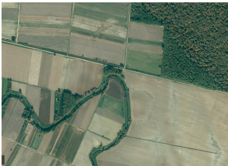
Figure 6. Site of Gat-Svetošnice on the vertical orthophoto image 2017 by Geoportal.