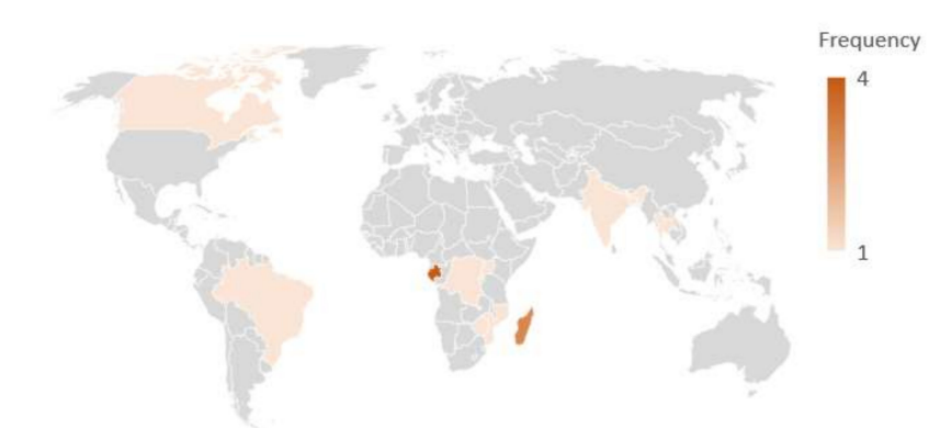
Figure 3. Location of study sites by country.

In connection with the geographic area covered in the study, our results show that more than eighty percent of studies (n = 16) took place in areas adjacent to protected areas. Regarding the IUCN category of PAs [54], sixty-three percent of studies (n = 12) took place in national parks (IUCN category II). Thirty-seven percent (n = 7) of the studies had "unknown/not applicable" IUCN categories. It is worth mentioning that the official status of protected areas cannot be used to describe how it is managed because where the customary land claims are common, law enforcement would be a challenge. Hence, activities like hunting and logging occur in some national parks despite the legal prohibitions [20].