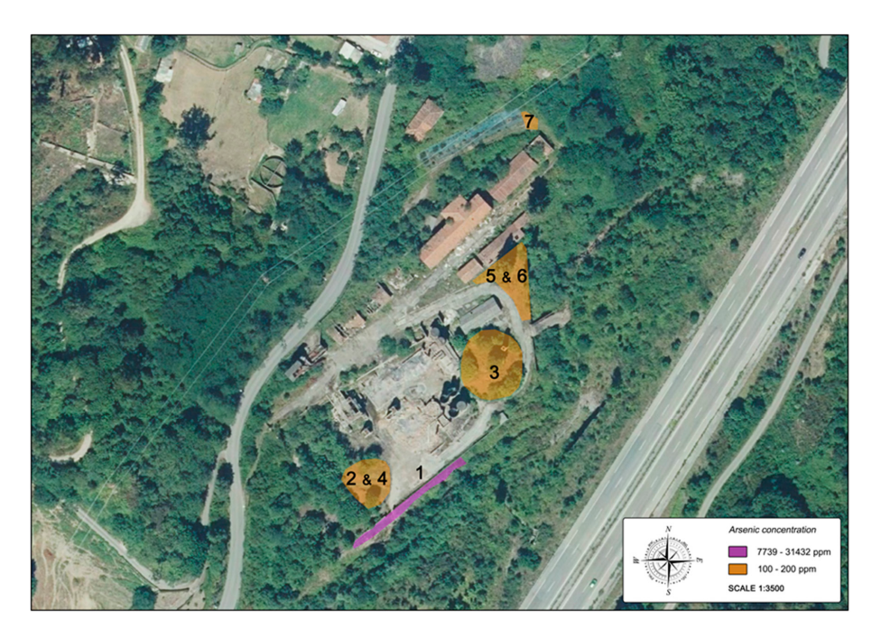
Figure 2. Distribution of sampling areas in which the highest values of CoI were found: 1 ( Calluna vulgaris ), 2 ( Betula celtiberica ), 3 ( Salix atrocinerea ), 4 ( Dactylis glomerata ), 5 ( Agrostis tenuis ), 6 ( Plantago lanceolata ) and 7 ( Trifolium repens ).

Total As, Hg, and Pb concentrations in soils and plants (aerial parts and roots) corresponding with the areas with maximum CoI (Figure 2) are shown in Table 4.