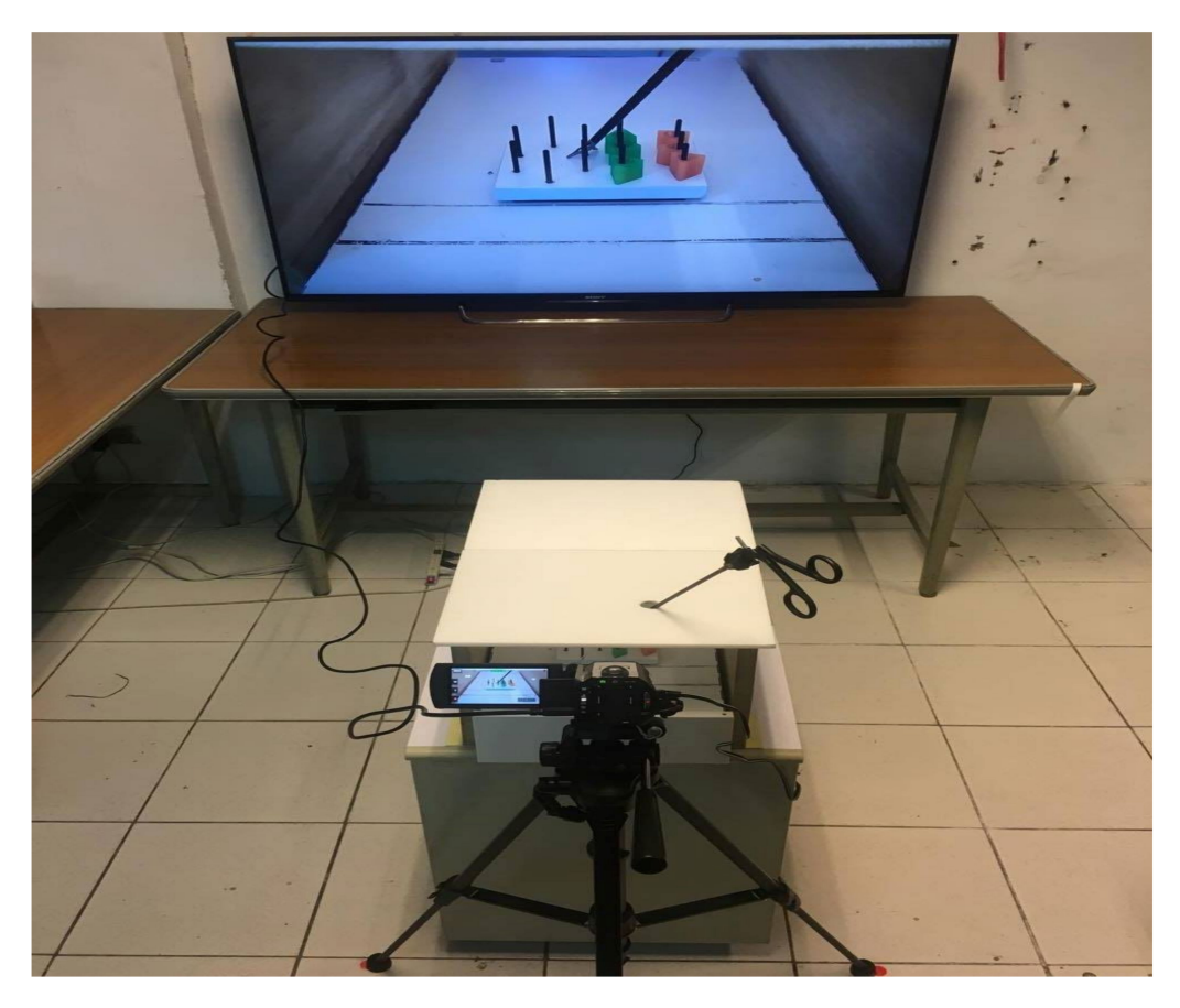
Figure 2. Peg transfer task.