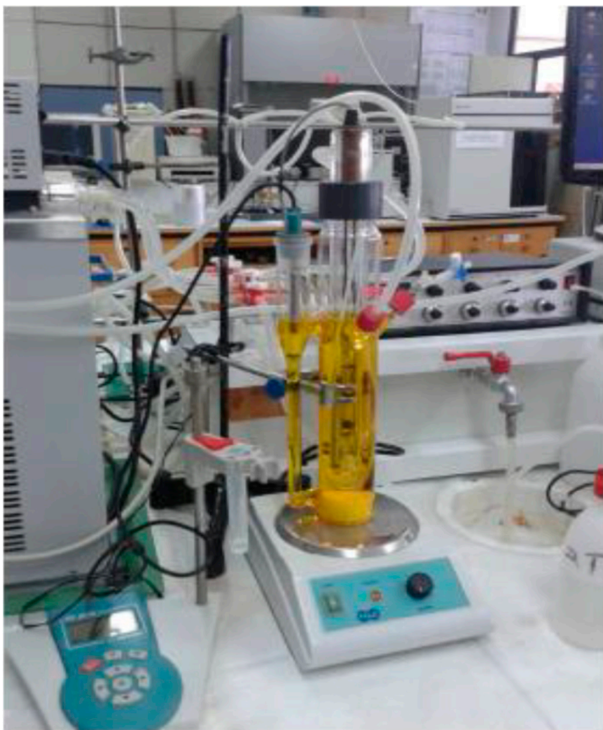
Figure S1. Photocatalytic reactor (Heraeus) with the TQ 150 lamp situated in a glass cooling jacket filled with re-circulated deionized water and immersed in the reaction mixture.