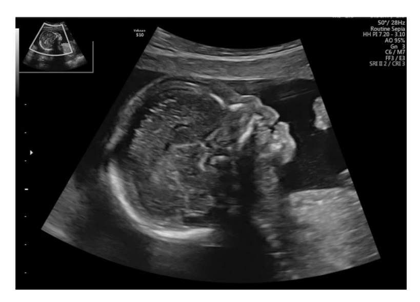
Figure 2. Fetus with Pallister-Killian syndrome.

detected in our study, facial dysmorphia, such as a flat profile or a small nose, is described either prenatally or postnatally. Gu et al. described rare chromosomal aberrations in cases with nasal bone hypoplasia and congenital malformations, such as Cri-du-chat syndrome (del 5p15.33p14.3 and dup 5q35.3), Smith-Magenis syndrome (del 17p11.2), duplication 17q23.3q25.3 (rare pathogenic CNV) and deletion 9q31.2 (CNV of potential significance) [10]. Nasal bone hypoplasia has already been described several times in fetuses with Cri-duchat syndrome; in fact, in the second trimester, nasal bone hypoplasia may be the only symptom of Cri-du-chat syndrome [3,13,14]. However, Cri-du-chat syndrome is typically characterized by more abnormalities; indeed, our case with Cri-du-chat syndrome (deletion 5p15.33p15.32 and duplication 11q22.3q25) was characterized by nasal bone hypoplasia and micrognathia, together with ventriculomegaly and abnormal posterior fossa. Nasal bone hypoplasia is often observed in syndromes with a characteristic facial dysmorphism. Liberati et al. reported Pallister-Killian syndrome with a diaphragmatic hernia and characteristic flat profile and small nose [15]. In our case with Pallister-Killian syndrome, nasal bone hypoplasia, abnormal profile, diaphragmatic hernia and ventricular septal defect were diagnosed (Figure 2).