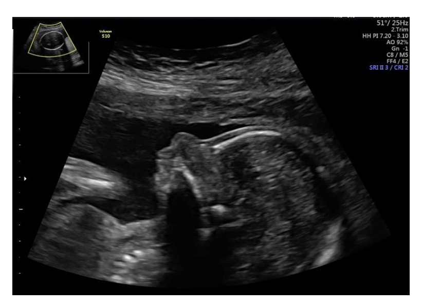
Figure 4. Fetus with focal dermal hypoplasia.

Cleidocranial dysplasia (MIM 119600) is characterized by hypoplastic/aplastic clavicles, a brachycephalic skull, midfacial hypoplasia with a low nasal bridge, abnormal tooth development and other skeletal abnormalities. Prenatal diagnosis of cleidocranial dysplasia has been described in several reports [11,25]. Chen et al. described a case of cleidocranial dysplasia, associated with nasal bone hypoplasia; the fetus demonstrated mild shortness of the femur and absence of a nasal bone at 22- and 31-weeks gestation. The authors concluded that prenatal observation of nasal hypoplasia in chromosomally normal fetuses should prompt a careful search for skeletal dysplasia [26].