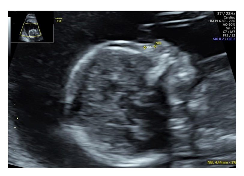
Figure 3. Fetus with tetrasomy 9p.

Tetrasomy 9p also reveals characteristic facial features, including hypertelorism, ear abnormalities, cleft lip and/or palate, broad nasal root or bulbous nose and micrognathia [19,20]. In our study, we present two cases with 9p amplification. First, with nasal bone hypoplasia, cleft lip together with abnormal posterior fossa and ventricular septal defect were diagnosed (Figure 3). Second, 9p duplication and 22q11 duplication, were characterized by nasal bone hypoplasia, ventriculomegaly, and functional changes in the heart.