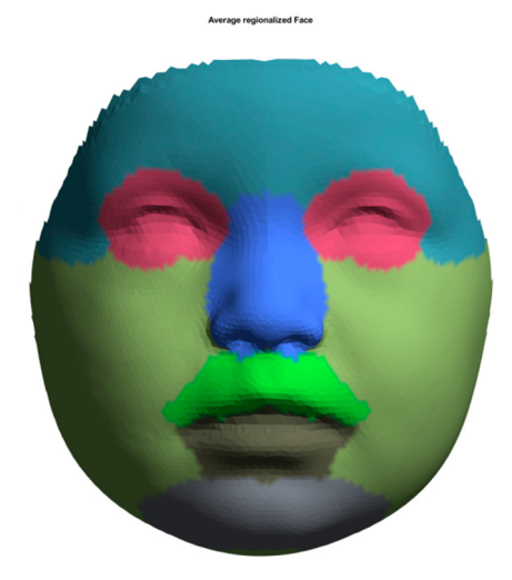
Figure 1. Selected areas for assessing facial development and growth: forehead (light steel blue), eyes (rose), nose (royal blue), upper lip and subnasal (lime green), lower lip (anthracite), cheeks (olive green), and chin (grey).

Average faces were generated for 3 (T1), 9 (T2), and 12 months (T3) of age. The comparison of the average faces at the defined time points (T1 to T2 and T2 to T3) was visualized by color-coded maps.