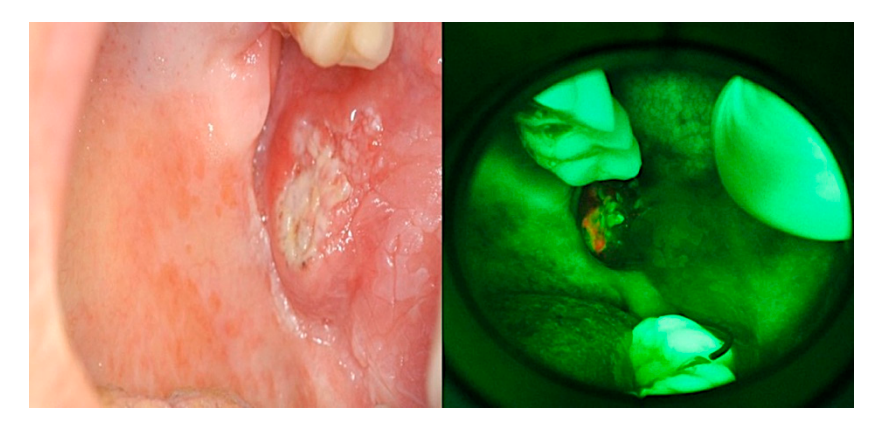
Figure 3. Clinical appearance of the painful suspected lesion on the right buccal mucosa in a 63-year-old female smoker patient and appearance of the VelScope exam of the same lesion characterized by LAF and associated red/orange coloring typical of secondary bacterial contamination.

On histological examination, 15 (42.9%) of 35 biopsied lesions were malignant, and the other 20 (57.1%) were benign. The suspected clinical diagnosis (benign/malignant) made by both GDs and the VelScope data were compared with the histological results. As seen in Table 2, sensitivity, specificity, PPV and NPV of u-GD for detecting OPMDs are 53.3%, 65%, 53.3%, 76.5% respectively, while the same parameters for s-GD are 73.3%, 65%, 61.1% and 76.5% respectively. Differently, when both examiners use an adjunct device the values of sensitivity, specificity, PPV and NPV change in the following way: for u-GD they were 53.3%, 70%, 57.1%, 66.7%, conversely for s-GD they were 86.7%, 90%, 86.7% and 90% (Table 2).