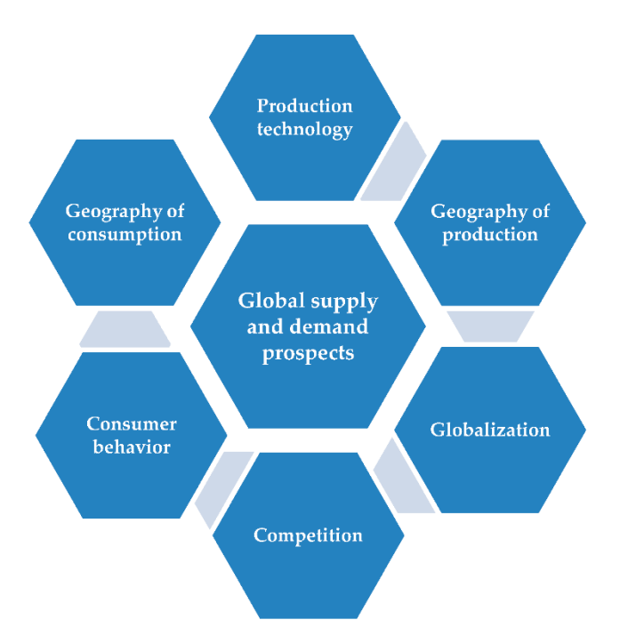
Figure 1. Main foresight factors in the Delphi study.

Special attention was paid to drafting the questionnaire since it is the other central piece of the Delphi study together with the expert panel. The questionnaire was carefully constructed to address the different aspects synthetized in the analytical model. Several preliminary versions were elaborated to improve the design process through identifying and removing linguistic and conceptual ambiguity. The questionnaire comprises a set of semi-open questions relating to the likely future scenarios of the global olive oil industry in terms of supply, demand, and international trade challenges. Semi-open questions are questions where the respondents are required to evaluate a set of pre-prepared response options, with the possibility of adding their own freely reported perception of the question theme [37]. This type of question combines open and closed question formats [38,39], allowing the possibility of eliciting different assessments of the offered alternatives and/or new perspectives from the respondents. In our questionnaire, each question contains a section for including additional comments on aspects that might have remained undiscovered. Compared to the open-ended questions, semi-open questions require less time to respond, thereby making the task easier for the experts and allowing the maximization of the rate of response.