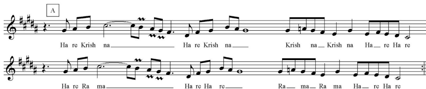
Figure 6. Melody A.

The melody that Jahnvi chooses to open with, however, is perfectly suited to the expansive and somewhat rhythmically flexible character of the early, meditative section of a piece with progressive energy. The melody she chooses (labeled in Figure 6 as melody A) has a wide melodic range, and rises to a long, high, held note—both of which Henry names as traits of music with intensity.