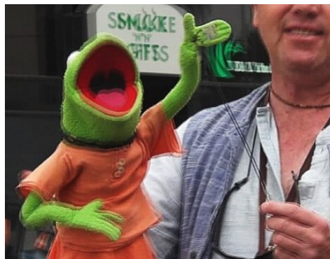
Figure 2. Muppet Devotion.

Next, we can read the whole scene as a creative blend of cultural signifiers. The celebration of the Hindu festival Ratha Yatra by a multi-ethnic crowd of Westerners in Indian clothing and South Asians in Western clothing, all of them singing the Indian music known as harikirtan while en route to a famous California beach, was in itself an exercise in cultural exchange. However, there was also a sort of wink and a nod in the combination of signifiers present. Jagannath, the deity on the cart, is revered by many Hindus as an incarnation of the god Vishnu. Some, including the Gaudiya Vaishnavas who organized this parade, conceive of Vishnu and all other gods including Jagannath as incarnations of Krishna, whose pastime herding cattle is one reason why cows are considered sacred by many in India. The emoji-like faces on the smiling cow balloons reflected this connection to Krishna, while also signaling a certain lightheartedness in the deployment of recognizable cross-cultural and pop culture signifiers—as, of course, did the presence of Kermit the Frog sporting the robes commonly worn by gurus and devotees.