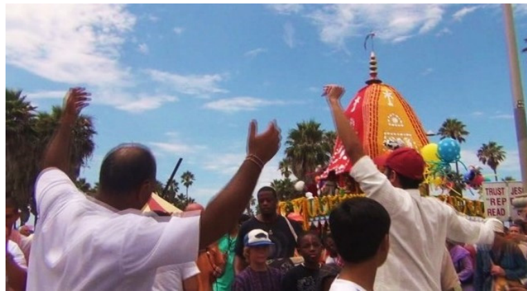
Figure 1. Dancing before Jagannath's cart.