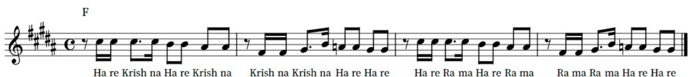
Figure 11. Melody F.

After twenty more minutes and several more changes in melody accompanied by distinctive shifts in energy, Jahnvi introduces one more new melody, transcribed in Figure 11 as F, which is sung at a relatively high pitch range and features an angular rhythmic and tonal character. These musical characteristics create the impression of a spontaneous outburst and a sensation of great freedom.