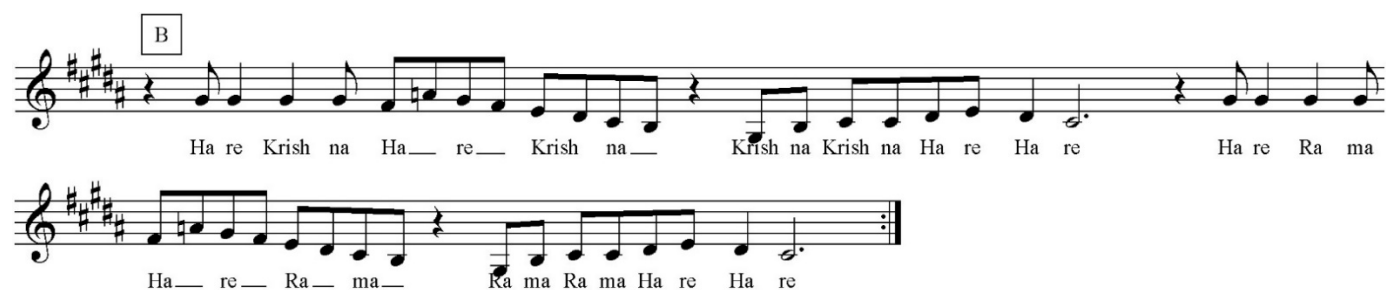
Figure 7. Melody B.

Both singers and drummers relax into a steady mid-tempo groove after about ten minutes when Jahnvi introduces a more rhythmically regular melody B, as shown in Figure 7.