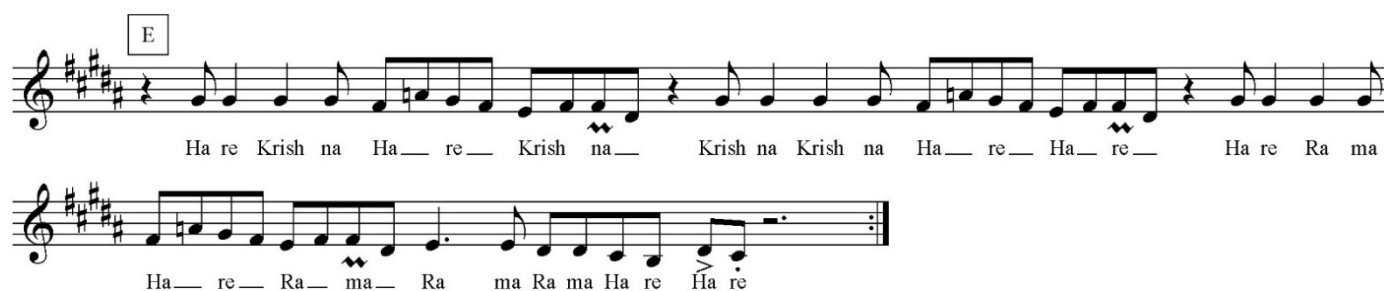
Figure 10. Melody E.

After ramping up intensity and speed through melodies C and D, Jahnvi makes a marked break in tempo, reining the music in to about 126 BPM, and introducing a variant on melody B, transcribed in Figure 10 as E. Here, she repeats the first phrase of her melody—a phrase that desperately wants to resolve tonally. However, she withholds the resolution three times, finally ending with an abrupt and percussive “Rama Rama Hare Hare!” Meanwhile, the dancers in the back add a heavy dipping step to their dance in order to match the groovy, off-kilter feeling of this melody.