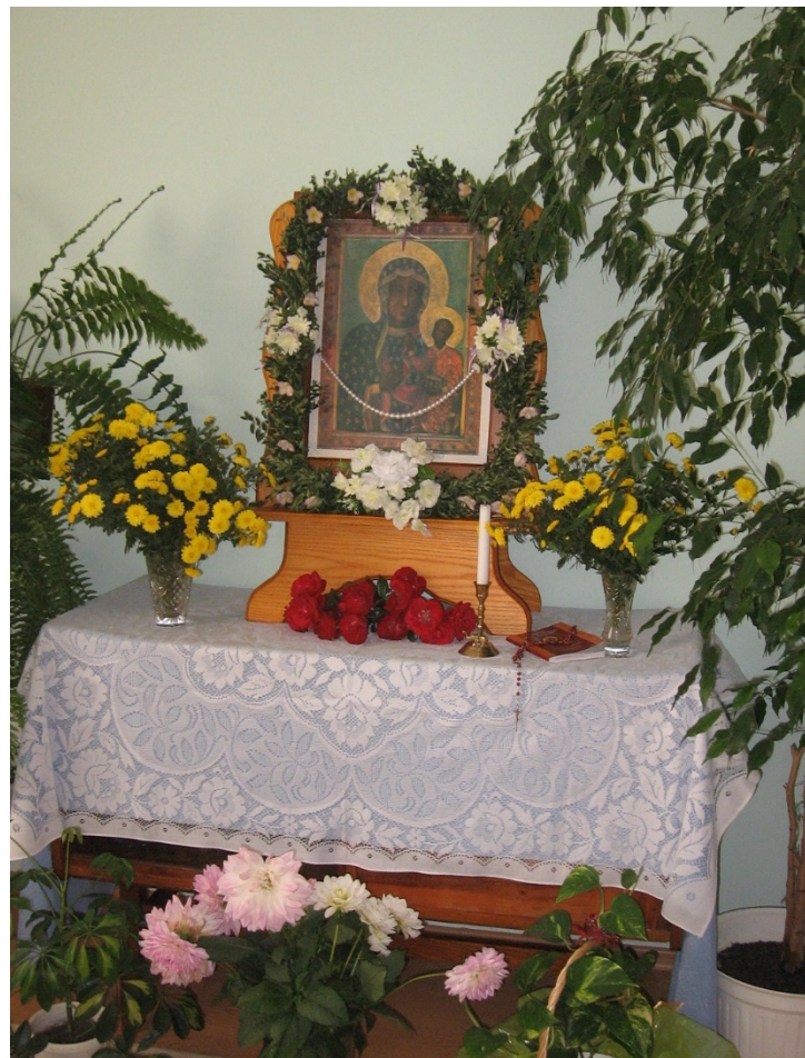
Figure 5. A small copy of the image of Our Lady of Czestochowa kept for a one-night vigil in a private home during a peregrination, central Poland; 2008, photo by Agata Banach.

The peregrination exemplifies the mediation of the transcendent based on the production of the holy in religious objects. This takes place through the complex aesthetic interactions people have with these objects. The community bonding—organized around the image of Our Lady of Czestochowa—operated as both “experience near” (the closeness and intimacy visible especially during peregrination to private homes) and “experience far” (historical anniversaries depicted as “national events” and celebrated at Czestochowa in front of the original image) 8 . This combination of “national” and “private” and “far” and “near” turned into a potent community bonding tool. The peregrinating image of Our Lady of Czestochowa united people, binding and empowering the Catholic community in Communist Poland. The interrelationship between the power ascribed to Mary and Mary’s power experienced by her devotees can be understood here in terms of “cogent connections” when