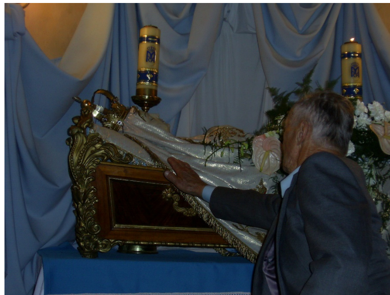
Figure 1. Mary’s statue exhibited in an open coffin during a vigil in the “Mary’s House”, Kalwaria Zebrzydowska, August 2005; photo by the author.

blessing”, the rosaries and images are passed back to their owners, who will take them home as precious souvenirs and religiously meaningful objects.