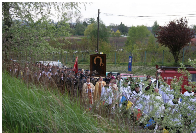
Figure 4. A peregrination of the copy of the image of Our Lady of Czestochowa, Klimontów, near Kraków, 2008; photo by the author.

Indeed, peregrination progressing year by year in various regions was designed to embrace the whole country and appeared to be a huge success for the Catholic Church. Ritual was lived on both individual and communal levels, combining affective experiences of a “real encounter” with Mary—materialized and mediated in her image—with community bonding. Catholic inhabitants of villages or city districts gathered on their parishes’ borders to welcome a “car chapel”. After the car arrived, the image was kissed, unloaded and carried in a procession to a local church for a night vigil and celebrations on the following day (Figure 4). Soon, smaller copies of the image were prepared and sent for circulation in private homes. This “small peregrination”, in parallel with events organized at the parish level, resonated with people’s private emotional experiences and deeply inscribed the image of Our Lady of Czestochowa in lived Mariology. During my ethnographic research, the small peregrination was often recalled by people and described in very emotional terms 7 . The image was usually placed in the main rooms, decorated with flowers and ex-votos, and treated as a “real guest” and a “visiting mother”, someone who could “listen to your sorrows while you could tell her your problems” during intimate night vigils. Mary, as a “real figure”, was constructed in the sensual, corporeal and emotional responses people had when interacting with the peregrinating image (Figure 5).