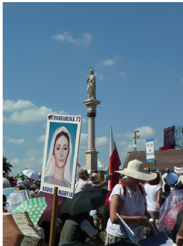
Figure 6. Annual pilgrimage of the “Family of Radio Maryja” to the Jasna Góra/Częstochowa shrine, July 2010; photo by the author.

Each July, a massive national pilgrimage of the “Family of Radio Maryja” is organized at Częstochowa, where an open-air Mass is celebrated for around 100 thousand pilgrims who arrive by bus from various regions of Poland (Figure 6). Another annual pilgrimage takes place in December to celebrate the “birthday of Radio Maryja” in the city of Toruń, where the radio is located. Here, the radio initiated the construction of a new immense shrine (2012–2016) dedicated to “Our Lady the Star of New Evangelization and Saint John Paul II”. At this shrine, a copy of the image of Our Lady of Częstochowa—originally owned by Pope John Paul II—is venerated and exhibited in the center of the church, which is designed as a replica of the Vatican papal chapel.