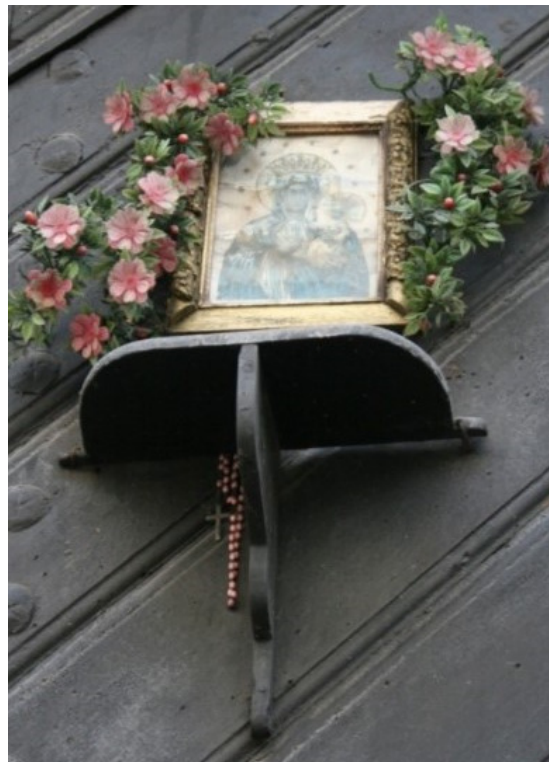
Figure 3. Image of Our Lady of Częstochowa, decorated with flowers and a rosary, on a building gate in Kraków (Poselska Street), 2008; photo by the author.

represented in her pictures. Here, representation refers to “an autonomous reality”, a specific “emanation” of Mary, which does not reduce or limit her figure (“the original”) but makes her present through multiple and diverse forms of religious pictures. These pictures bring a specific ontological “overflow” or an “increase of being” (Gadamer 2004, p. 135). As autonomous realities, images can interact with human beings. Their materiality shapes these interactions in a form of “sensation” understood as “an integral process, interweaving the different senses and incorporating memory, and emotion” (Morgan 2010, p. 8). The intimate relations that people build with holy images—seen in shrines but also kept at homes as cherished private souvenirs, usually small and inexpensive copies brought from holy sites—should be treated as a significant and meaningful part of lived Mariology that establishes Mary in people’s lives, forming their imaginative and practiced worlds within private and communal domains (Figure 3).