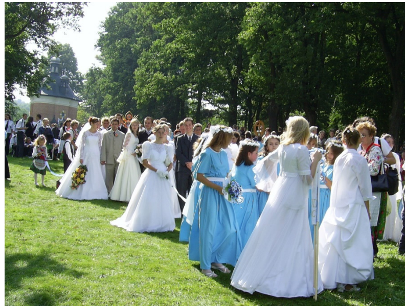
Figure 2. Formation of “Mary’s funeral” procession in front of the “Mary’s House” in Kalwaria Zebrzydowska, August 2008; photo by the author.

on lived religion in general, which refers to “religion as practiced rather than religion as prescribed” (Hermkens et al. 2009, p. 3).