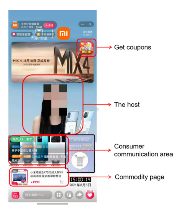
Figure 1. An e-economic live streaming page in Taobao.

augmenting consumers' intimacy and satisfaction with target goods [5]. The hosts, the main executors of live streaming, carry out a new type of online sales with the characteristics of promoting consumer participation and purchase [6], and can also be called streamers or broadcasters. Studies of the hosts that execute live e-commerce primarily includes two dimensions—the charm of the host and the trust in the host. First, the interaction between consumers and the host in live broadcasting can stimulate impulsive consumption [7]. Thus, hosts can be primarily categorized into stars and online hosts (usually the Key Opinion Leader, Hereinafter referred to as KOL). Stars have huge popularity and strong fan appeal, whereas KOL host has discrete personal characteristics and professional skills in vertical fields. Alternatively, KOL hosts can offer a professional presentation of goods to customers based on their understanding [6]. Furthermore, all hosts should be credible and professional [8] so that they can effectively communicate with consumers and influence their purchase intention [9]. In order to make it easier to understand, the present paper gives a common e-commerce live steaming page in Taobao and marks the main elements (see Figure 1 for details).