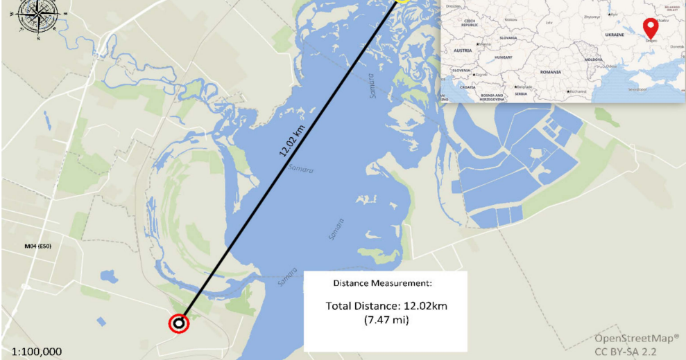
Figure 1. A map of the sampling site. The yellow circle indicates the sample sites; the red circle indicates the enterprise location; the dark line is drawn at a distance of 12,020 m from the source of pollution (enterprise for the production and processing of batteries in Dnipro city in Ukraine) to the sample site. The insert map is a map of Ukraine. The red symbol indicates the city of Dnipro. "CC BY-SA 2.2".

It should be noted that in the "Northern" industrial zone, which includes the enterprise for the processing of rechargeable batteries and the factory for the production of rechargeable batteries, there was also an enterprise for collecting scrap ferrous and nonferrous metals. The other enterprise, via the exploitation processing, potentially affected the studied area. In general, the studied territory was transformed due to anthropogenic activity [30]. The research site was located at a distance of 3.3 km from Novomoskovsk Pipe Plant and 50.0 m from the M04 (E50) highway, which may affect the concentration of metals in soil and plants, and thus the results obtained.